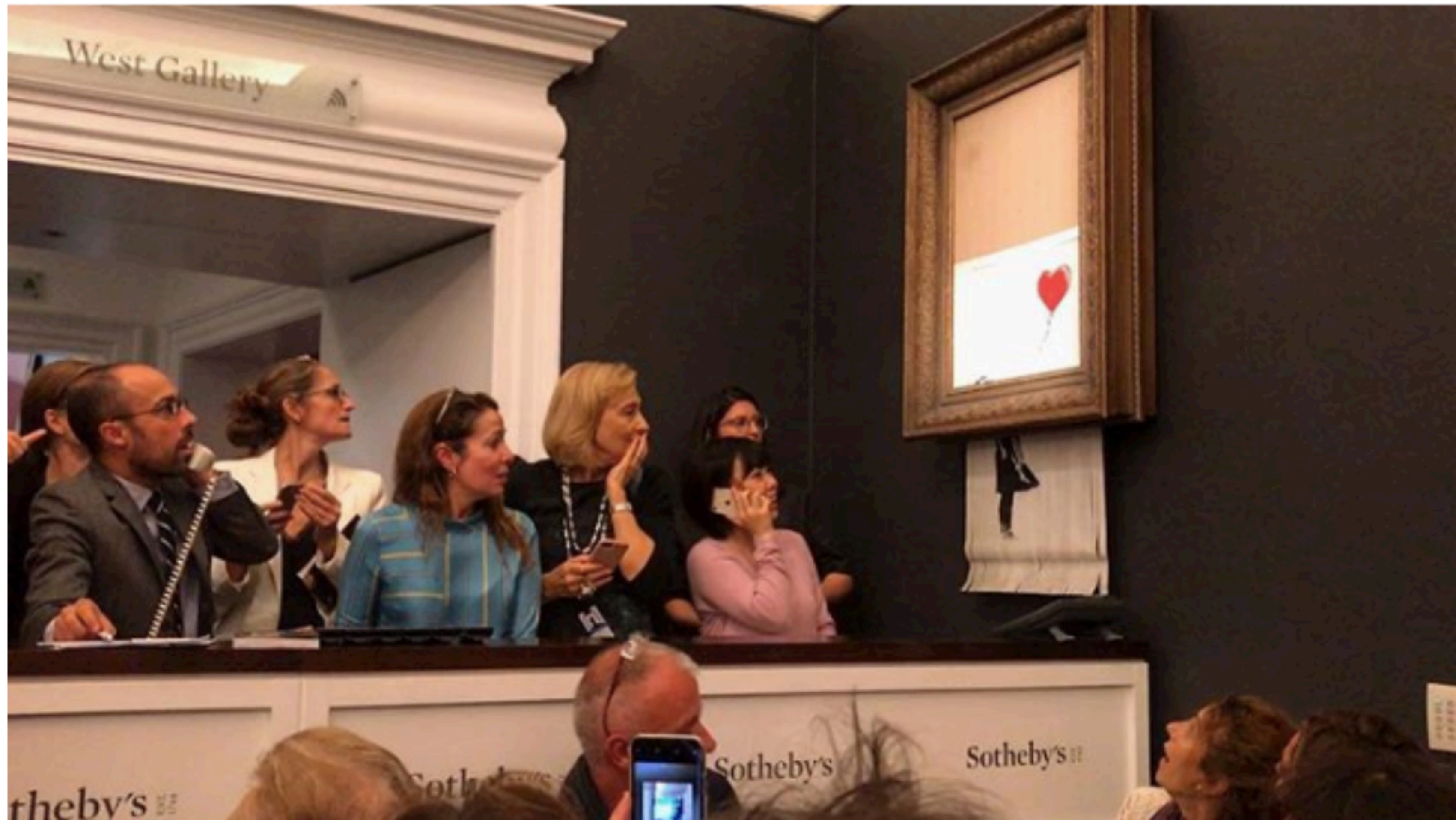
Surprised onlookers react as Banksy's Girl With a Balloon self-destructs at Sotheby's.