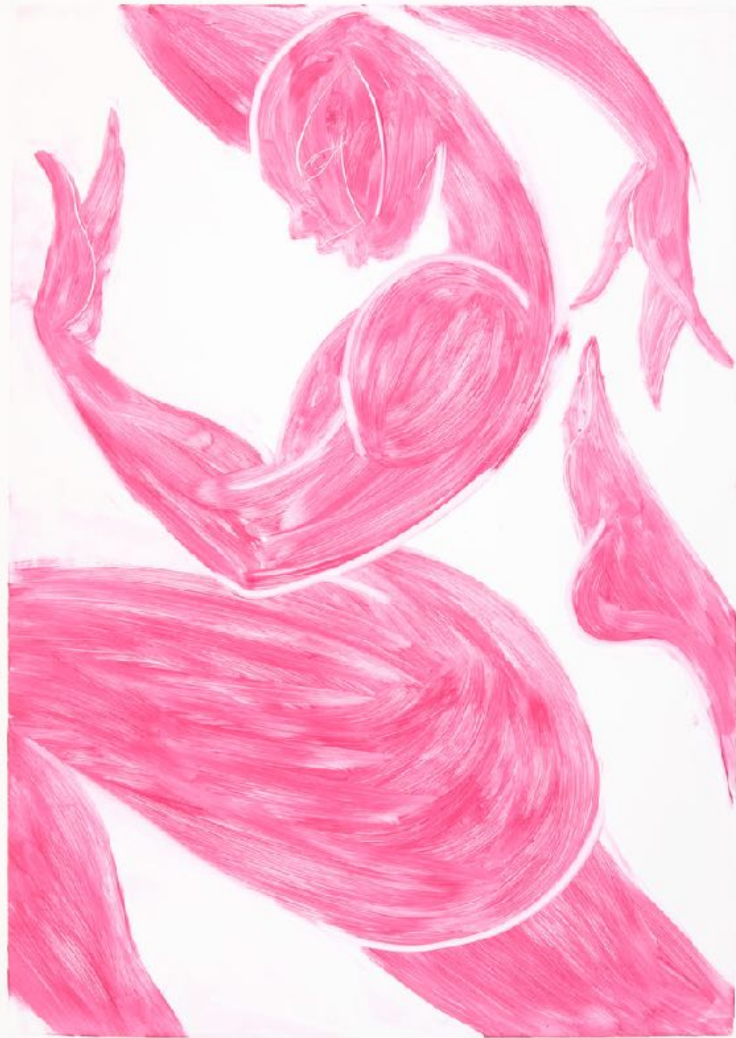
'Magenta Reflections', 2021.