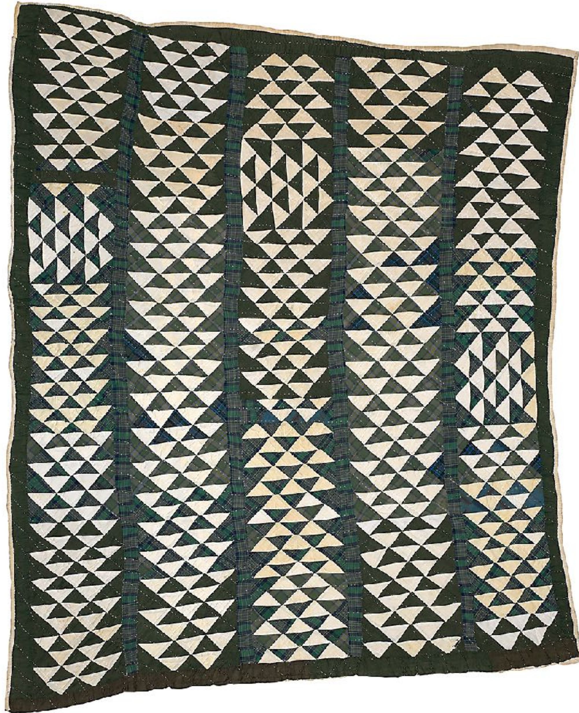
"Birds In Flight" Variation