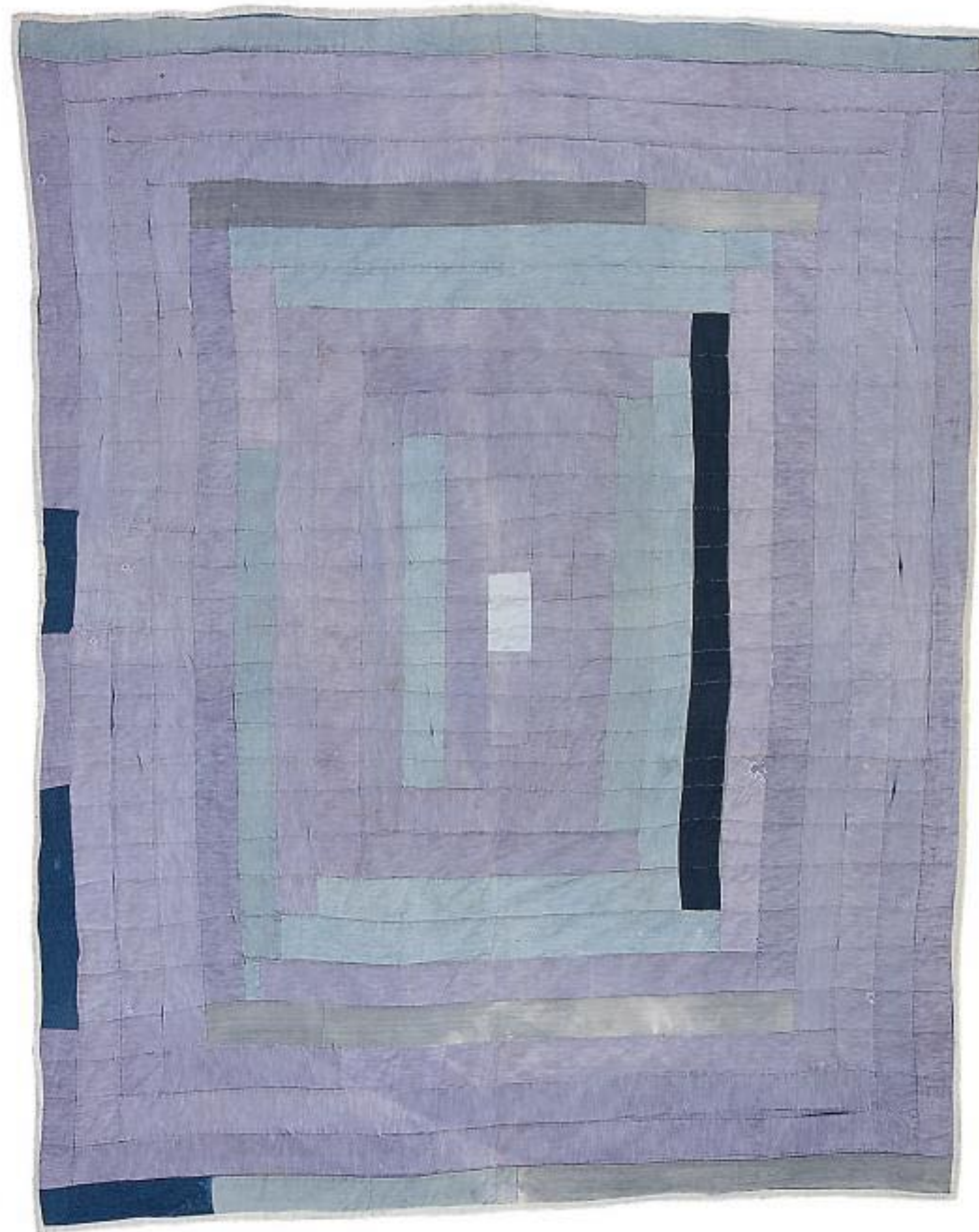
Medallion Work-Clothes Quilt