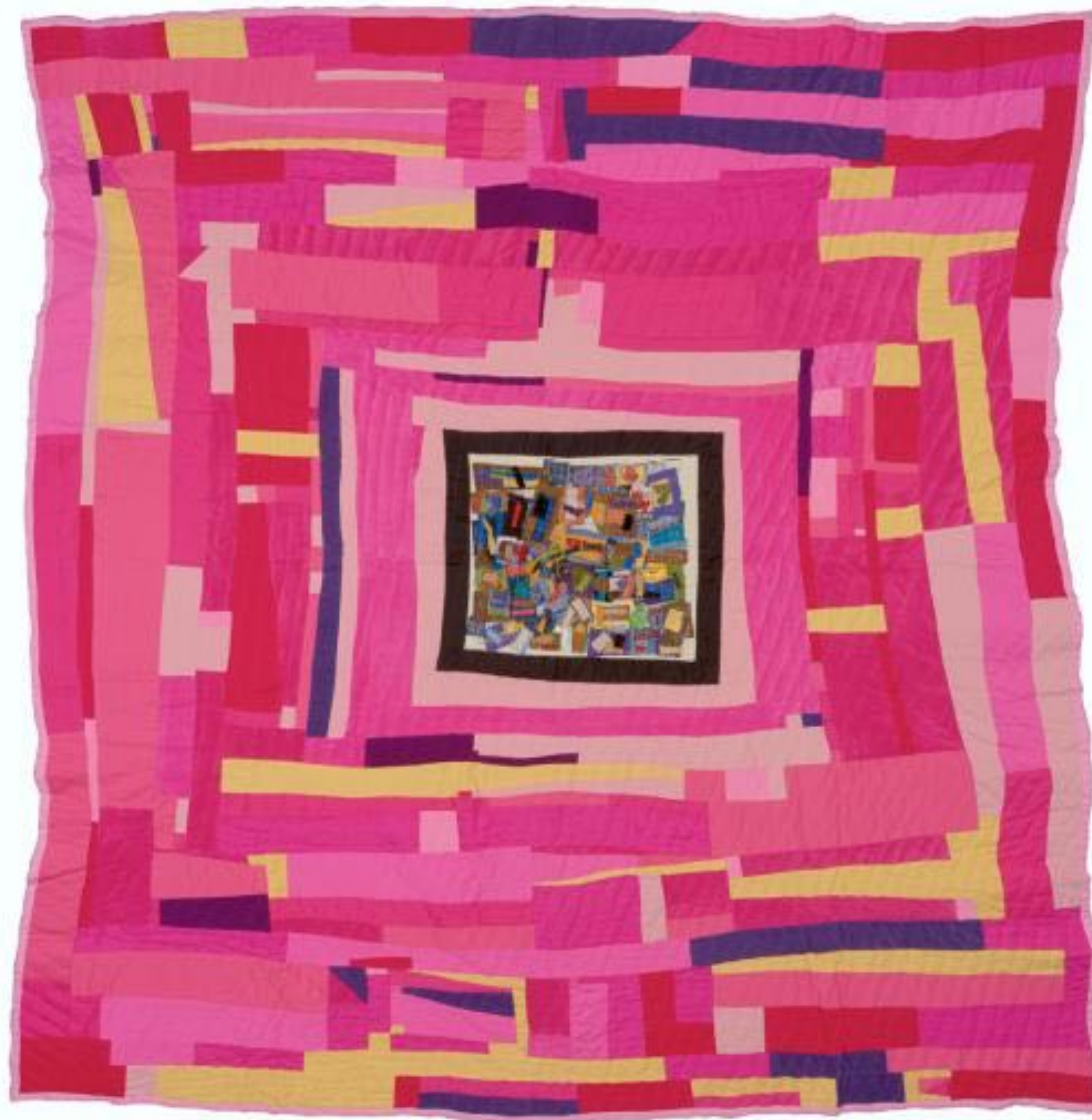
"Housetop" Variation With Center Medallion