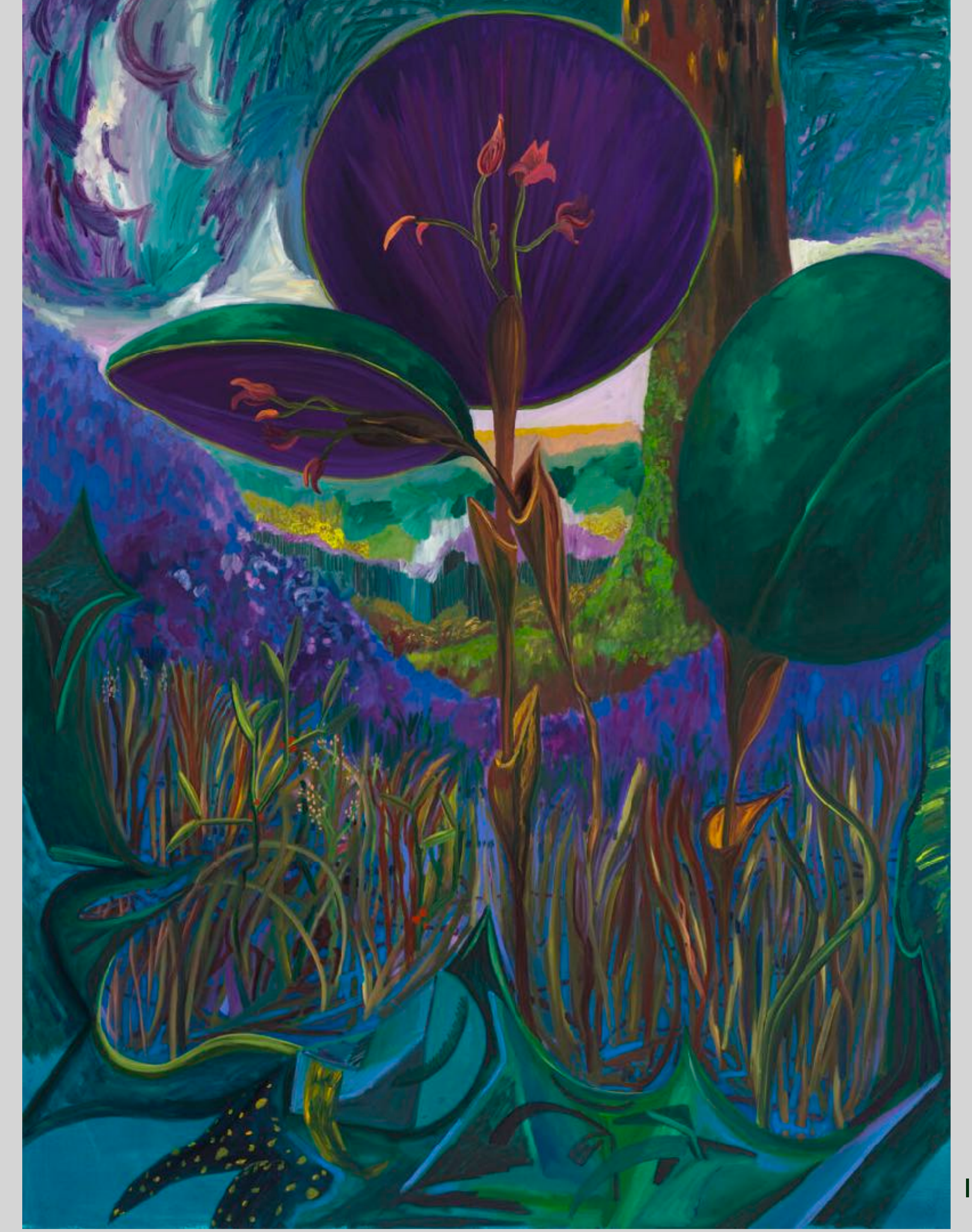
Image: Shara Hughes, Hard Hats, 2021, oil and dye on canvas, 243.8 x 182.9 cm, 96 x 72 in.