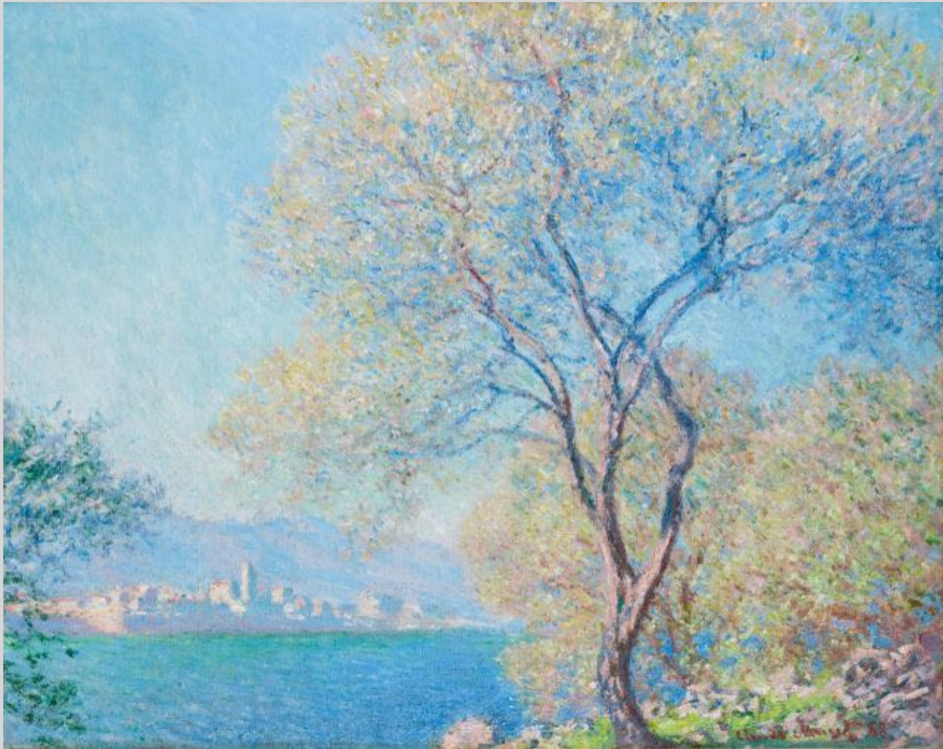
Antibes Seen from La Salis. Oil on canvas, 1888