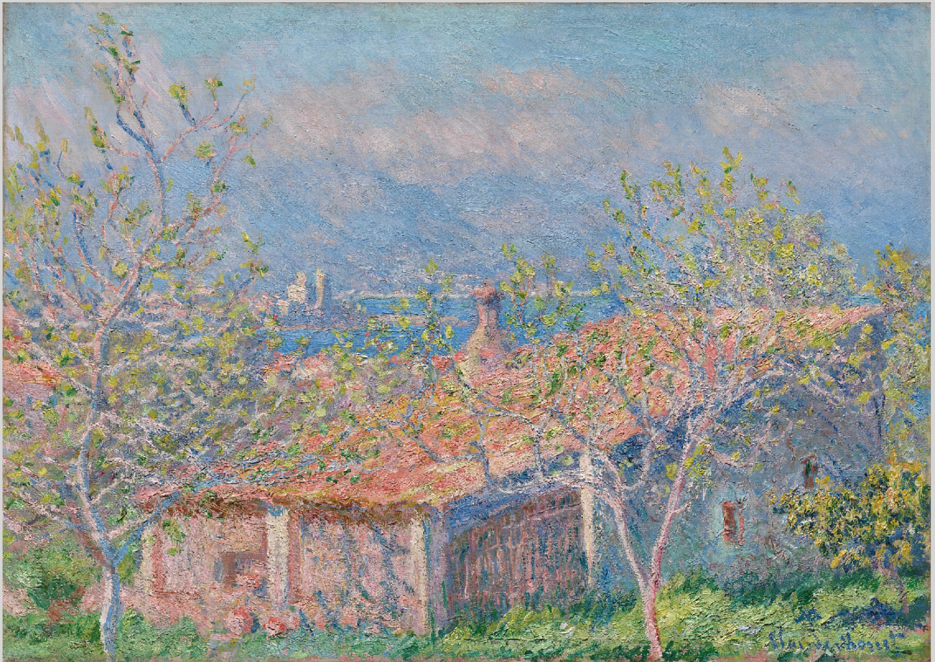
Gardeners House at Antibes, 1888