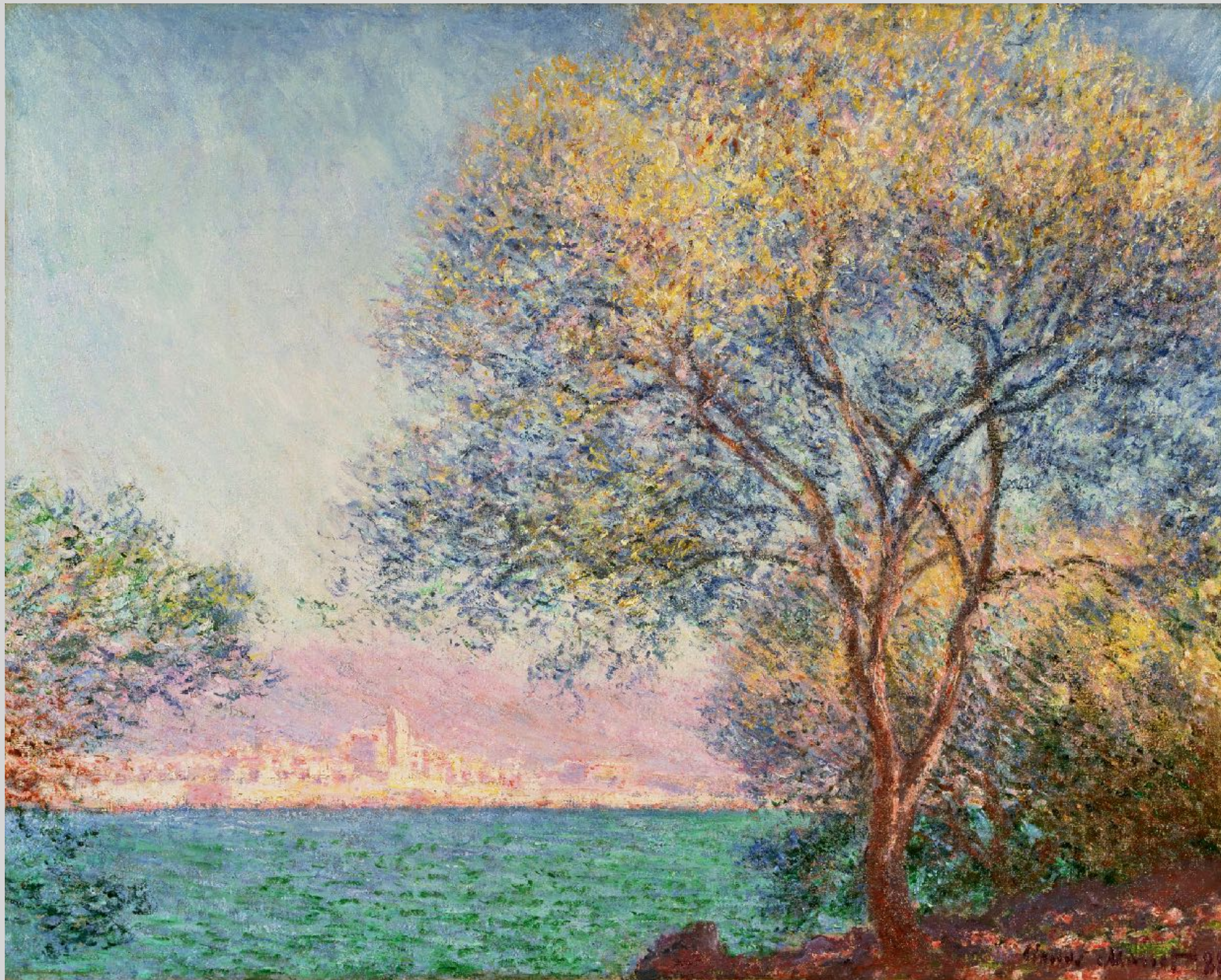
Antibes in the Morning, 1888