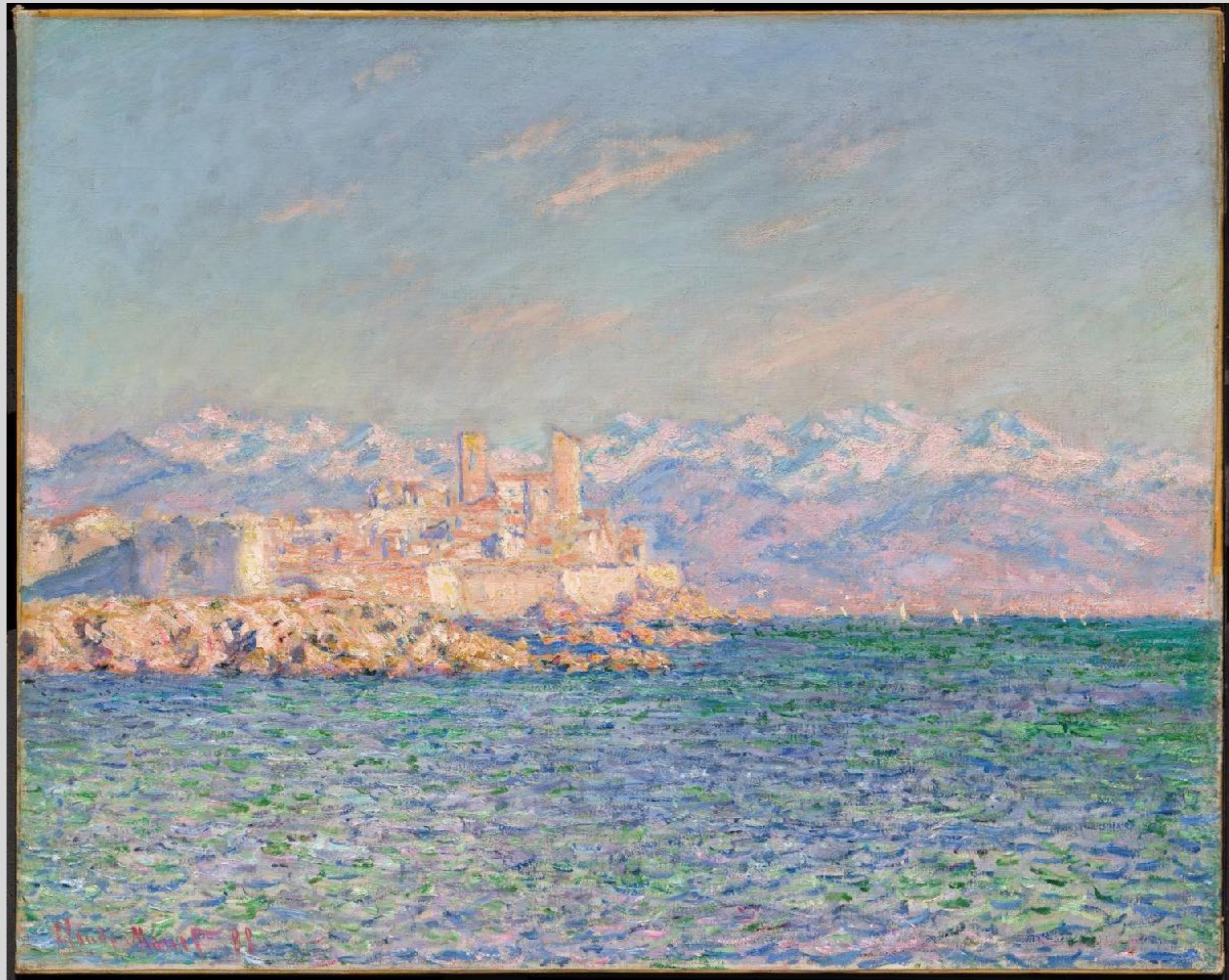
The Fort of Antibes, 1888