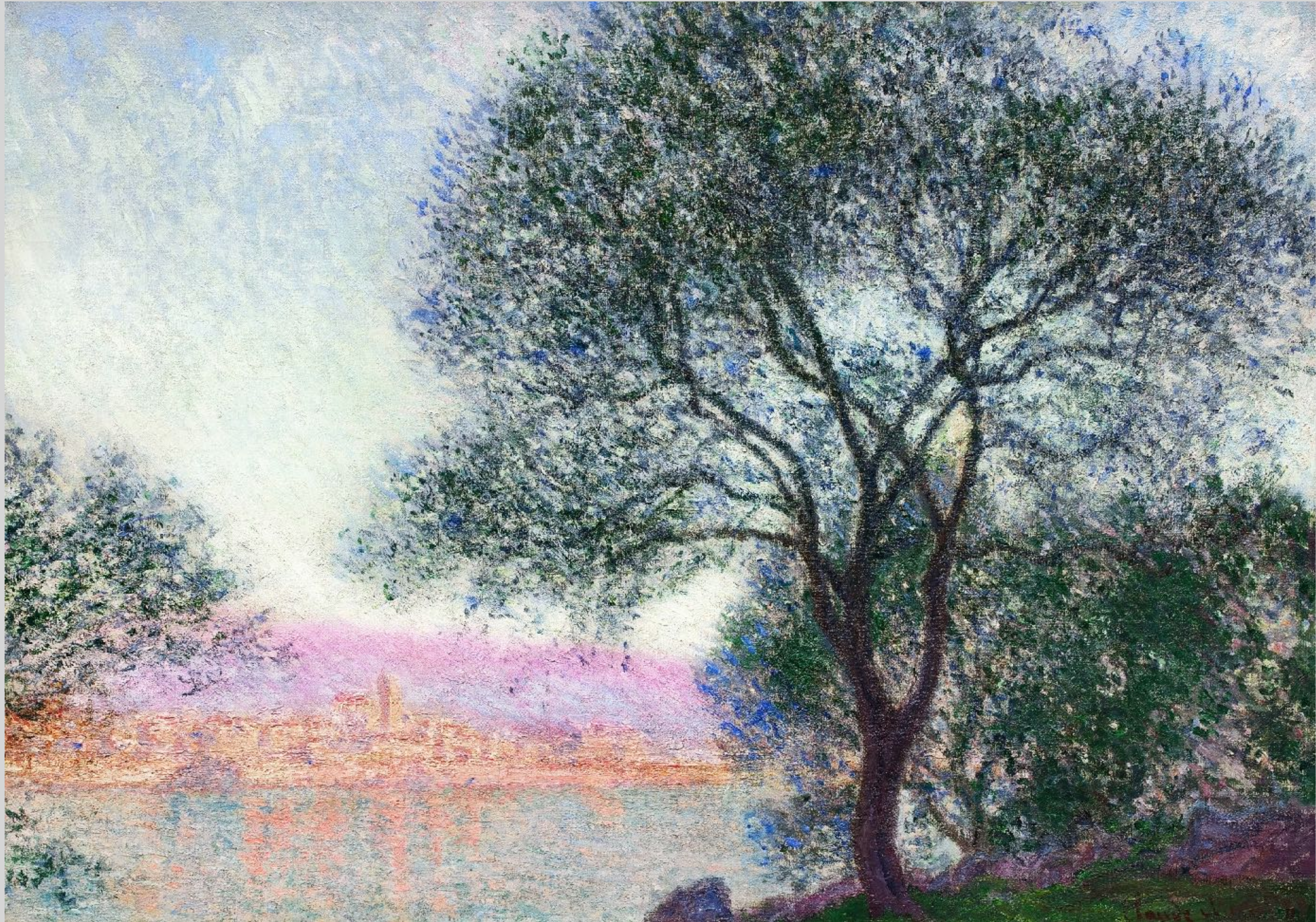
Antibes vue de la Salis, 1888