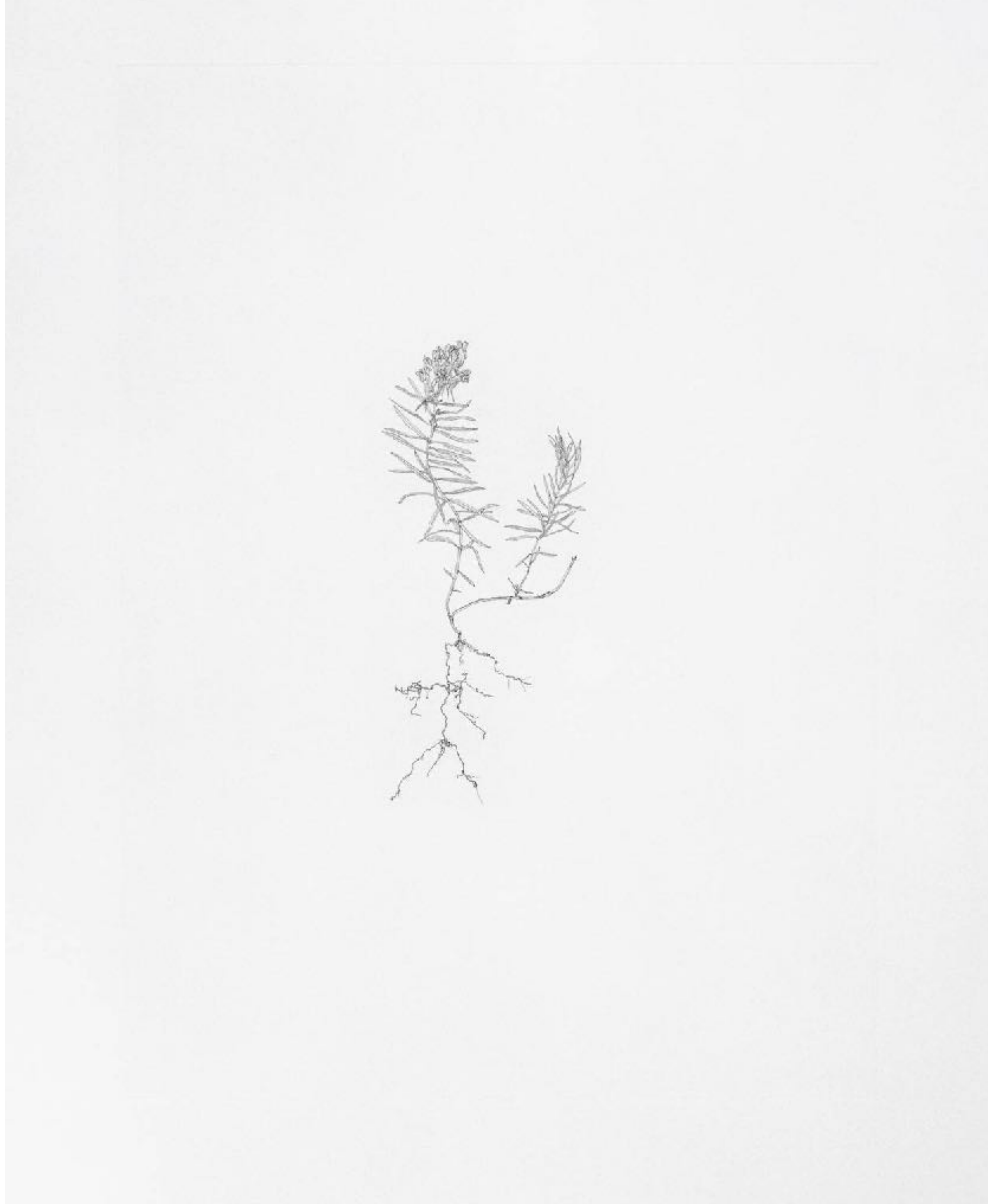
Common Toad Flax. 2002