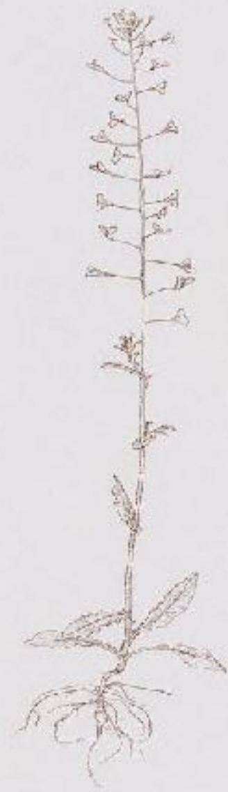
Shepherds Purse 4. 2002