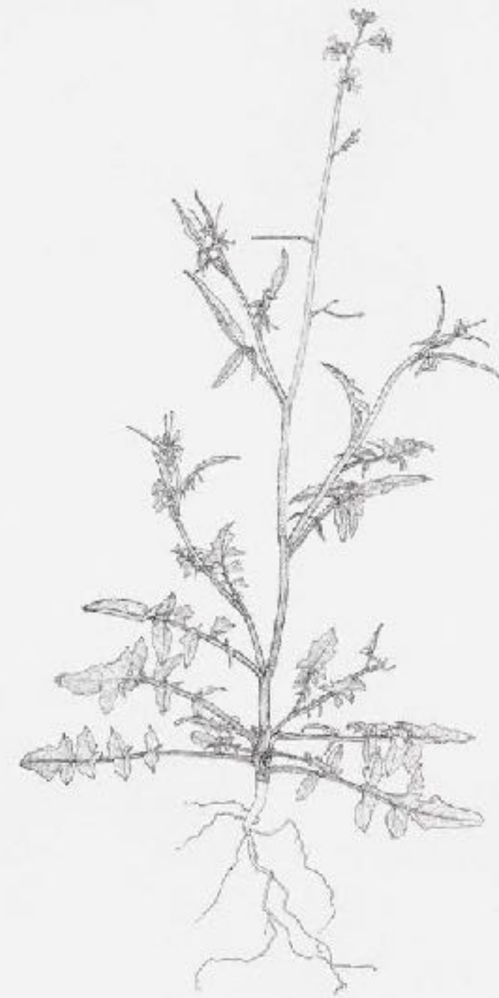
Annual Wall Rocket. 2002