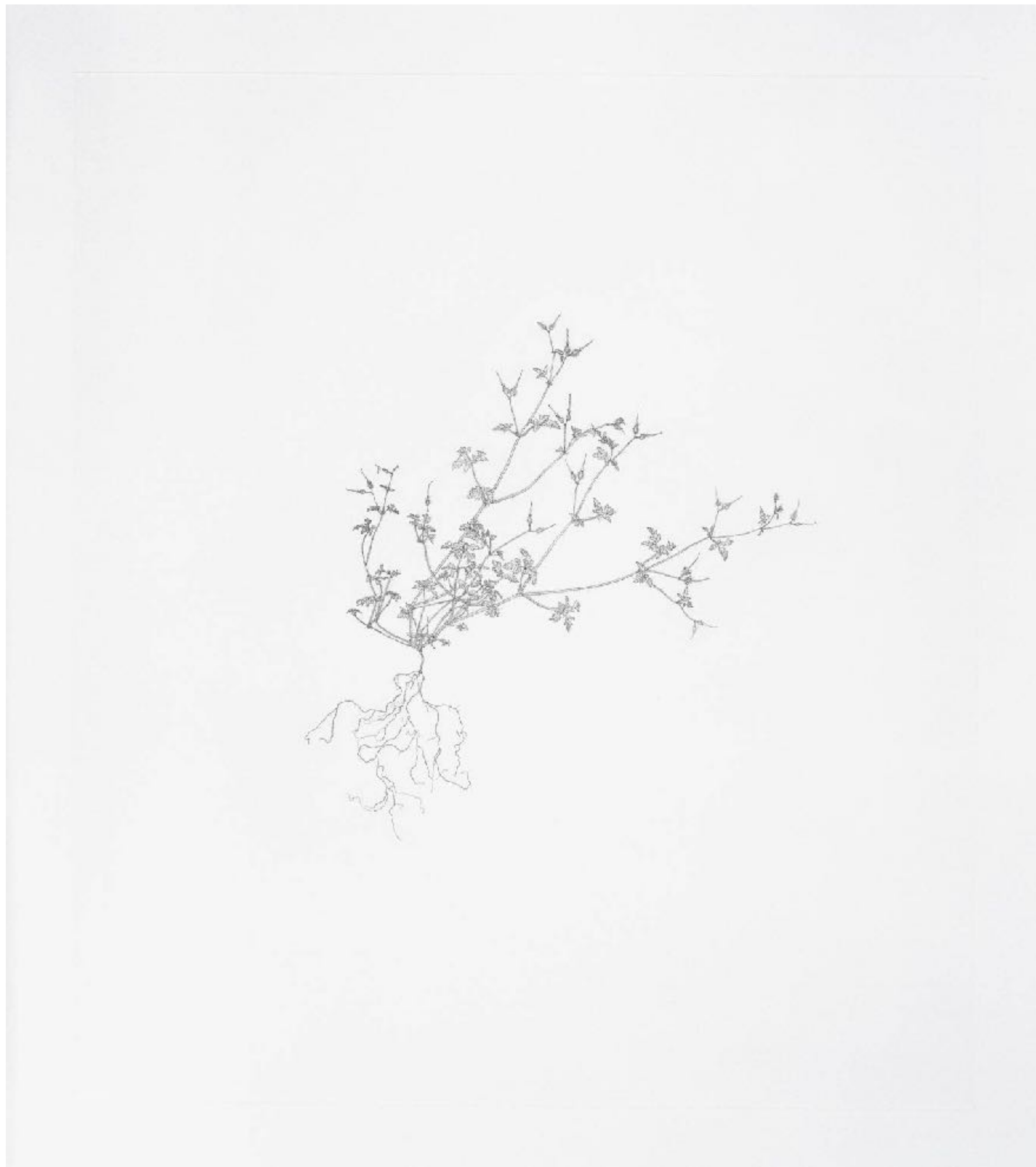
Herb Robert. 2002