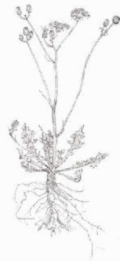
Smooth Hawks Beard. 2002