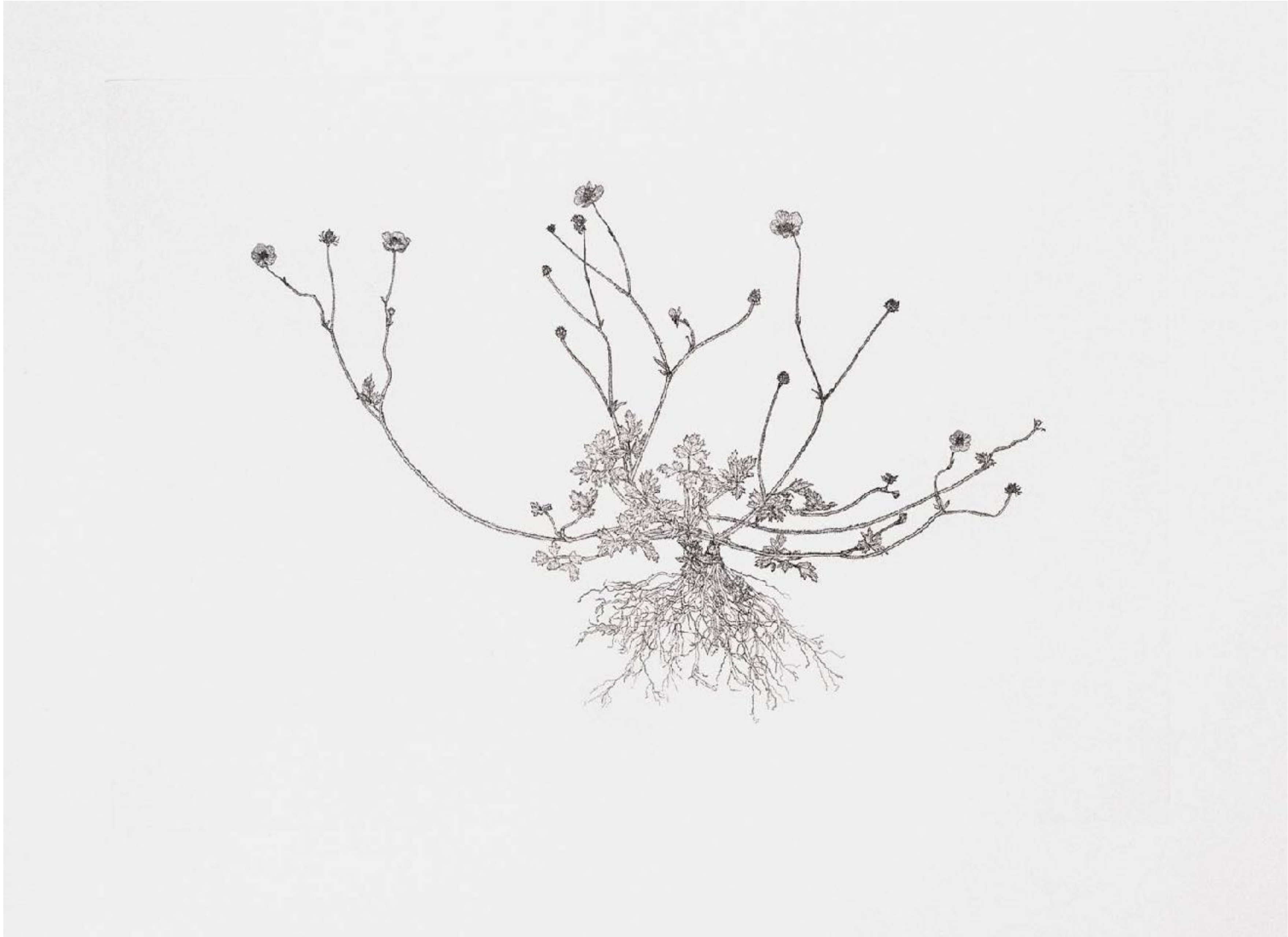
Creeping Buttercup 2002