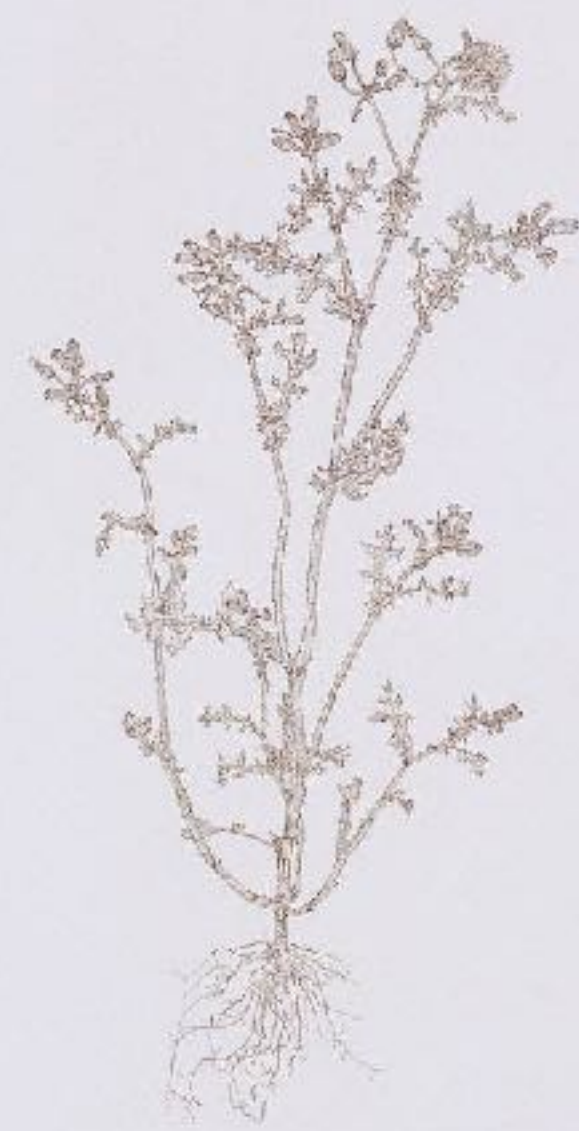
Common Groundsel 2. 2002