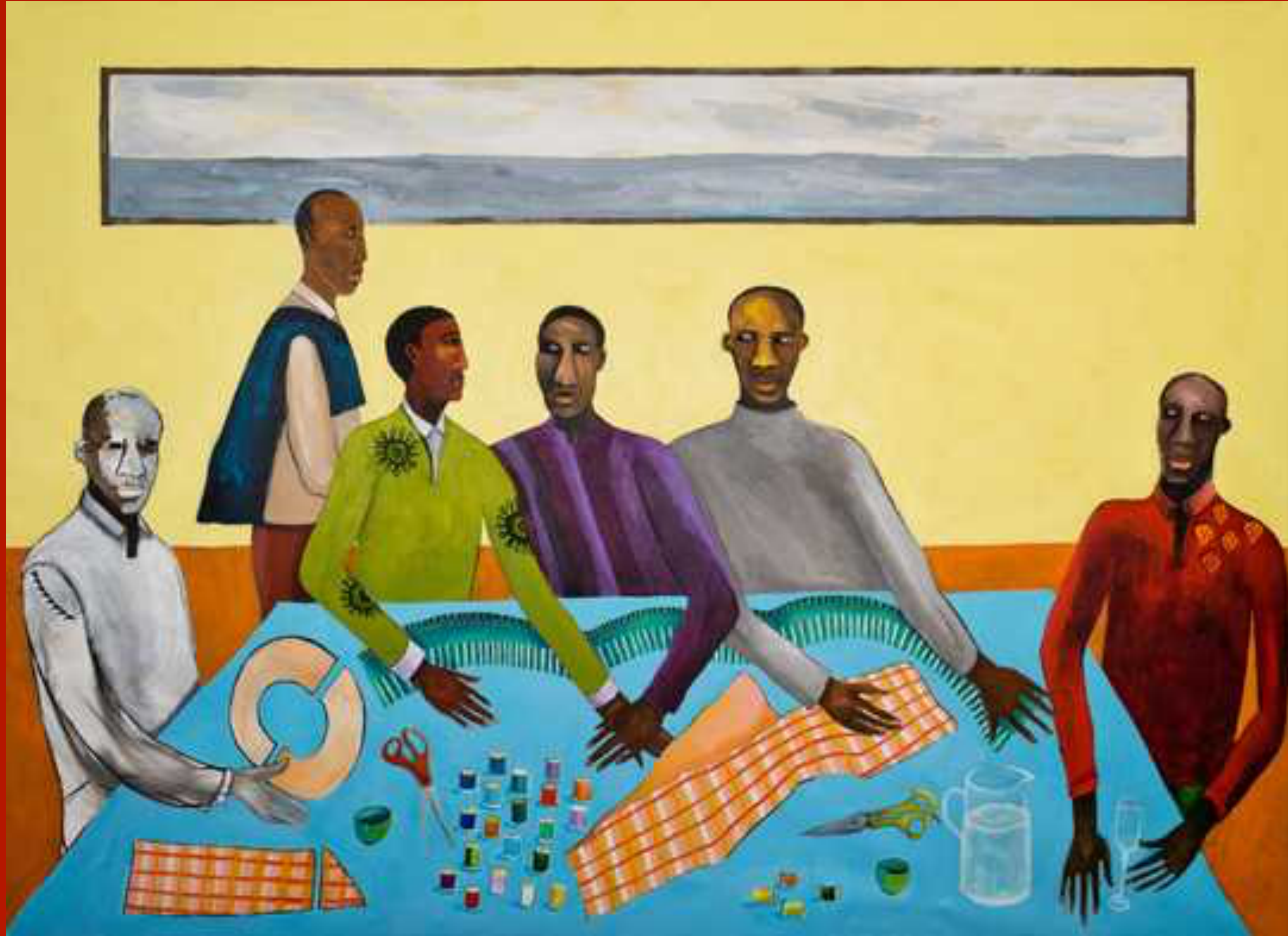
Six Tailors 2019