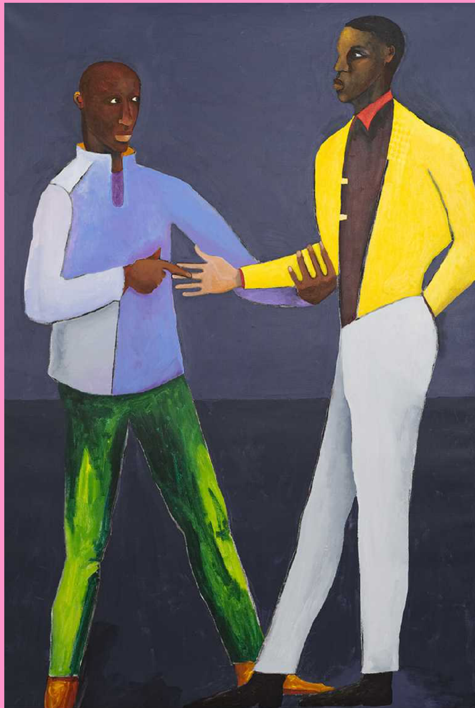
Stir Until Melted (The Fortune Teller) 2020 Acrylic paint on canvas, 183 × 122 cm