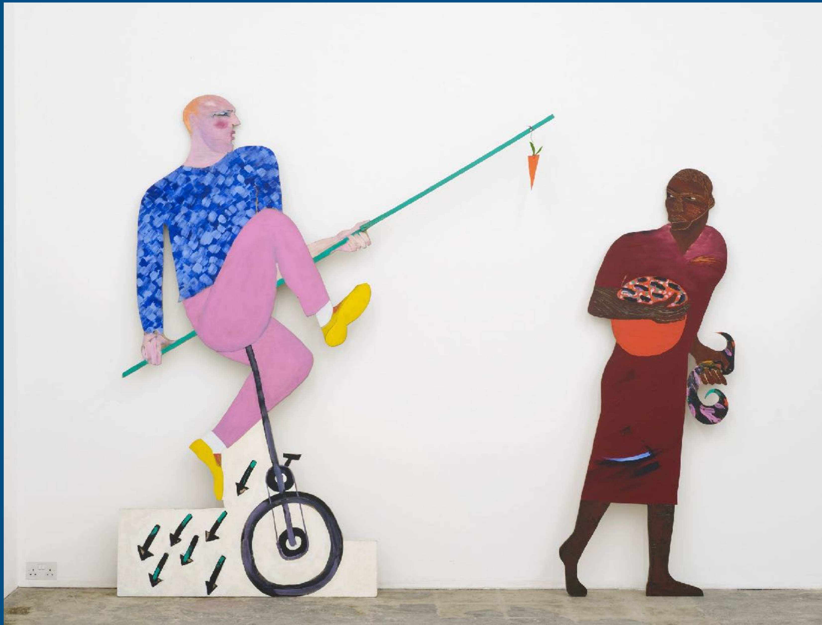
The Carrot Piece , 1985, acrylic on wood, card, string, 243 x 335 cm