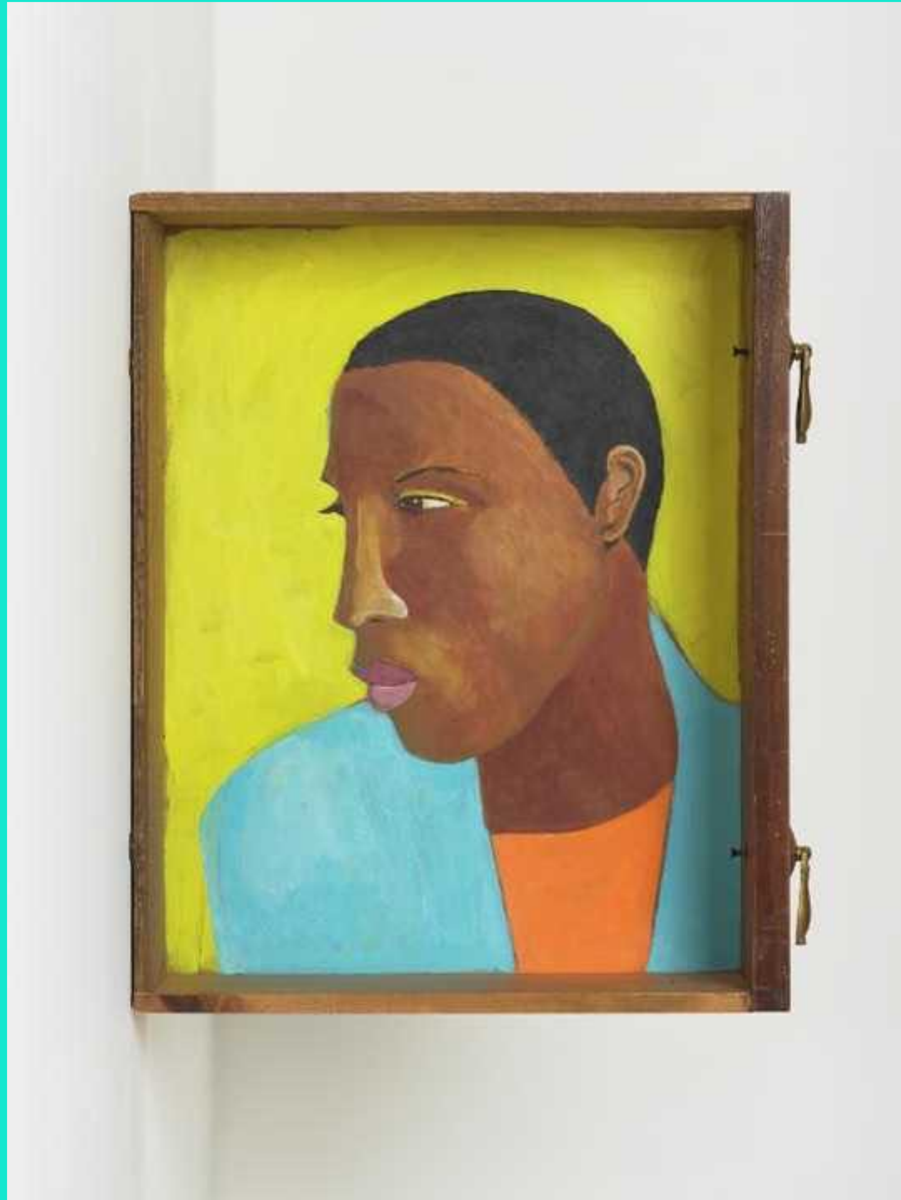
Man in a Shirt Drawer, 2017-8

Acrylic paint, wooden drawer and brass handles