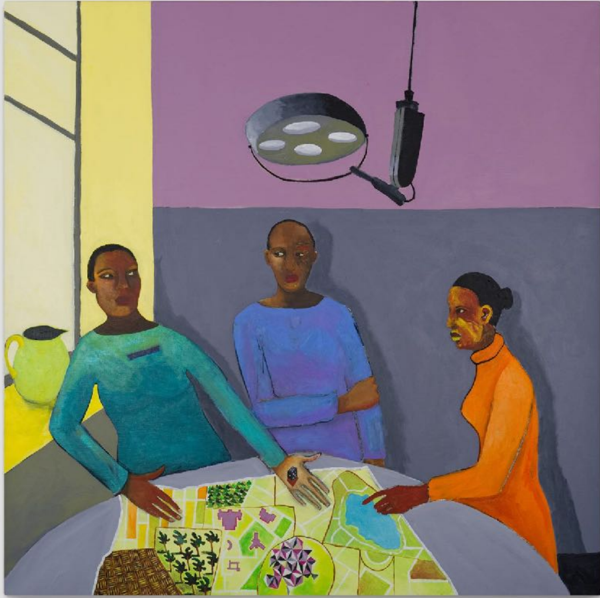
The Operating Table , 2019, acrylic on canvas, 152 x 152 cm