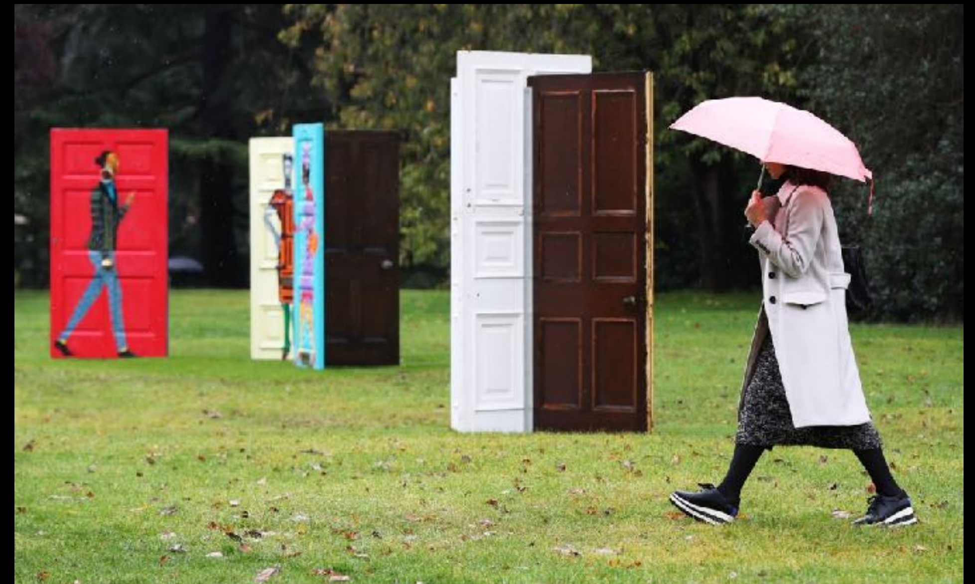
Frieze Sculpture 2020, Regent's Park - in pictures