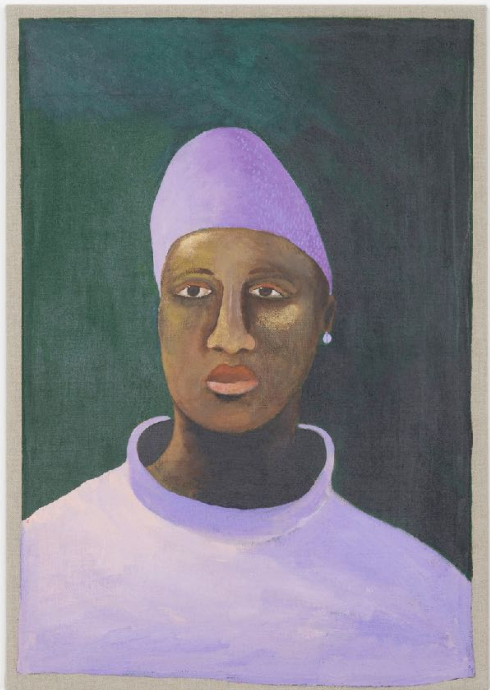
1974, 2015, acrylic on canvas, 64 x 45.3 x 2 cm