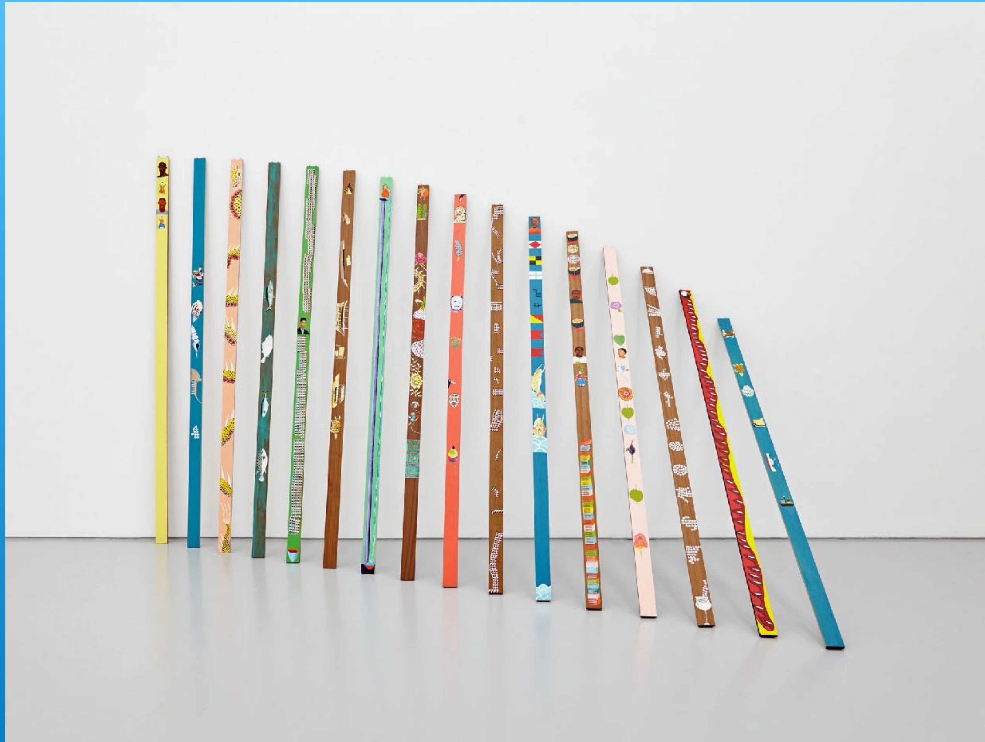
Drowned Orchard: Secret Boatyard , 2014, 16 hand-painted wooden planks