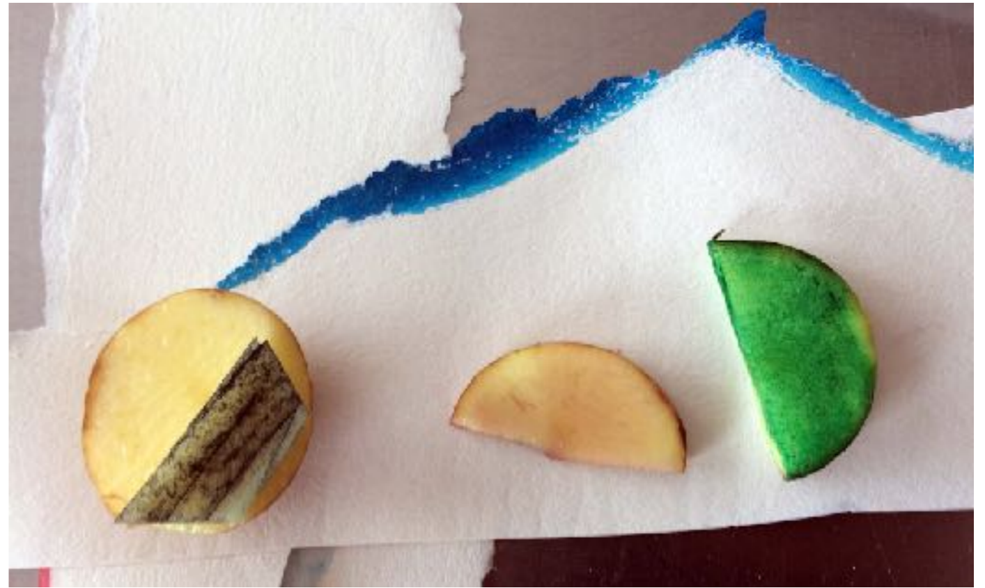
Use Potatoes like a wood Block