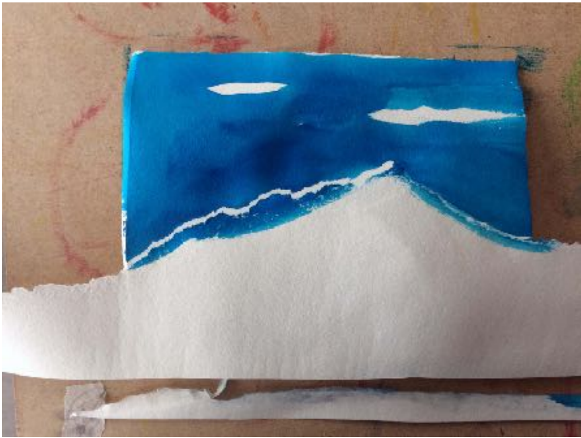
Torn Paper and Paint, Ink or dry mark Making Materials