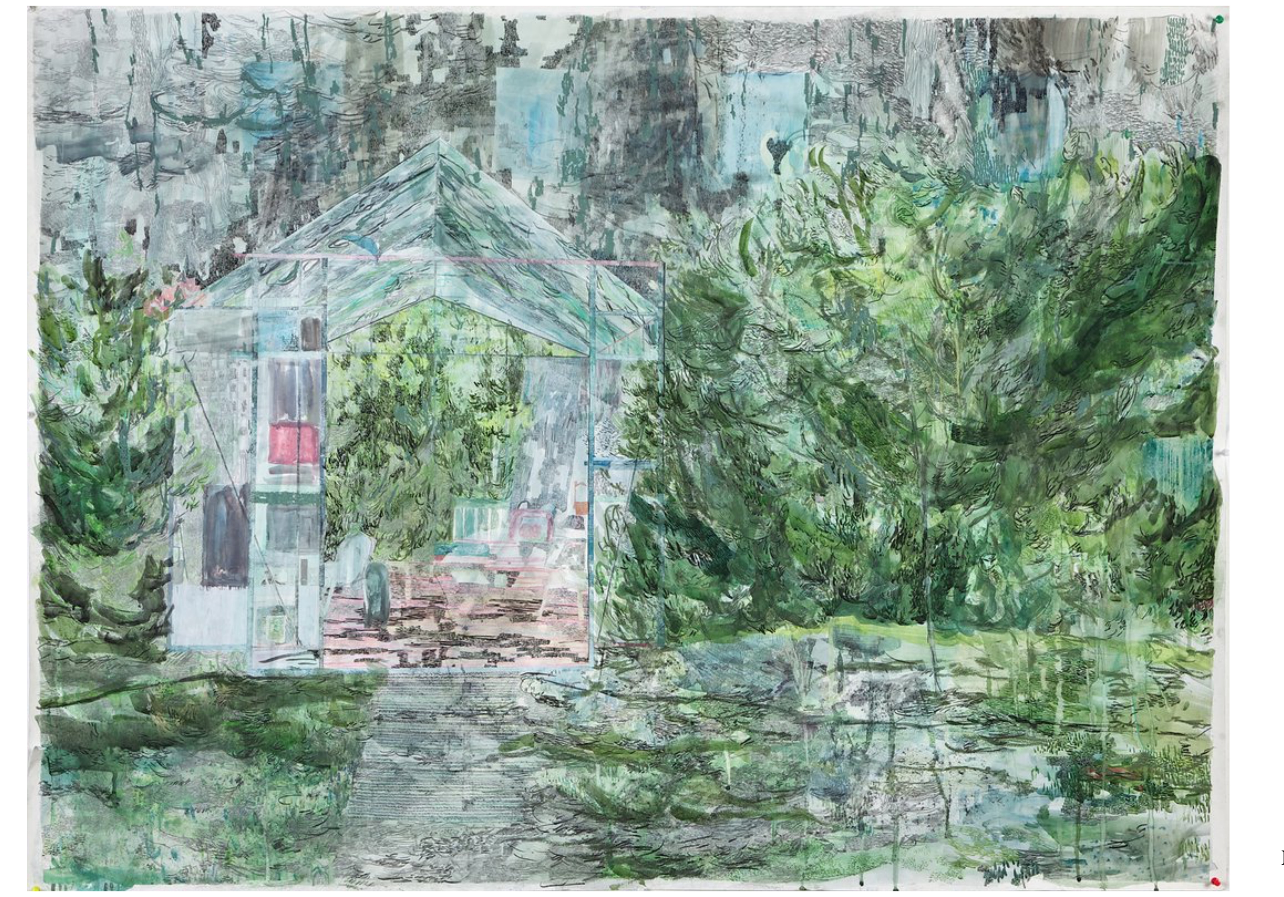
Listening to the Wind