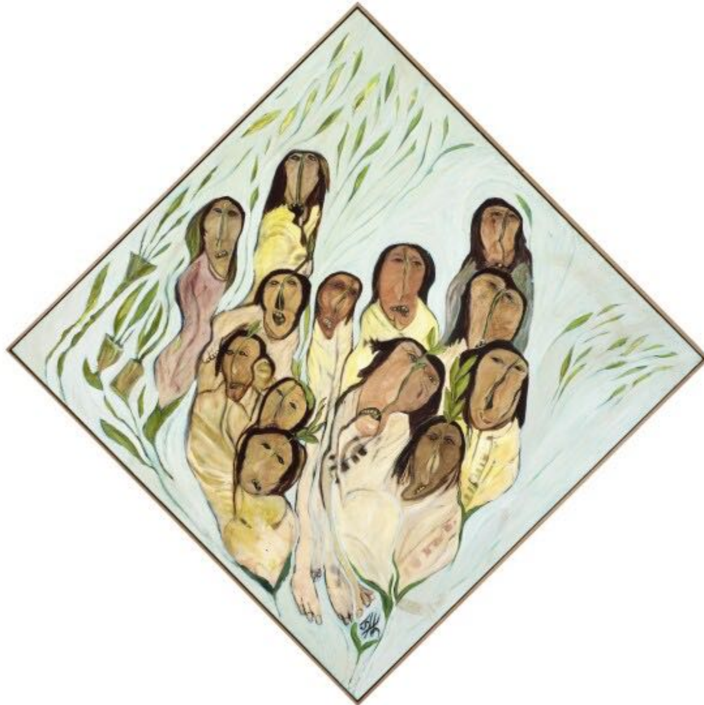
Preparation of Incense - Zār Ceremony signed and dated 2015 (lower centre) oil on canvas 139.5 by 141cm., 55 by 55½in.

The Zār Ceremony is a practice whereby the individual is exorcised of the evil spirit leaving them in a trance-like state. Ishaq's Preparation of Incense depicts thirteen women in a collective space, stacked on top of one another, showing their unity and perseverance in their ordeal. ( sothebys.com )