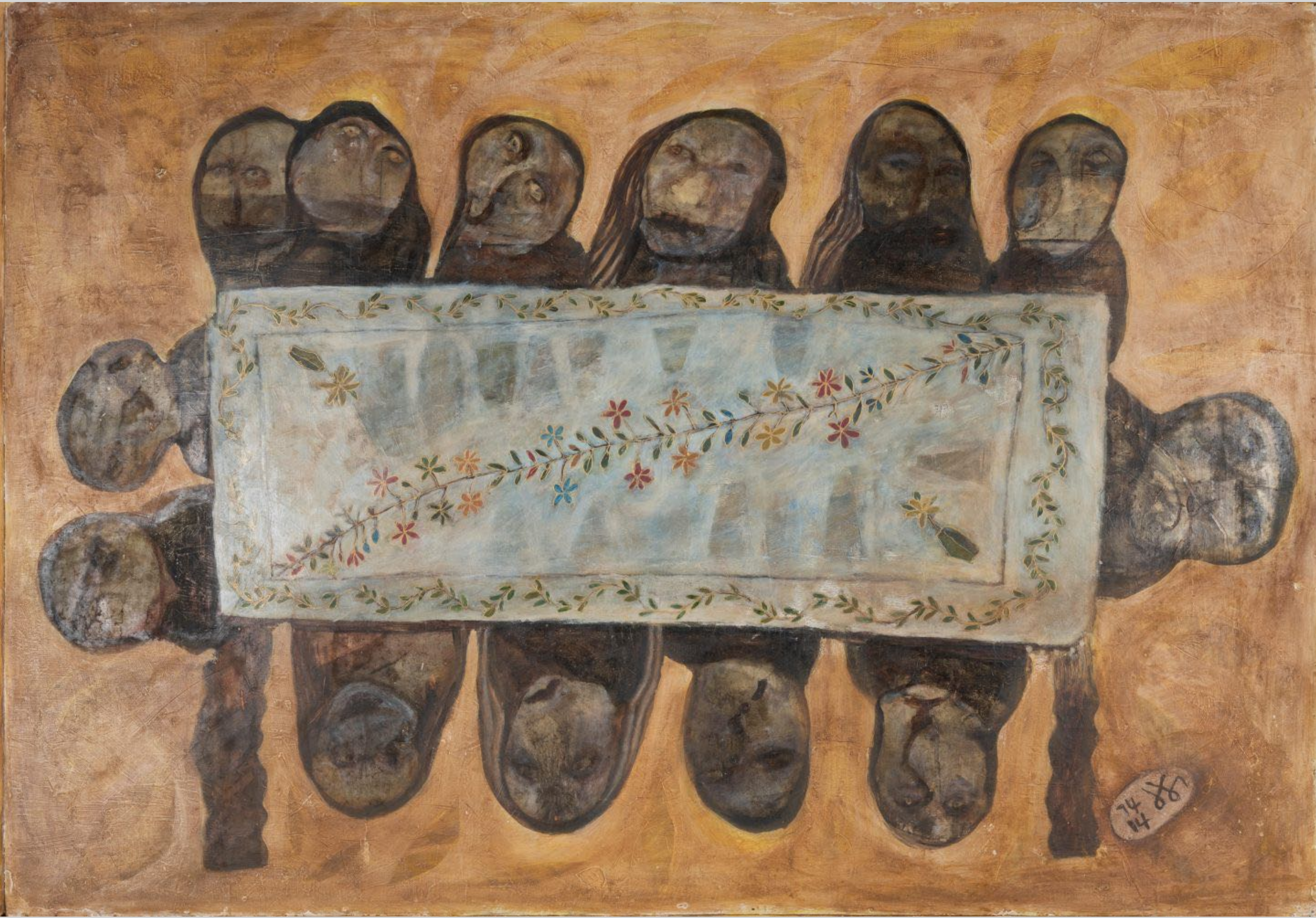
Dinner Table with Embroidered Cloth, 1974.