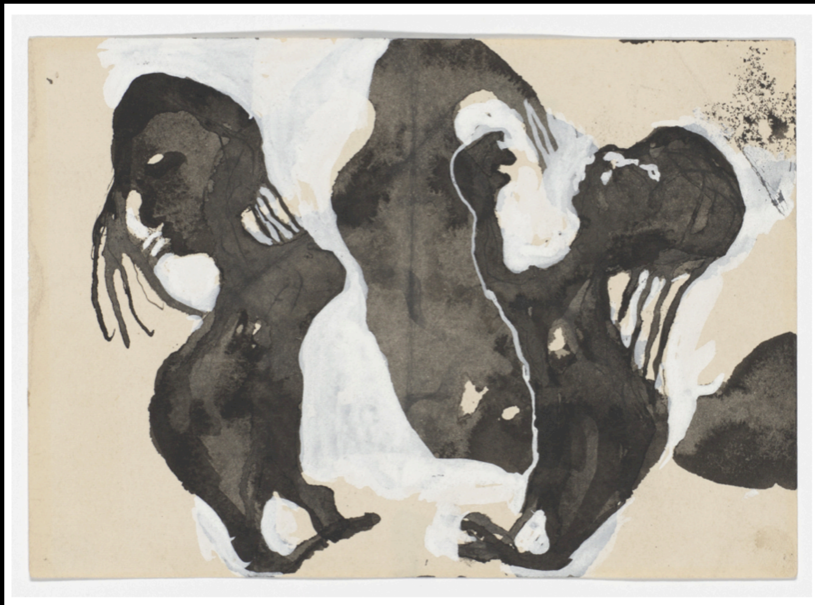
Figures and Spirits 2, 1970