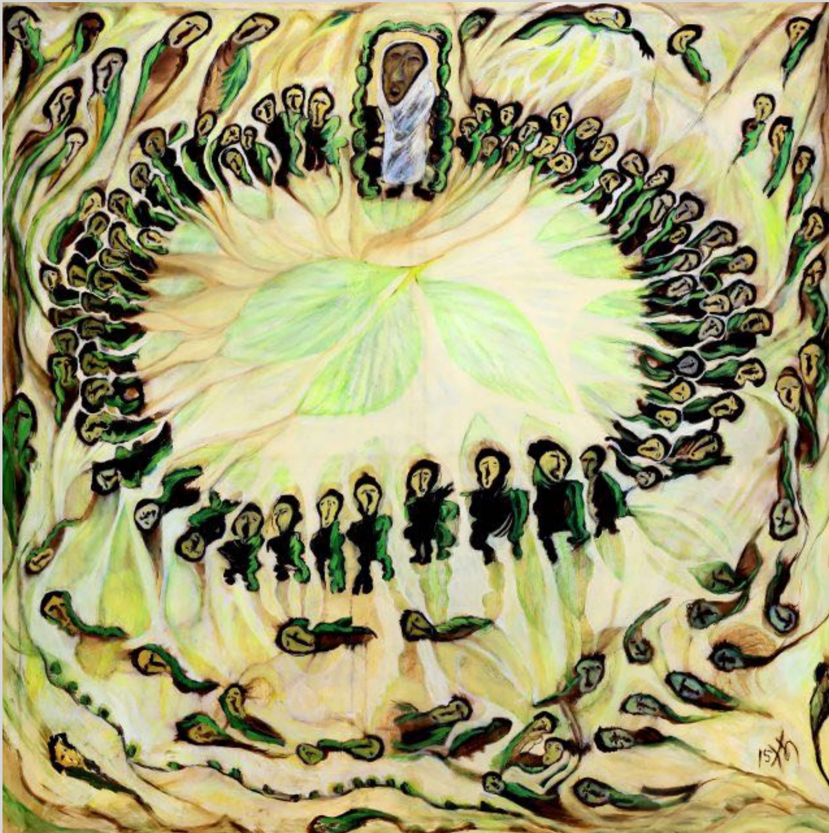
Procession (Zaar), 2015. Courtesy the artist. Photo: Mohamed Noureldin Abdallah Ahmed. © Kamala Ibrahim Ishag.