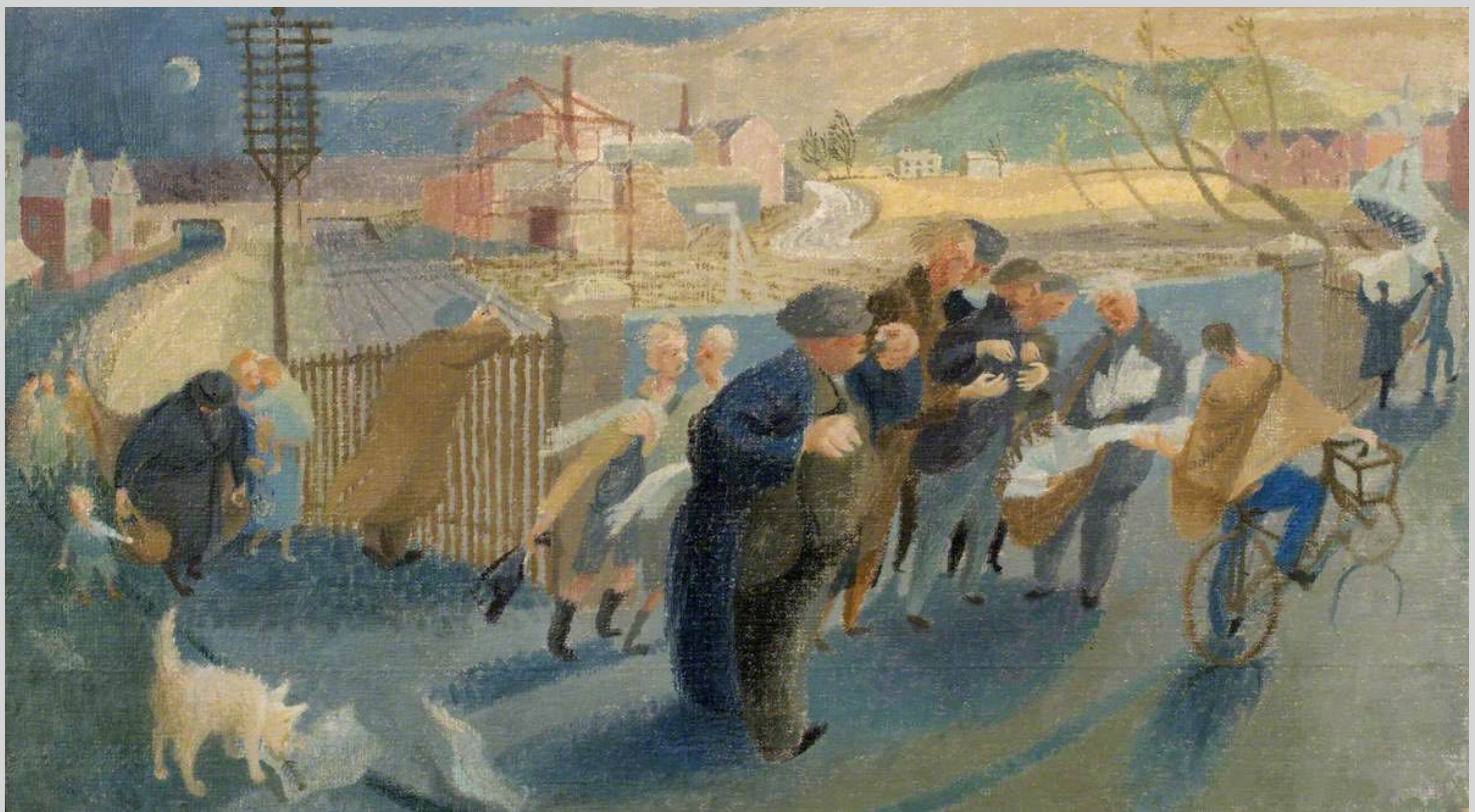
Spring Evening, 1950, Oil on canvas, H 50.5 x W 88.5 cm