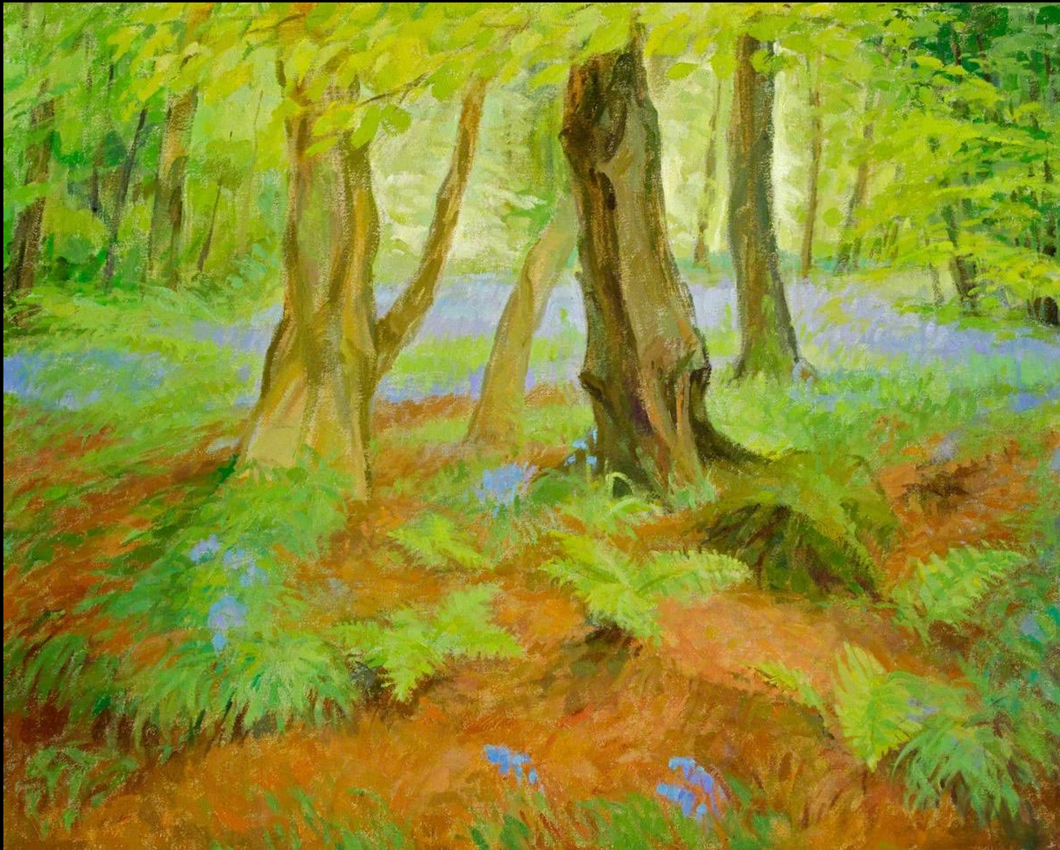
Wenallt Woods , 1994 Oil on canvas H 61 x W 76.5 cm