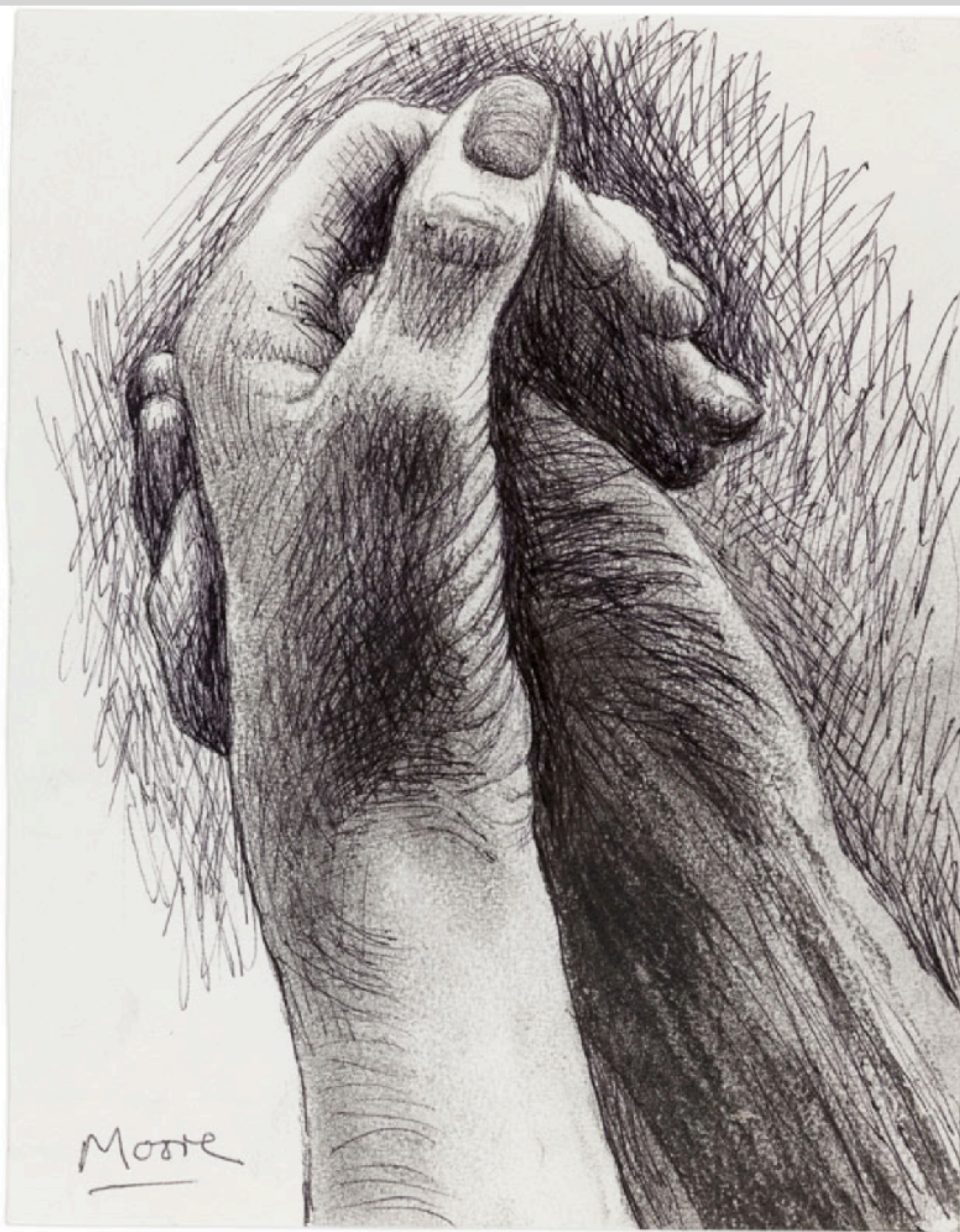
Henry Moore, The Artist's Hands IV, 1982. Drawing. Reproduced by permission of The Henry Moore Foundation.