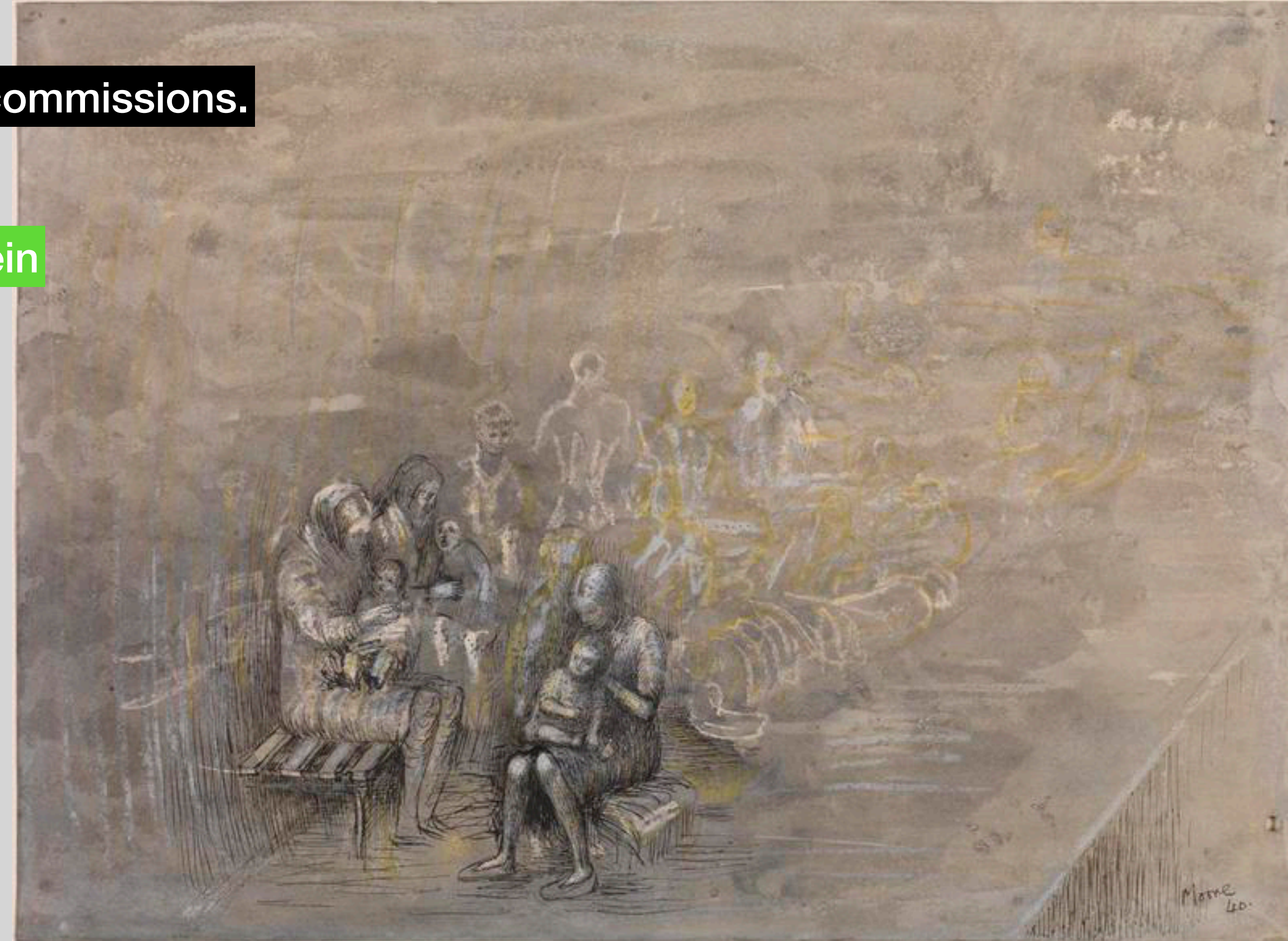
Women and Children on the Tube, 1940