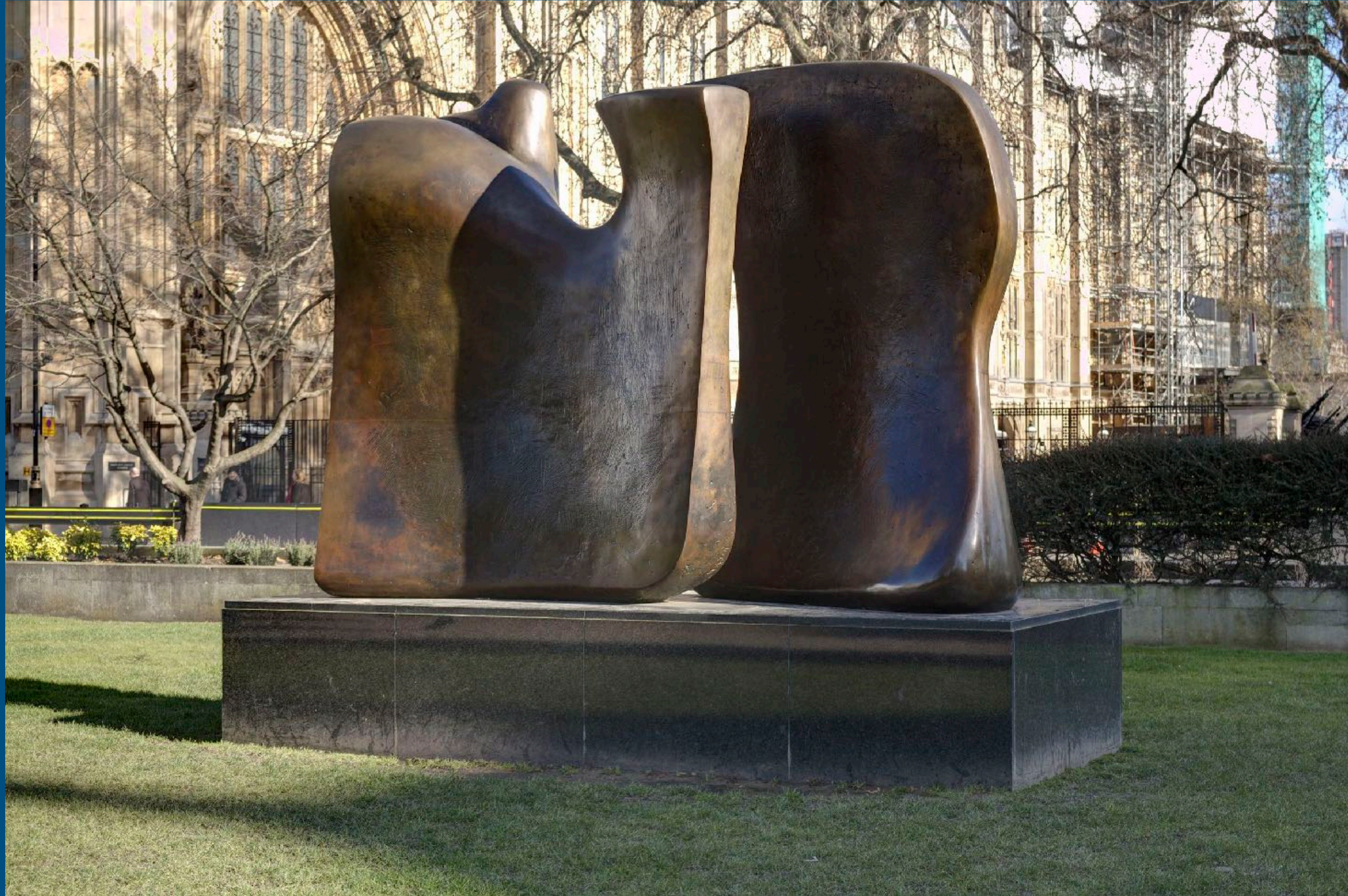
Knife Edge Two Piece (1962–65) ( bronze ), (1962), opposite House of Lords , London