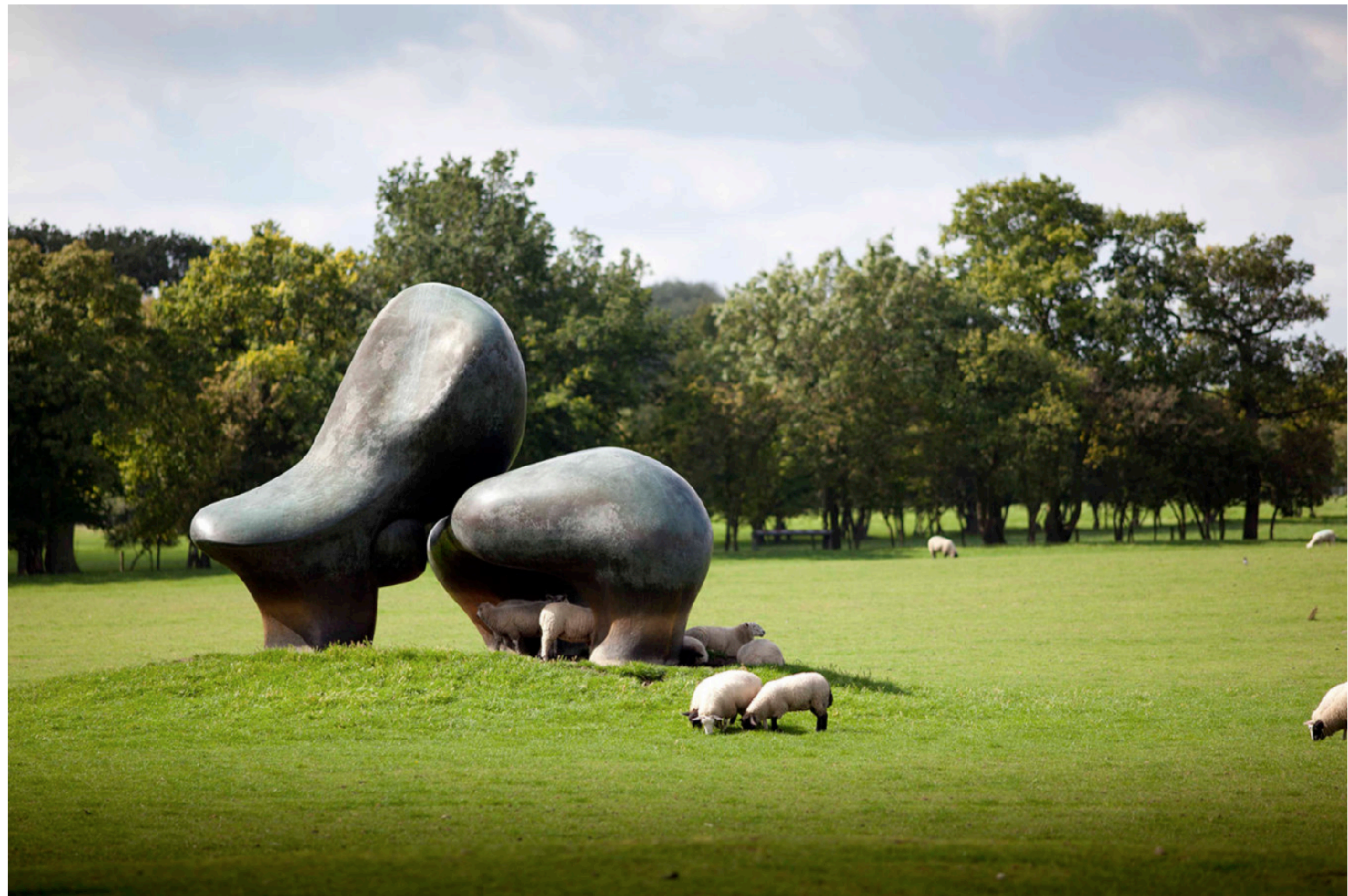
Henry Moore, Sheep Piece, 1971-72, Henry Moore Foundation, Hertfordshire, UK.