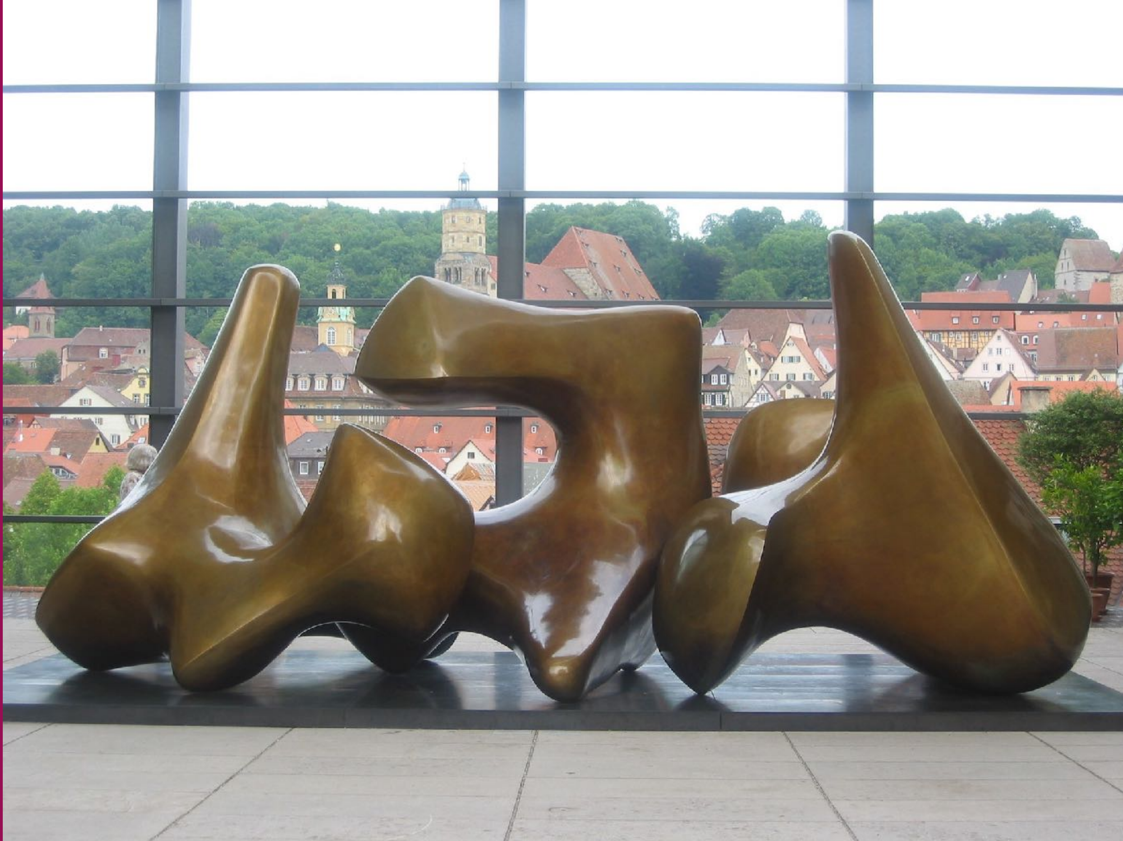
Three Piece Sculpture: Vertebrae (1968–69), Henry Moore, Kunsthalle Würth, 74523 Schwäbisch Hall 2005