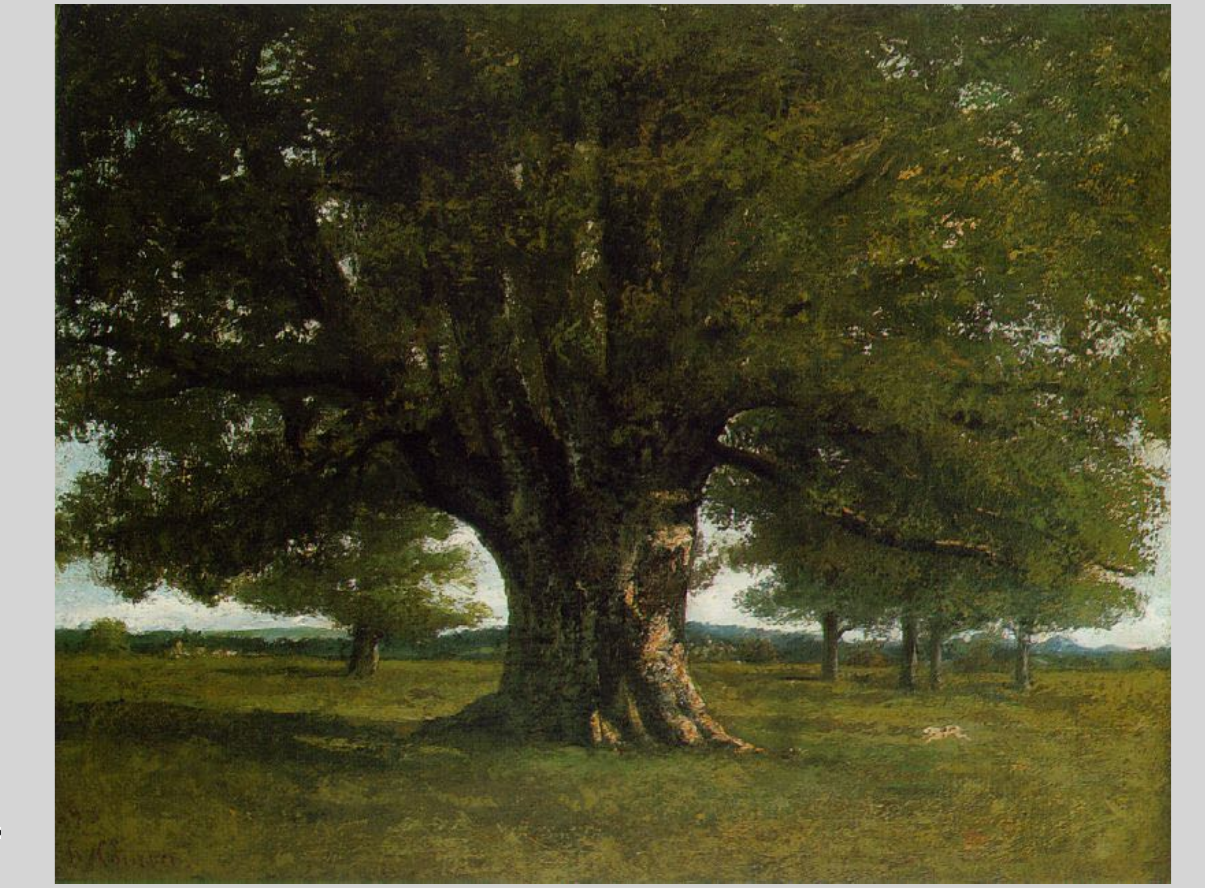
French: Le chêne de Flagey (Le Chêne de Vercingétorix) The Oak at Flagey (The Oak of Vercingetorix), 1864, Oil on Canvas 89cm x 110cm