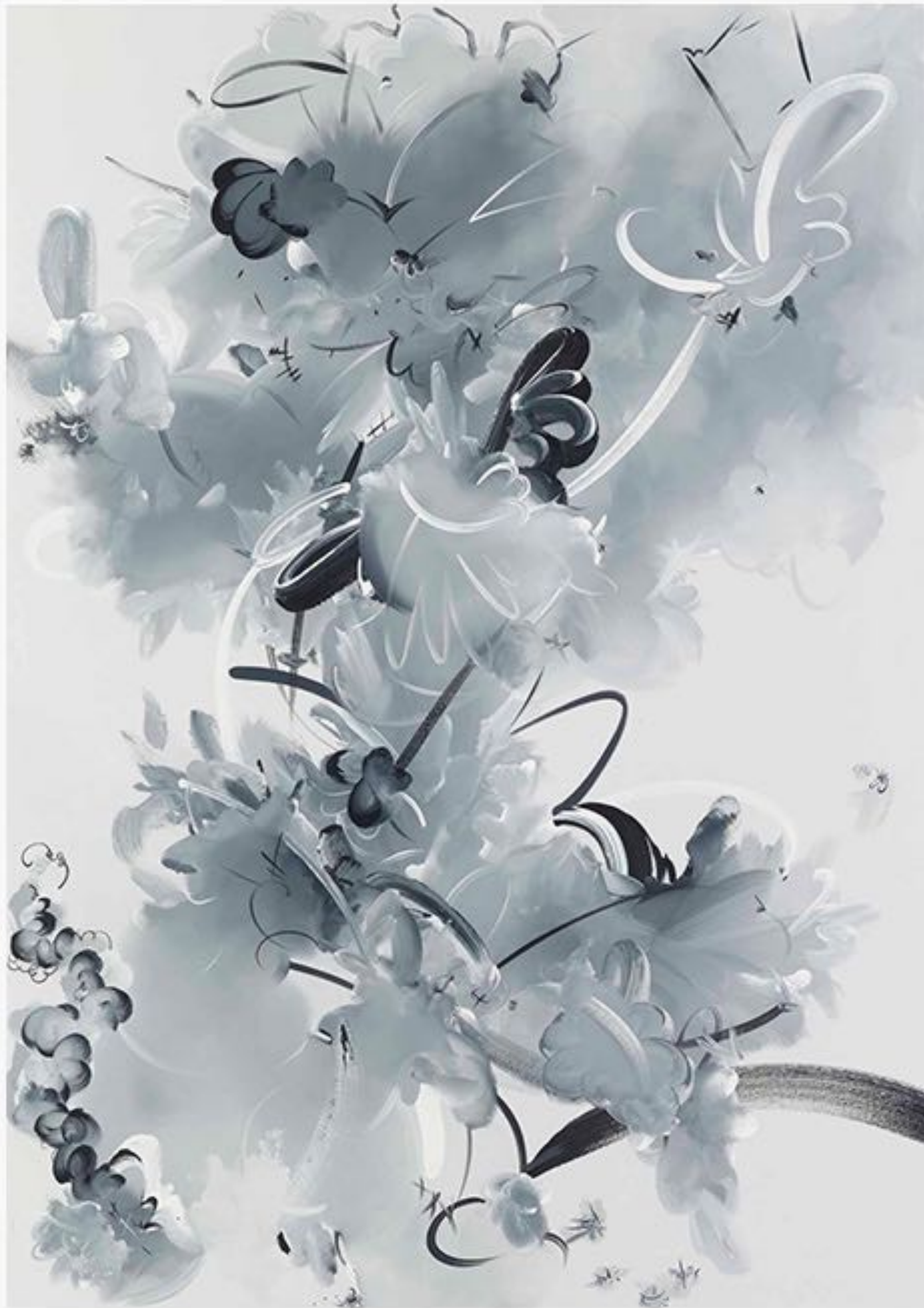
Figure 1i, 2014