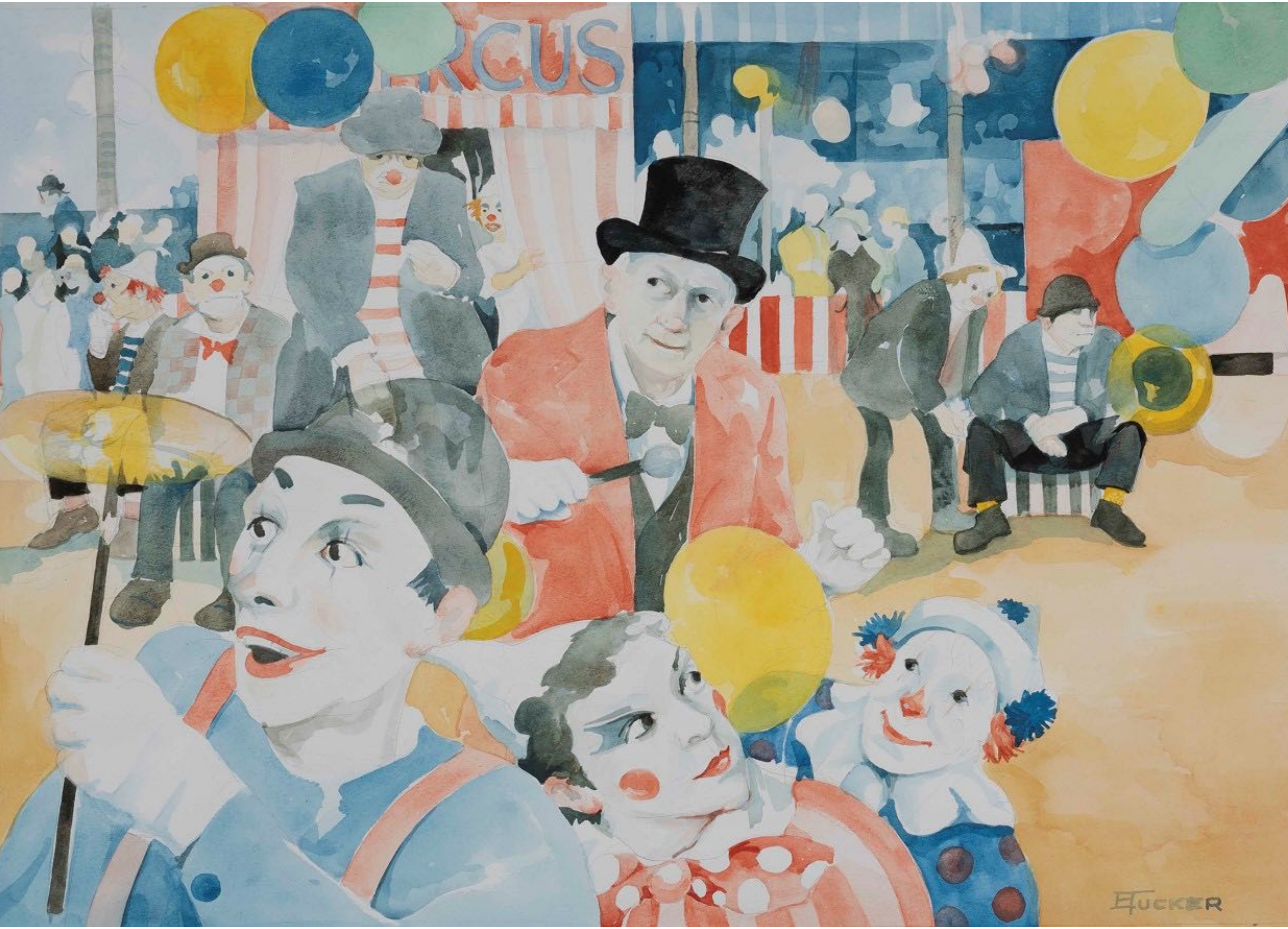
Circus Scene with Plate Spinner and Ringmaster