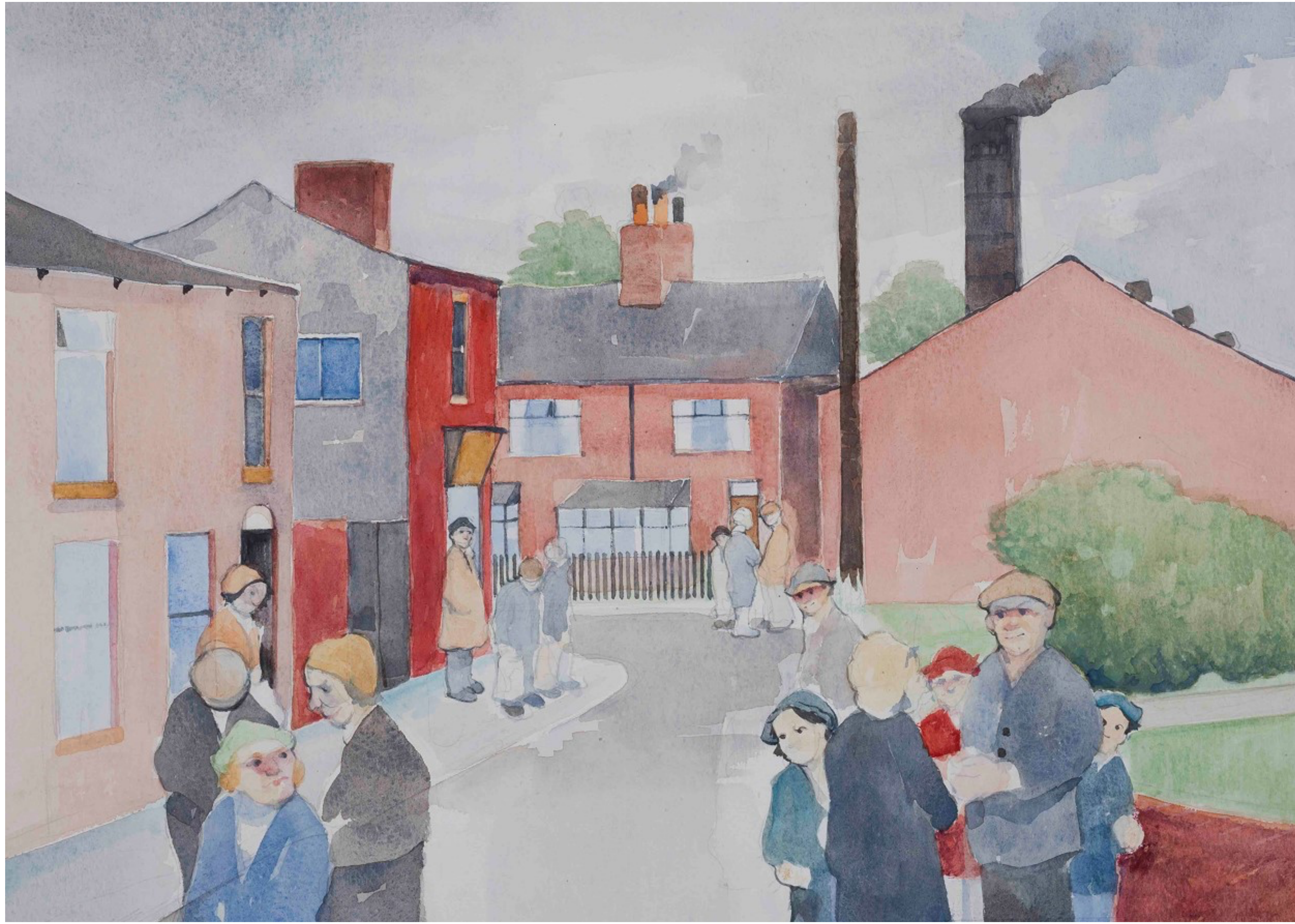
House No. 9