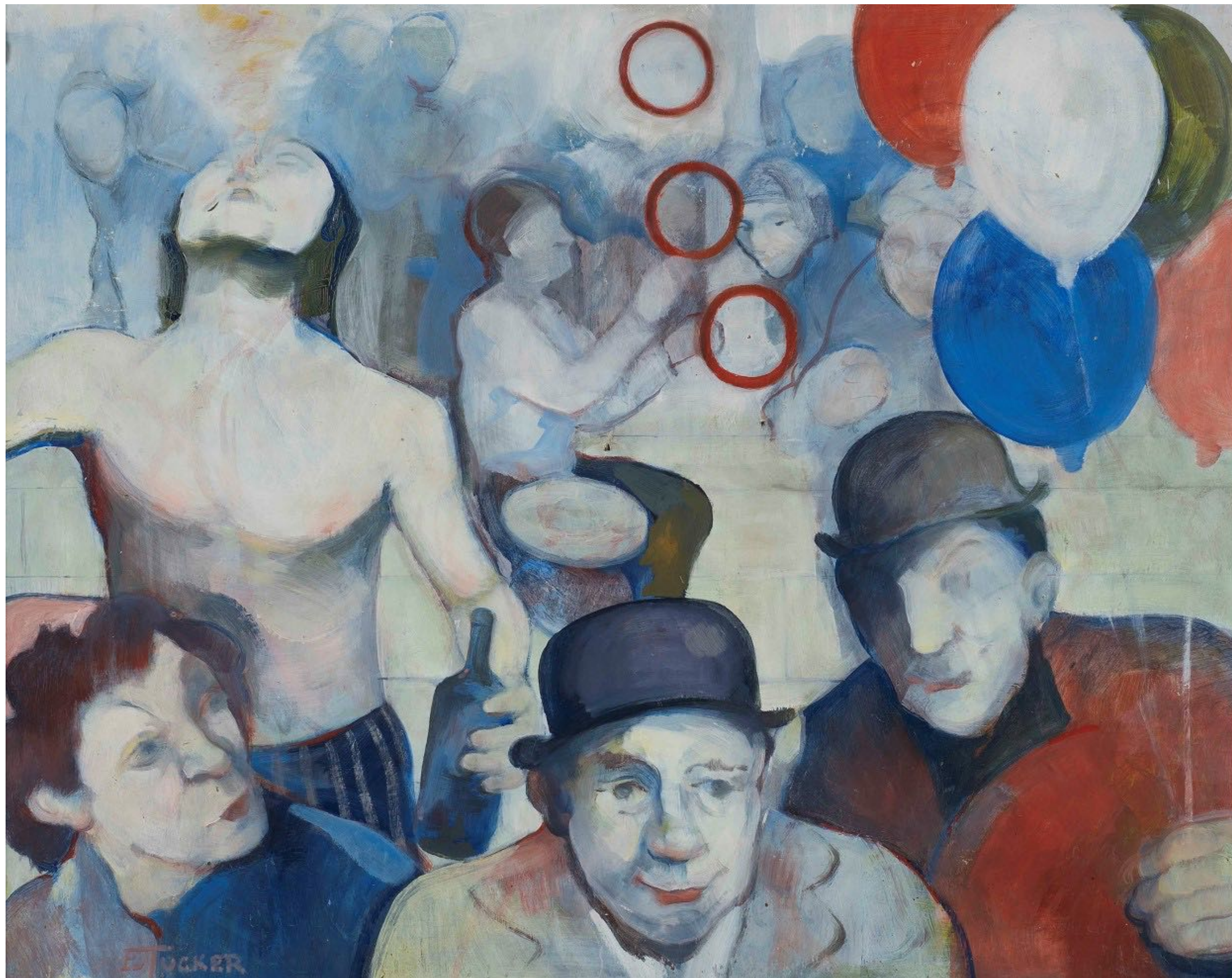
Three Clowns, Three Hoops and a Firebreather