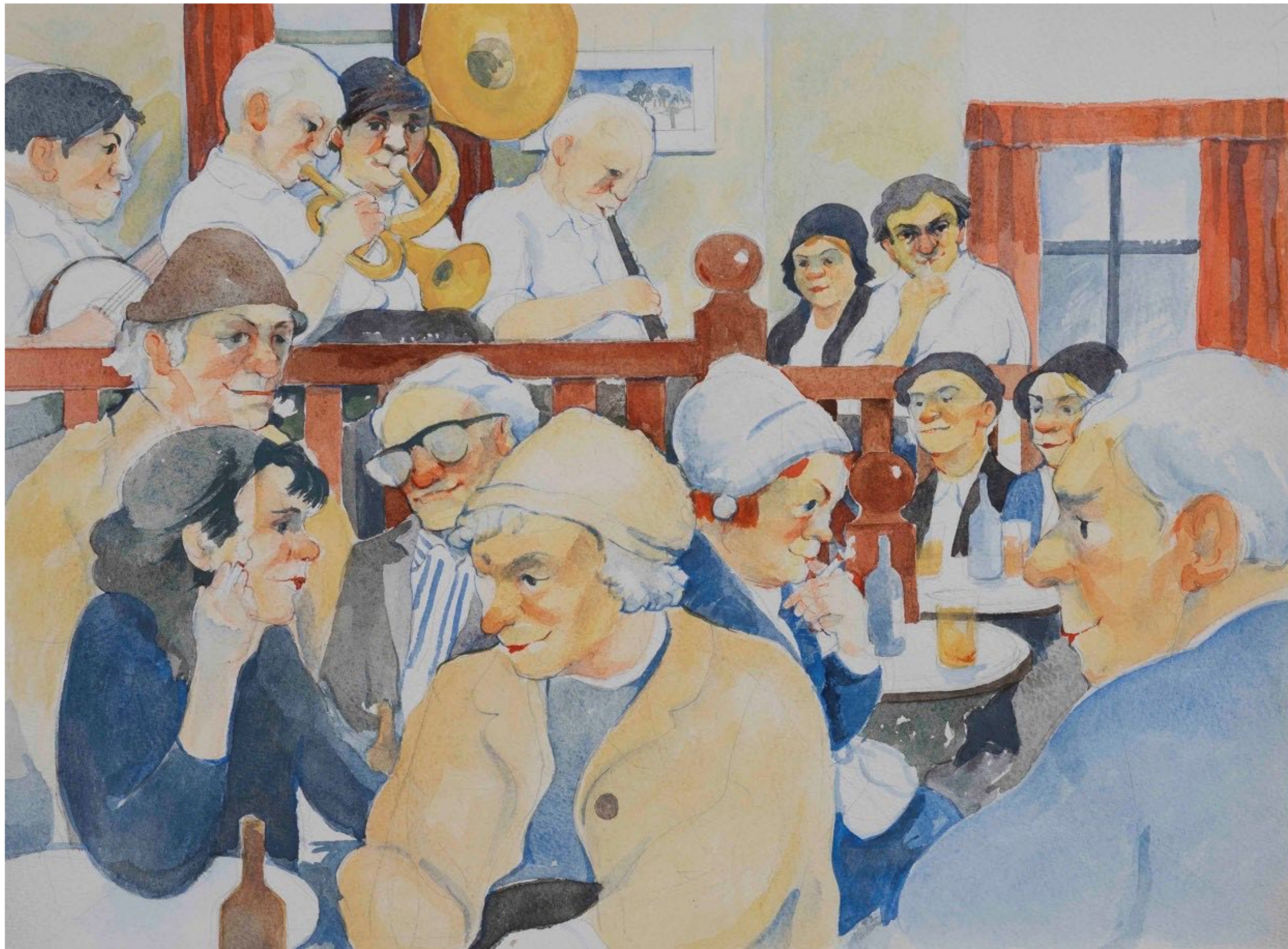
The Concert Room watercolour on paper 28.5 x 38 cm