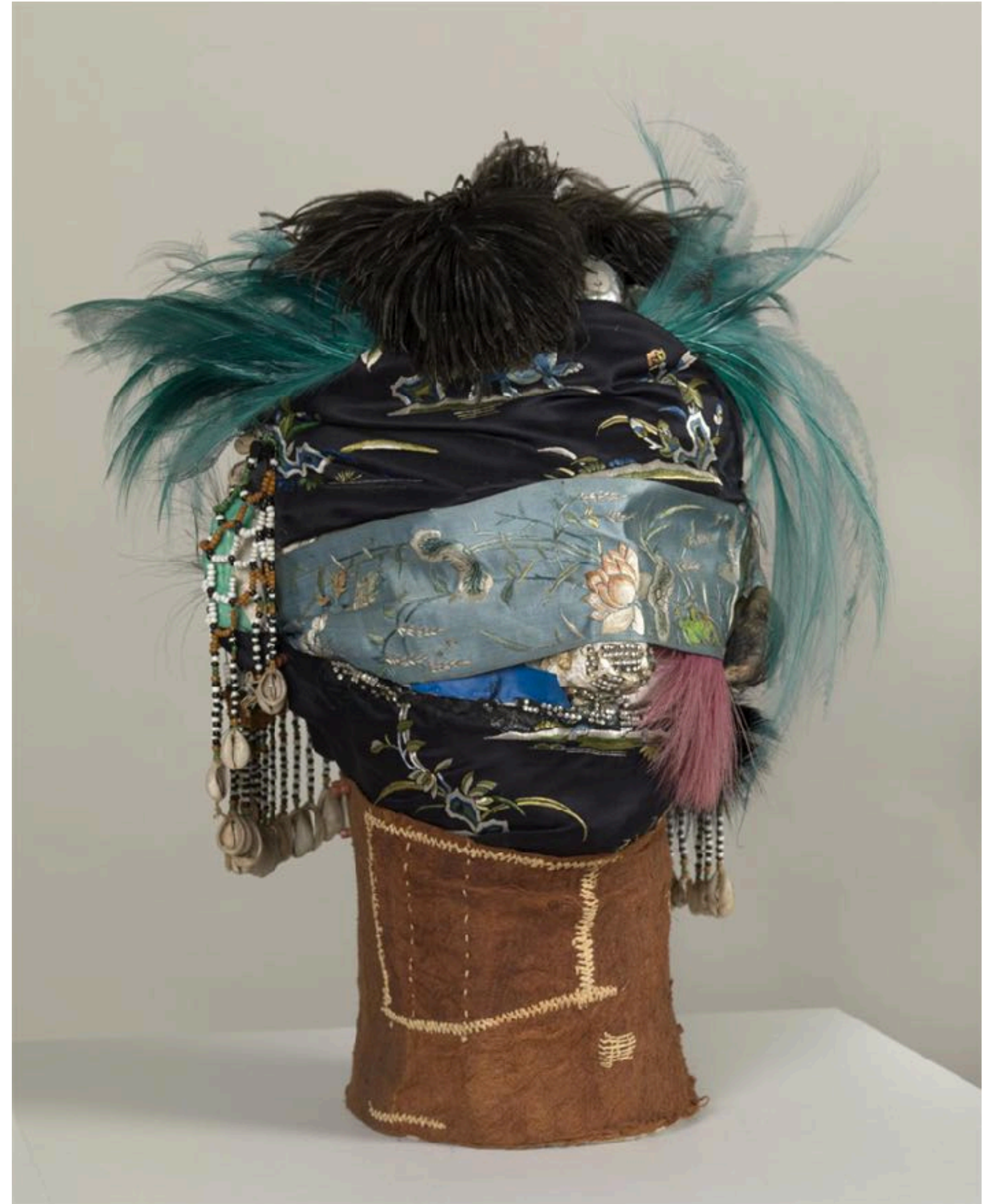
Angel of Anarchy / Eileen Agar / 1936-40