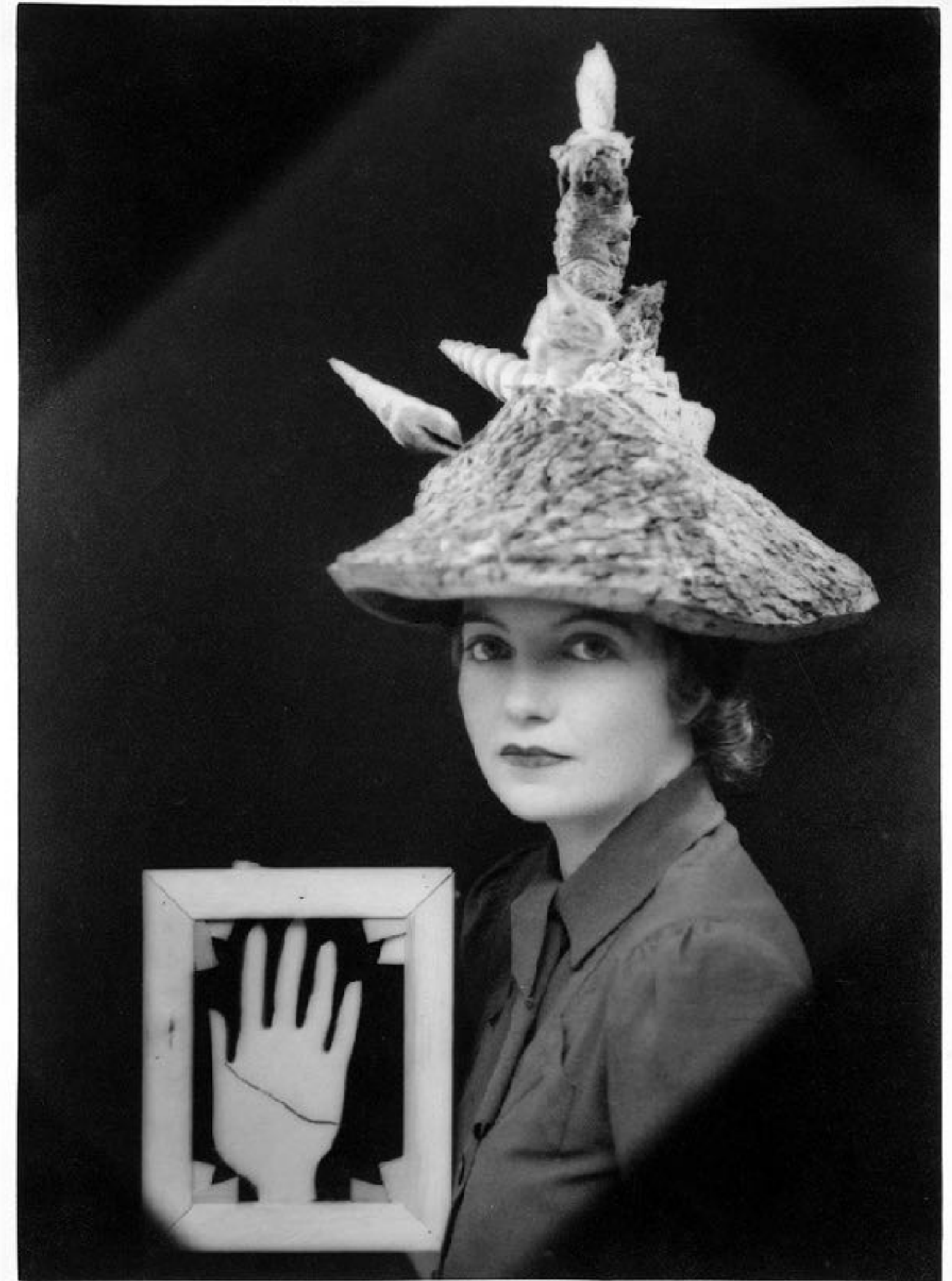
Ceremonial Hat for Eating Bouillabaisse / Photograph by Eileen Agar / 1936

https://www.whitechapelgallery.org/exhibitions/eileen-agar/