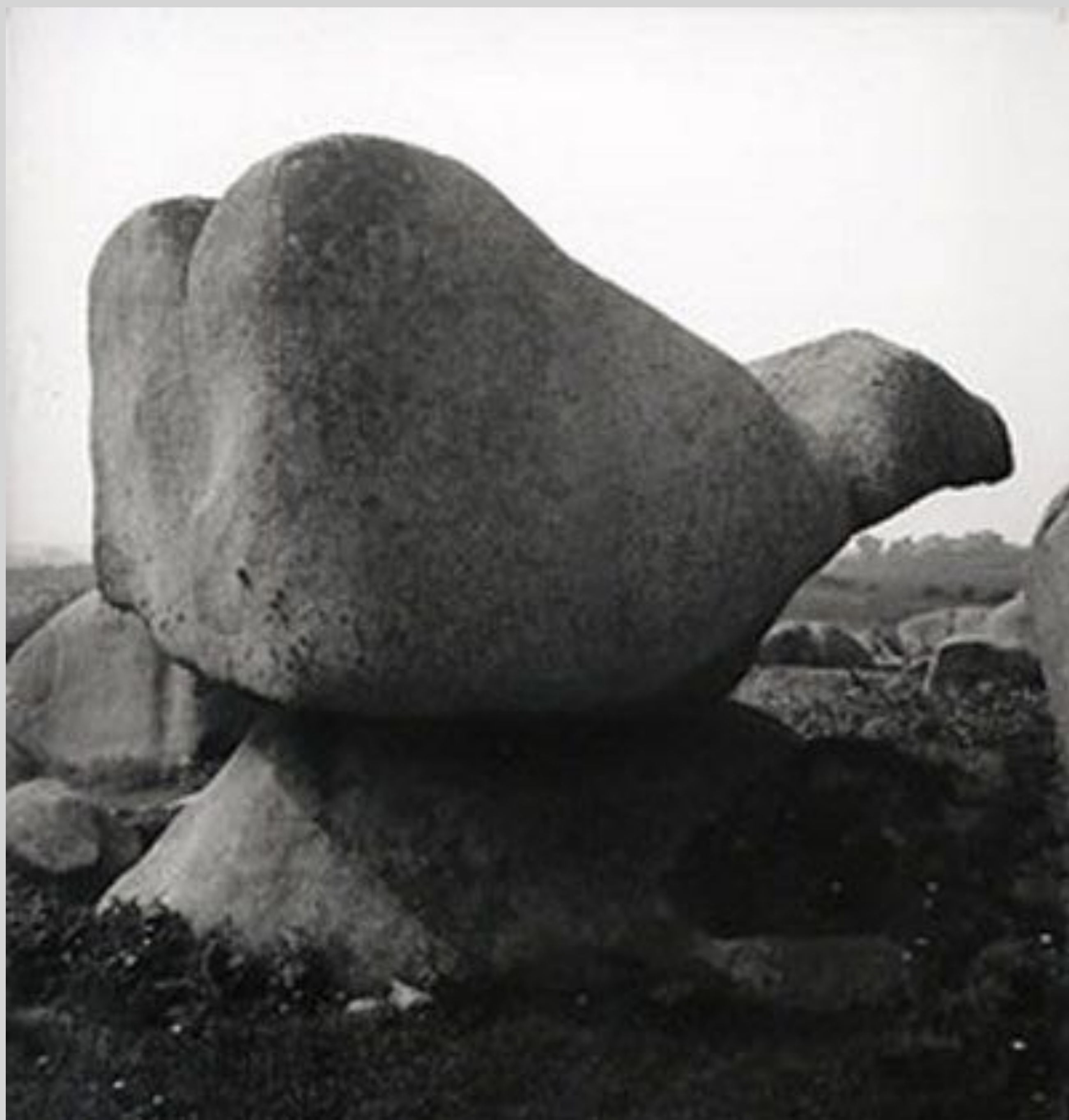
Bum and Thumb Rock, Ploumanach 1936