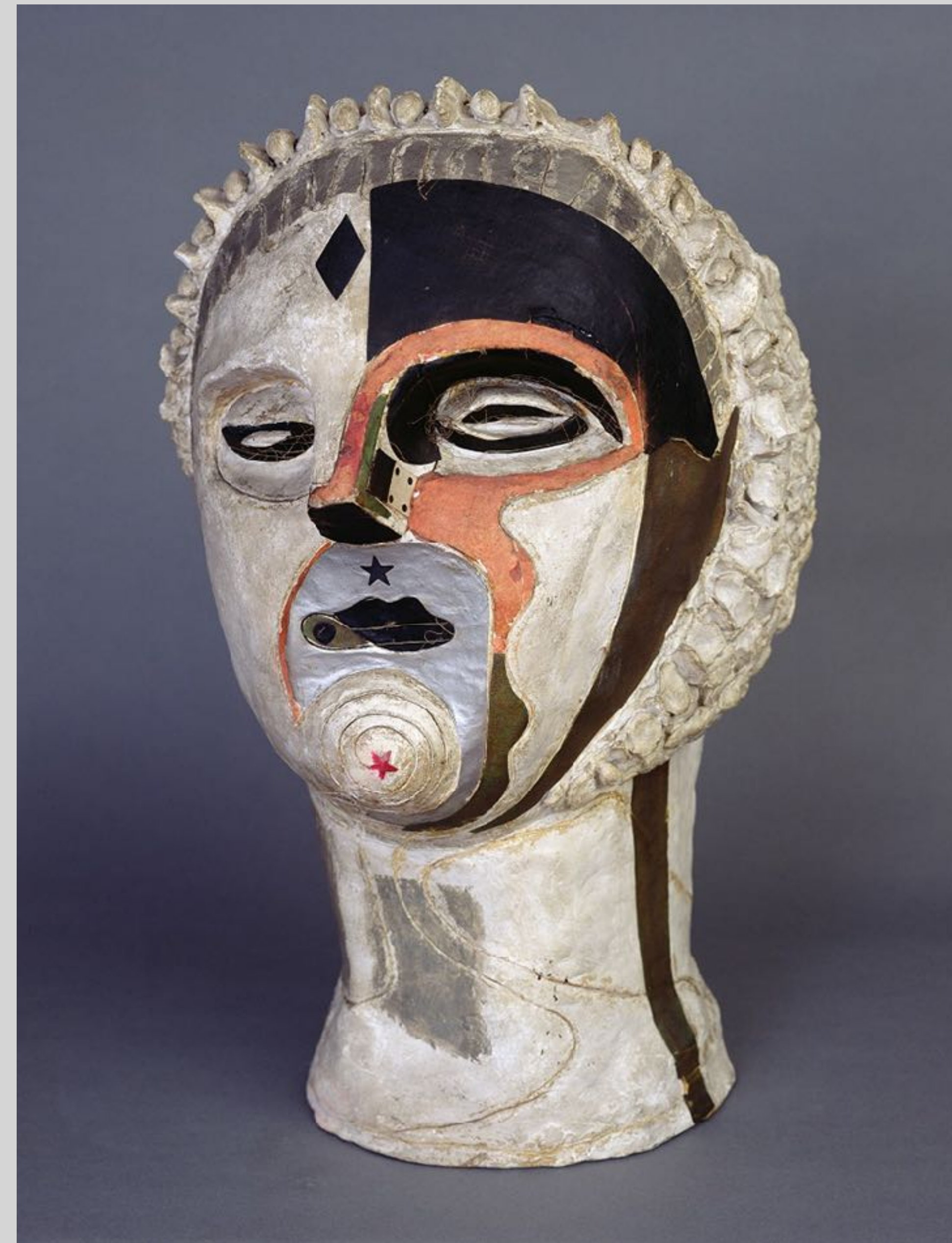
Angel of Mercy / Eileen Agar / 1934 / Plaster with collage

https://blog.fabrics-store.com/2019/08/13/eileen-agar-monsters-and-angels/