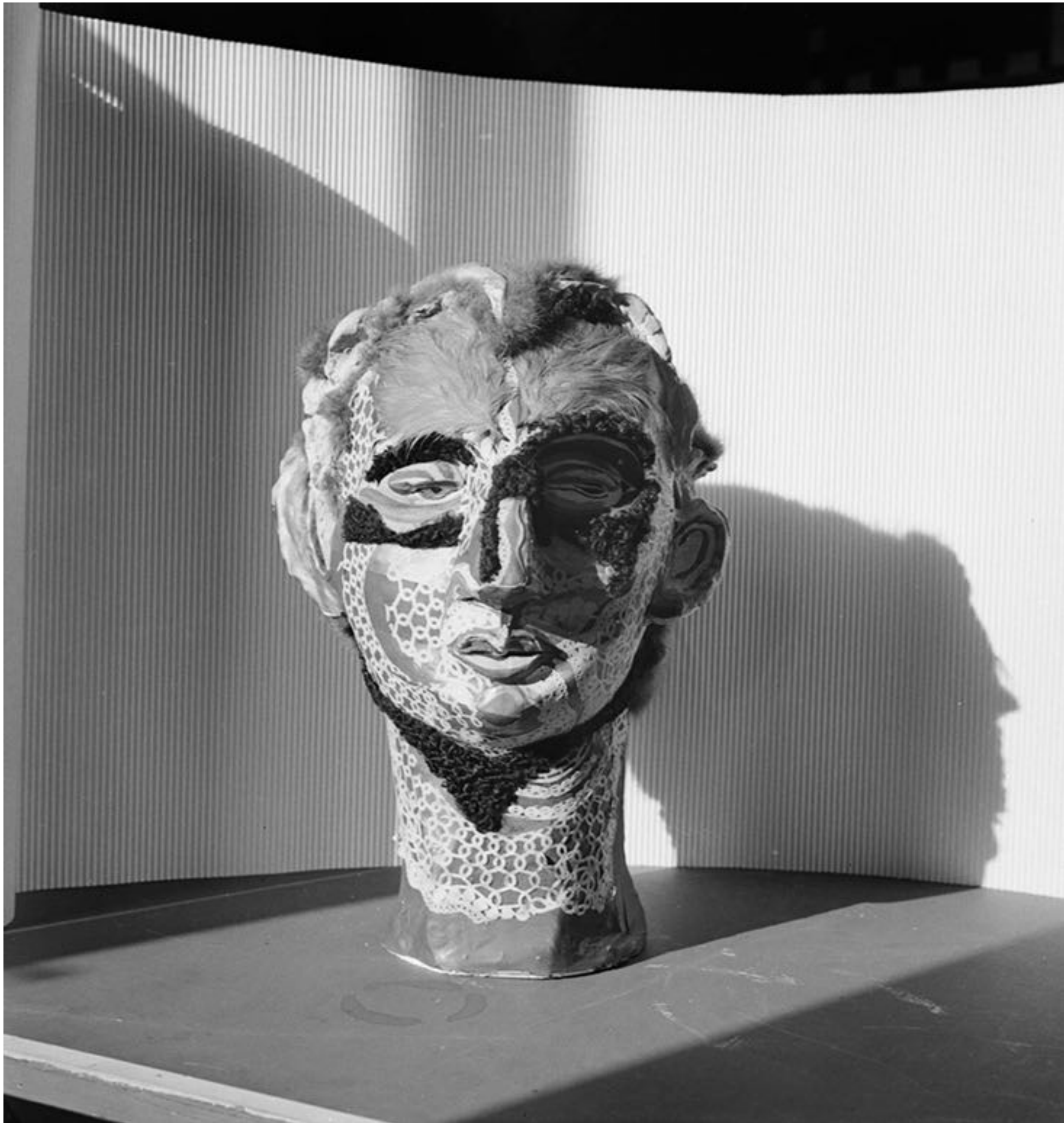
Photograph of 'Angel of anarchy' (1st version) / Eileen Agar / 1936-7