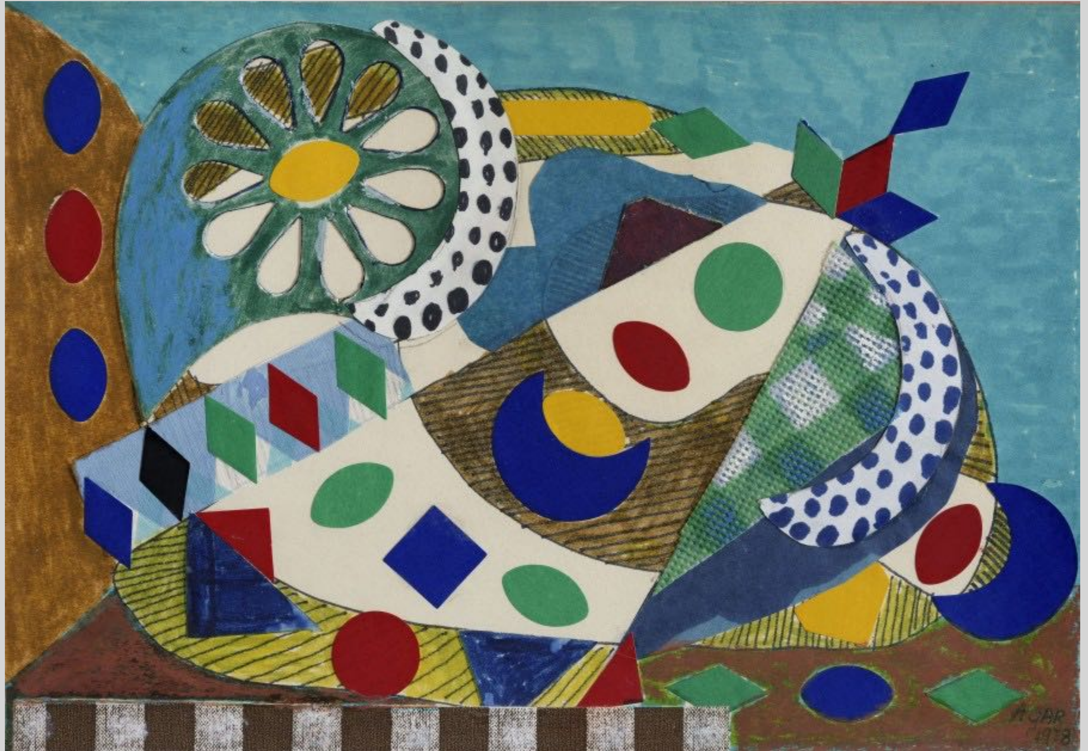
Flower Palette, 1978