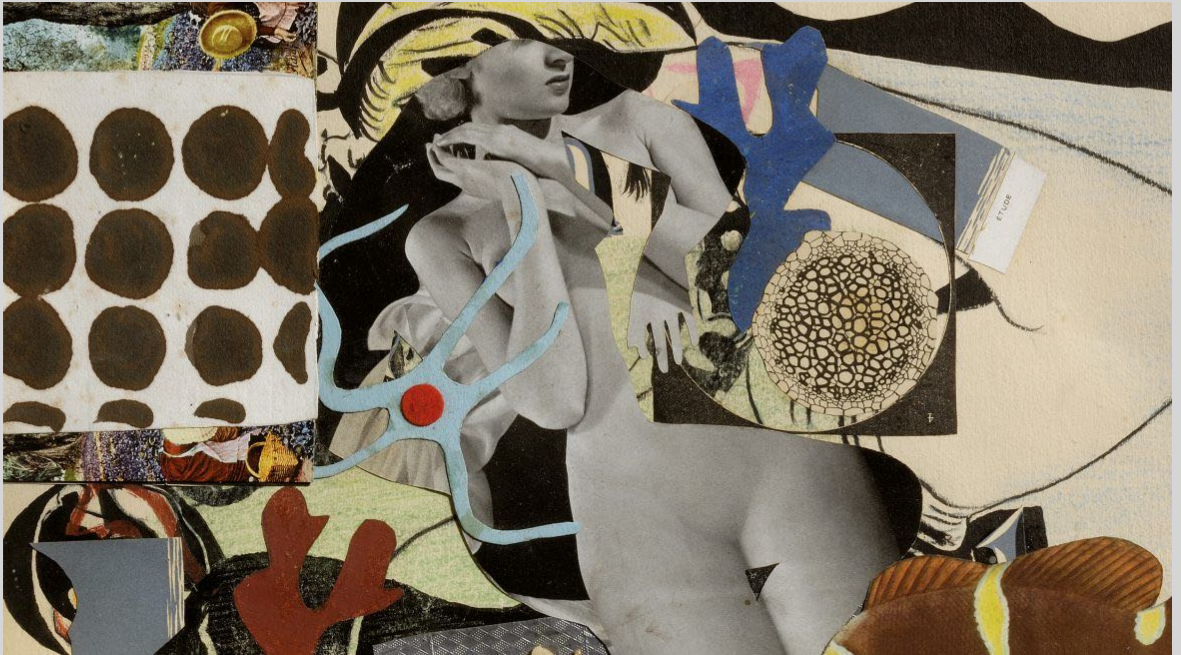
Erotic Landscape, 1942, collage on paper, 255 x 305 mm, private collection. © The Estate of Eileen Agar.