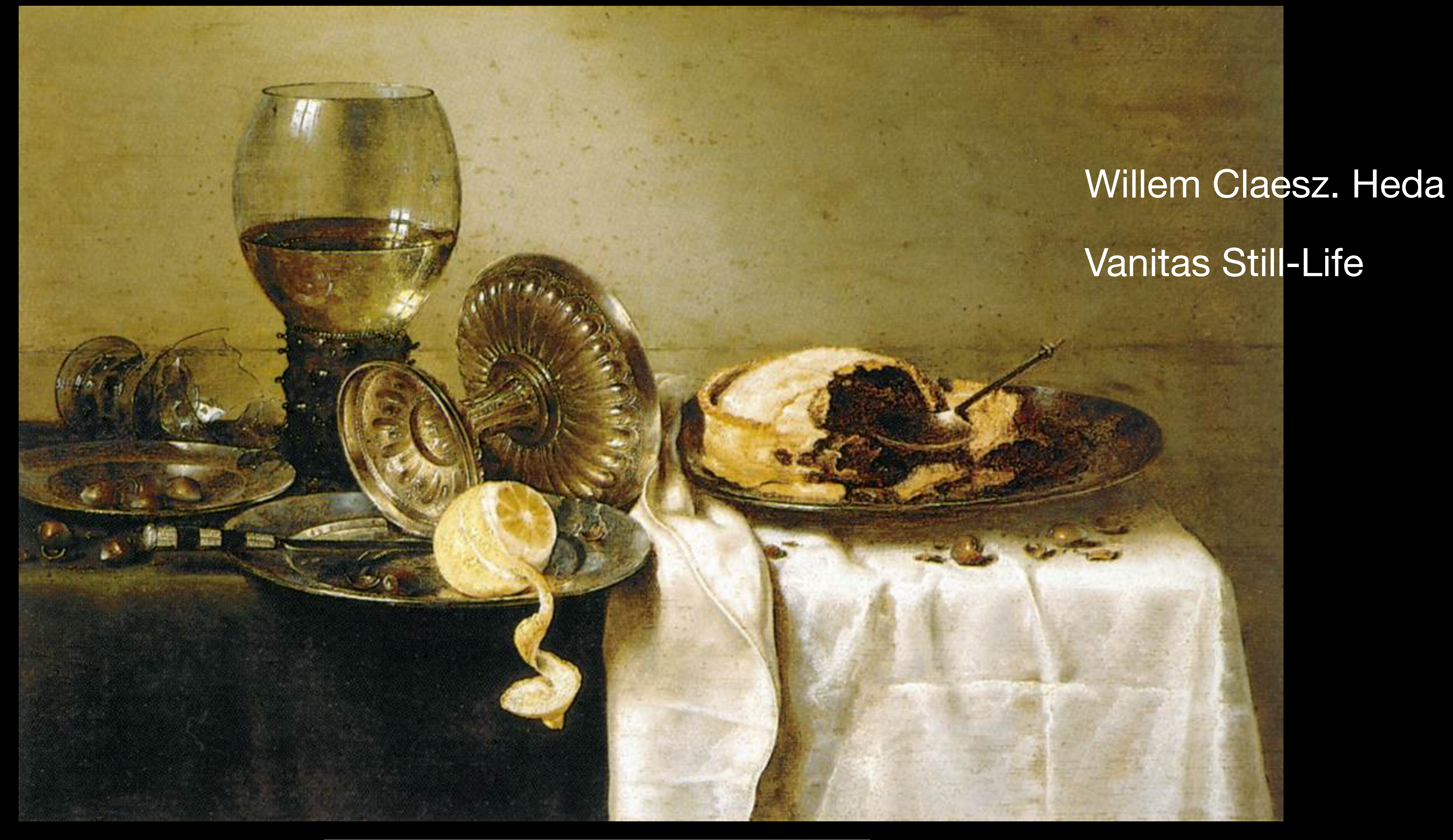
Still-Life with fruit Pie and various objects. 1634. Oil on Panel. 44cm x 68cm