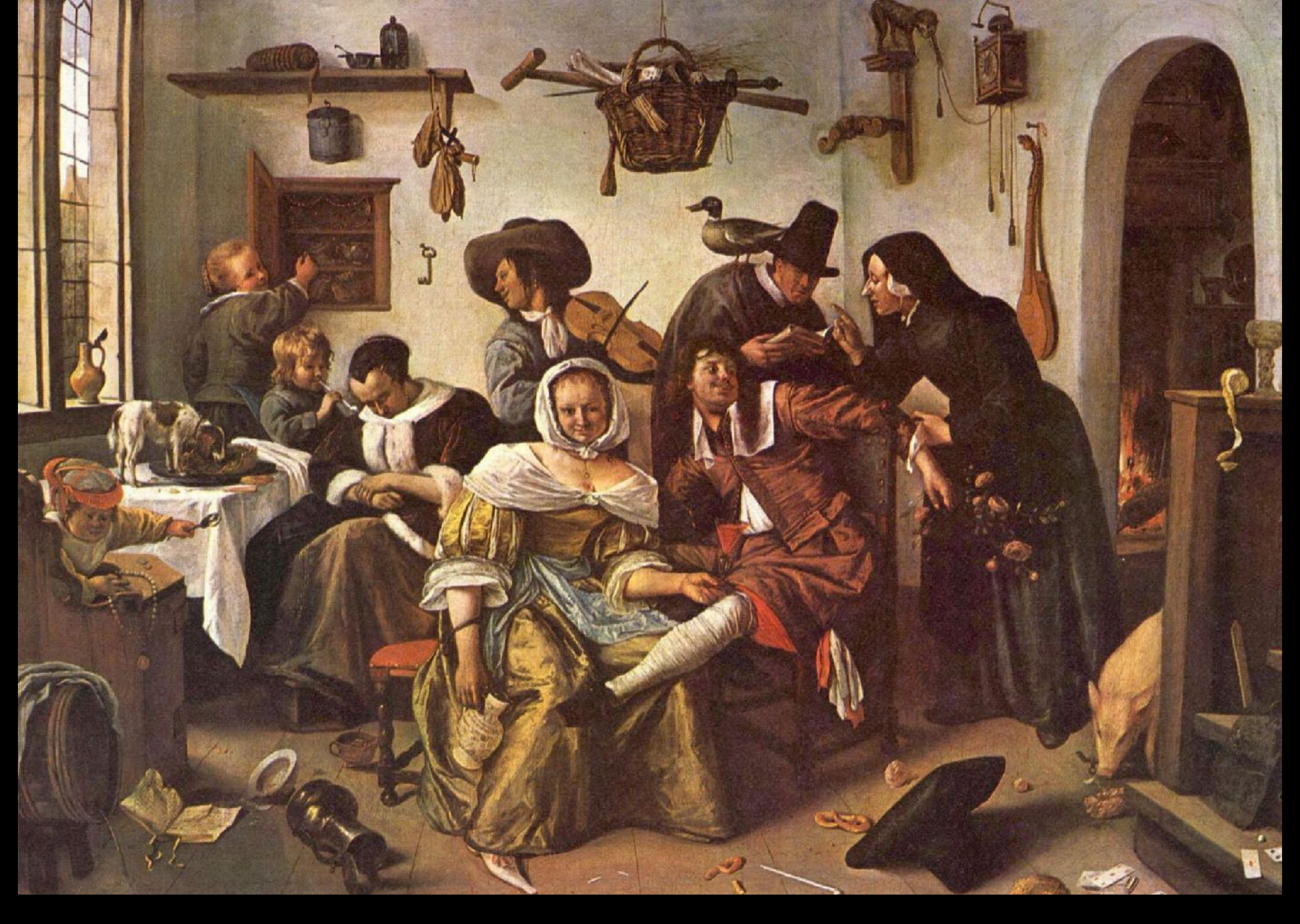
Jan Steen.Beware of Luxury.1663. Oil on Canvas. 105cm x 145cm