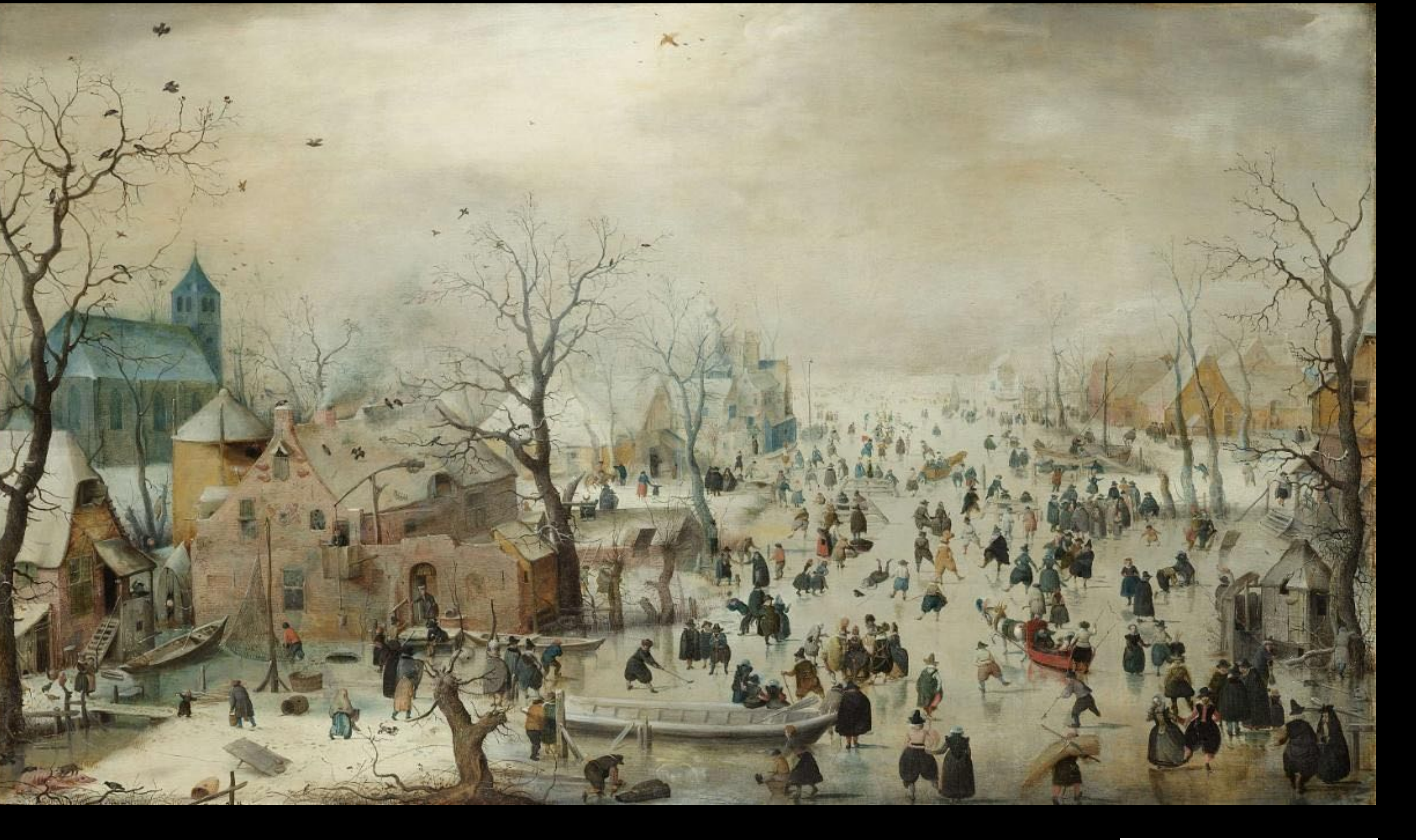
Hendrick Avercamp 1608