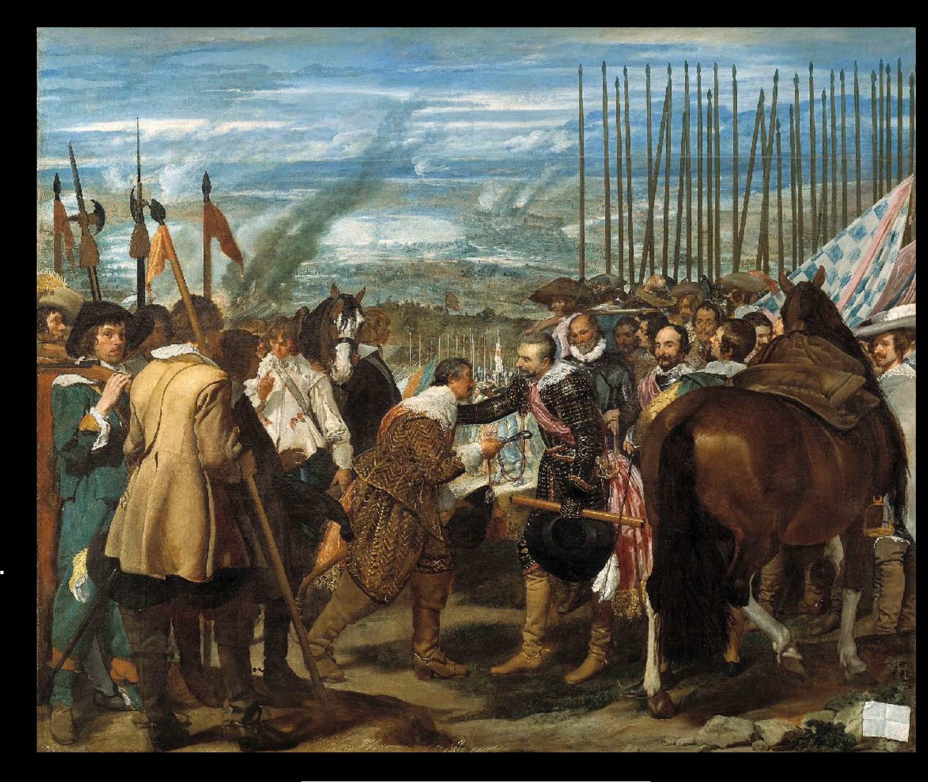
Velazquez. The Surrender of Breda

Dutch Golden Age Painting famous for Genre Painting rather than religious scenes. This means Everyday, Contemporary Life. It showed Class distinction in people, foods, interiors. The Painting is almost monochromatic.