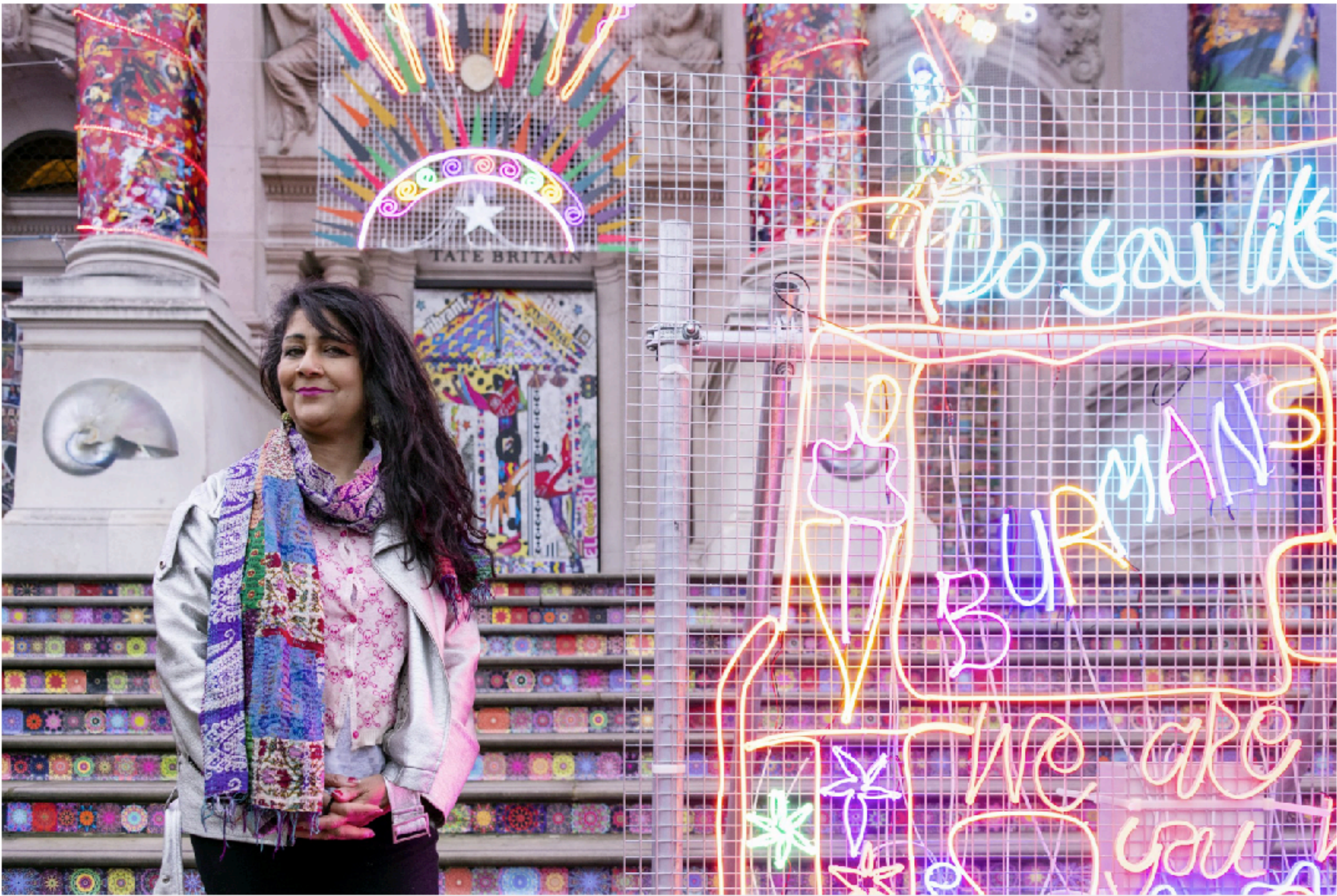
Chila Kumari Singh Burman – Remembering a Brave New World.