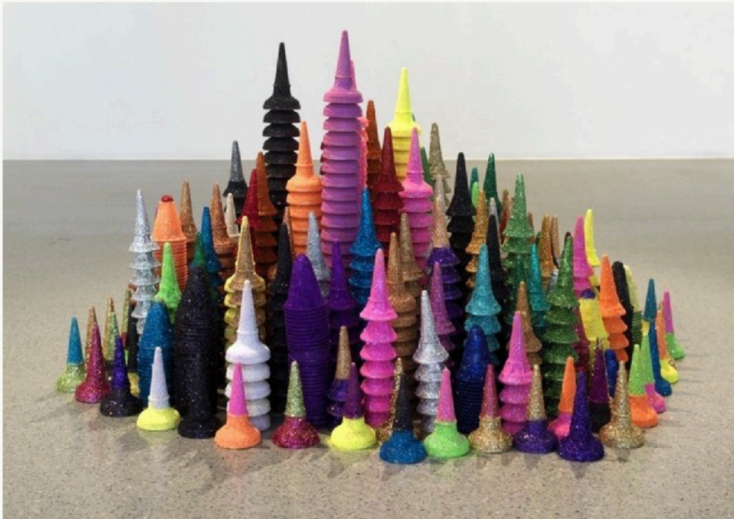
Chila Kumari Burman, Cornets and Screwballs Go Vegas, 2010

'My father was a tailor and magician but when the family arrived from India to Merseyside in the 1950s he couldn't find work so he ended up buying an ice cream van and became an ice-cream man. His van was called Burman's and it had a big tiger on top.'