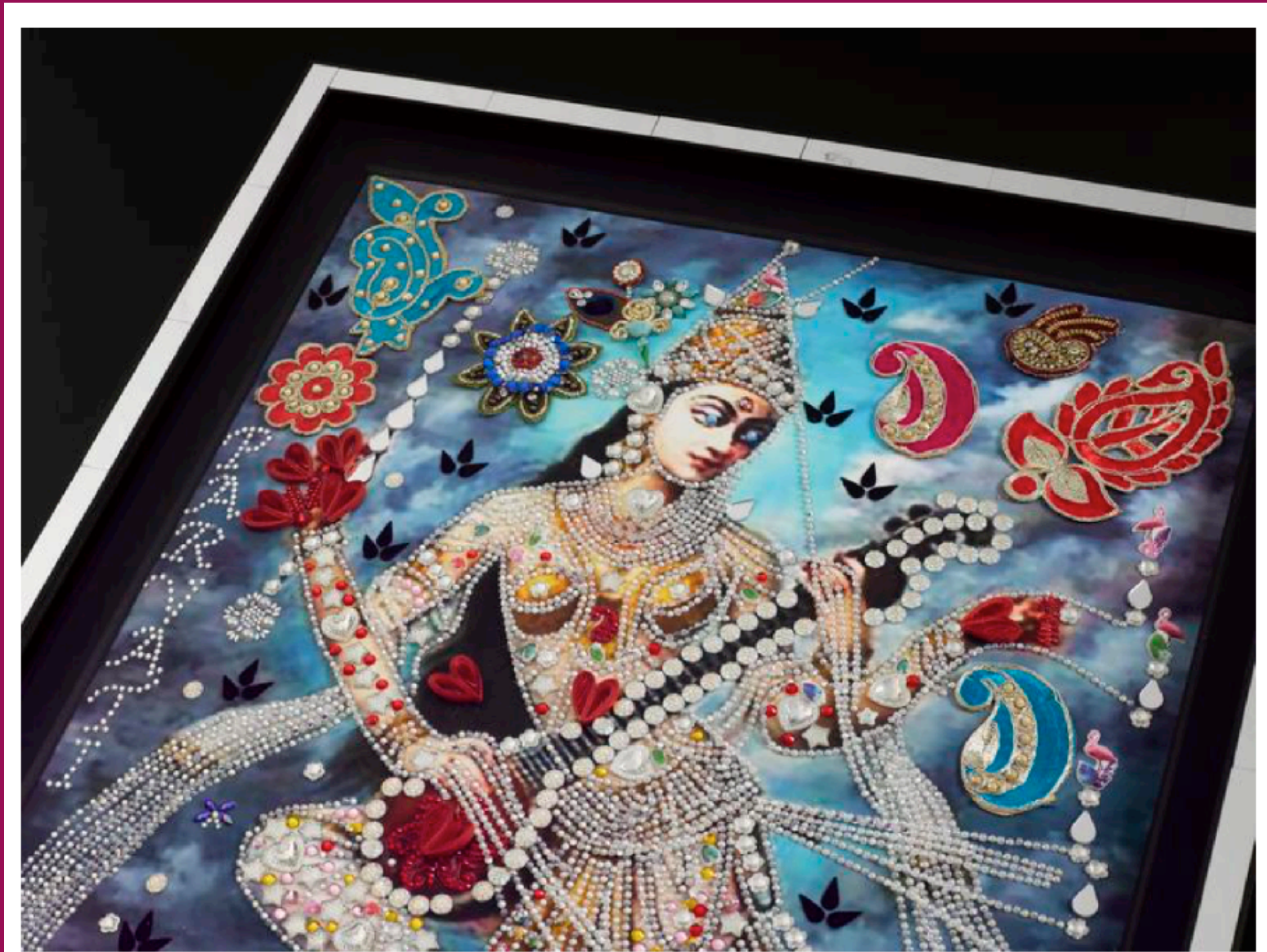
Mixed-media collage 'Parvati - Hindu Goddess' © Chila Burman, 2017