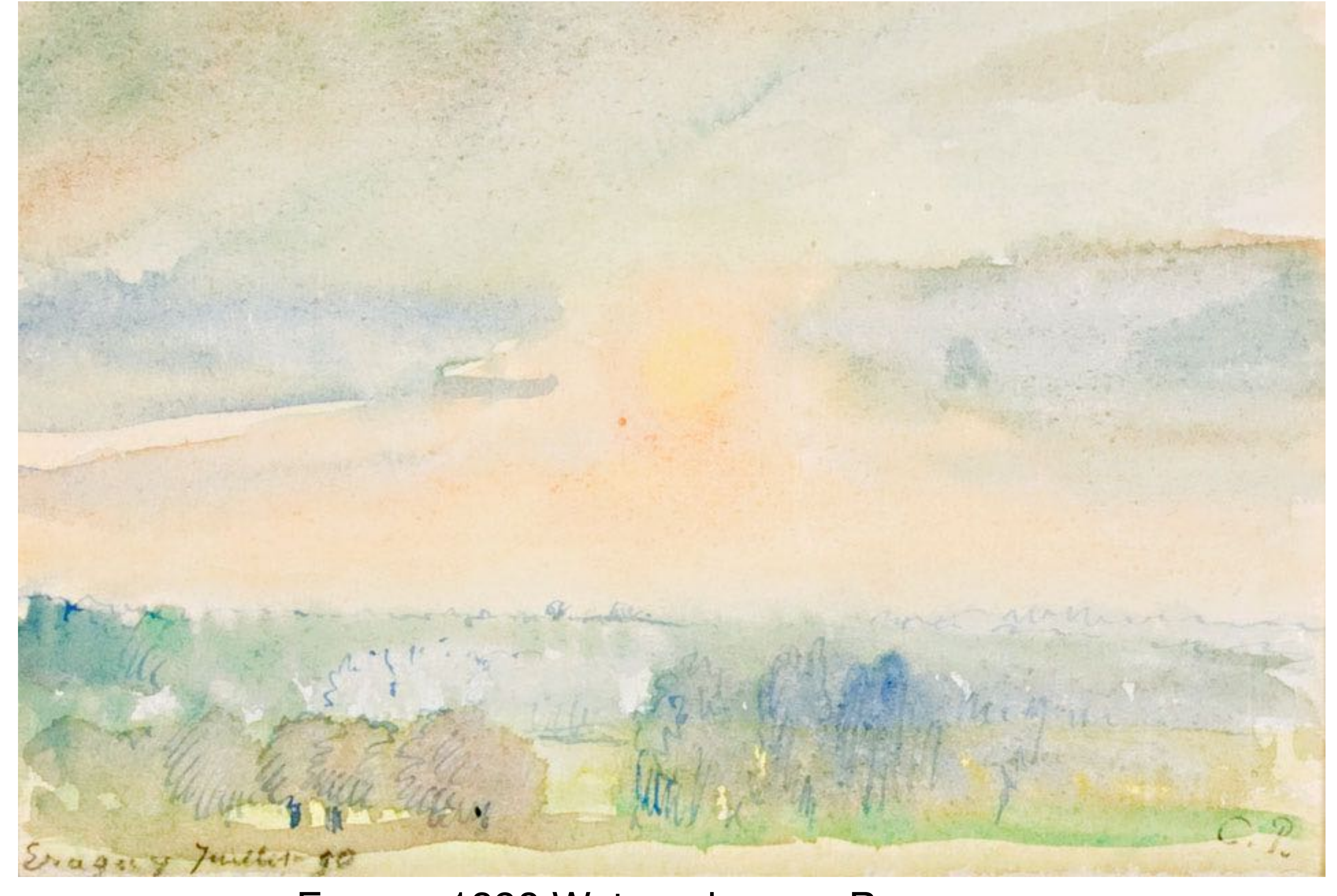
Eragny, 1890 Watercolour on Paper