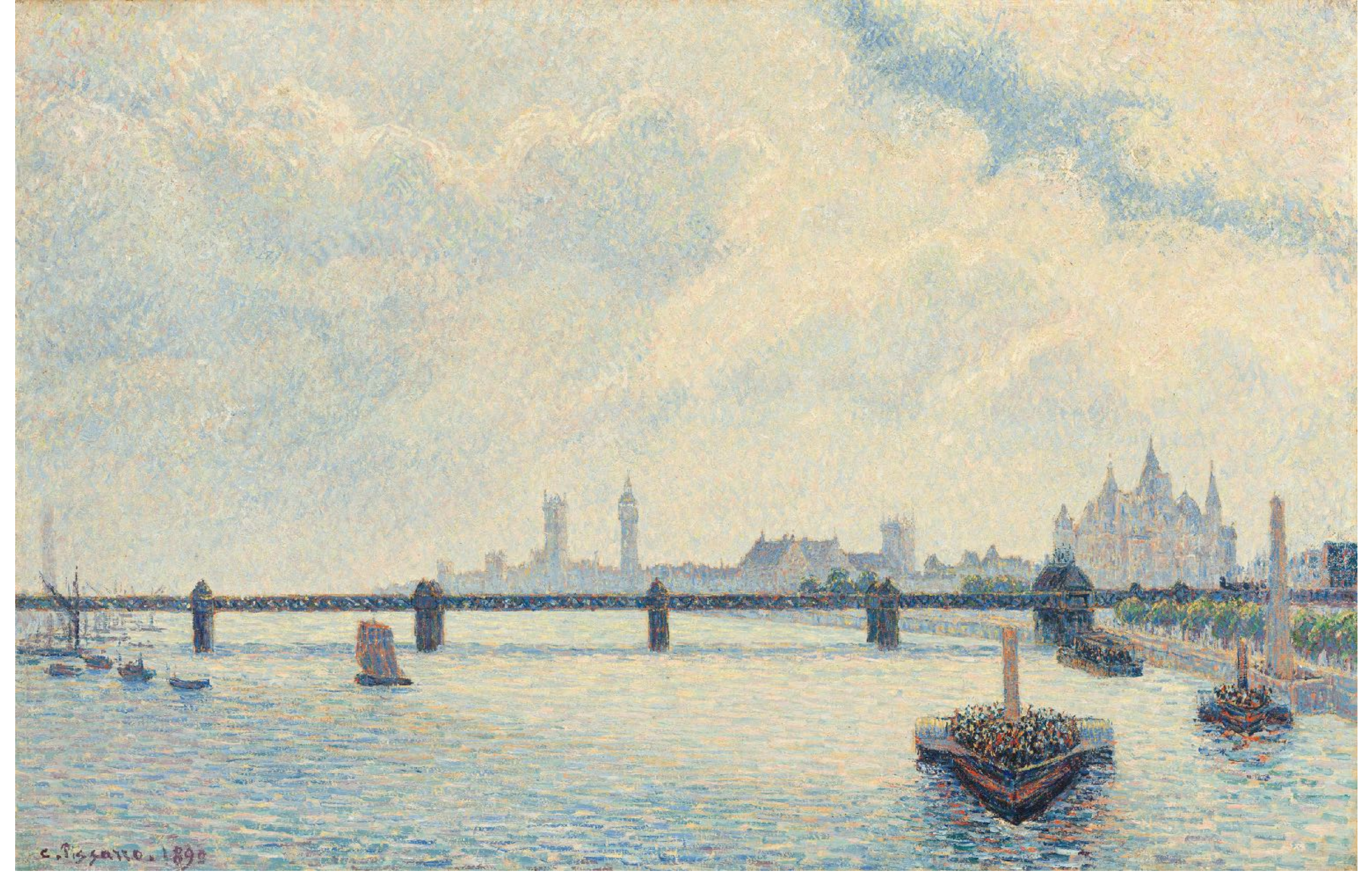
Charing Cross Bridge, 1890