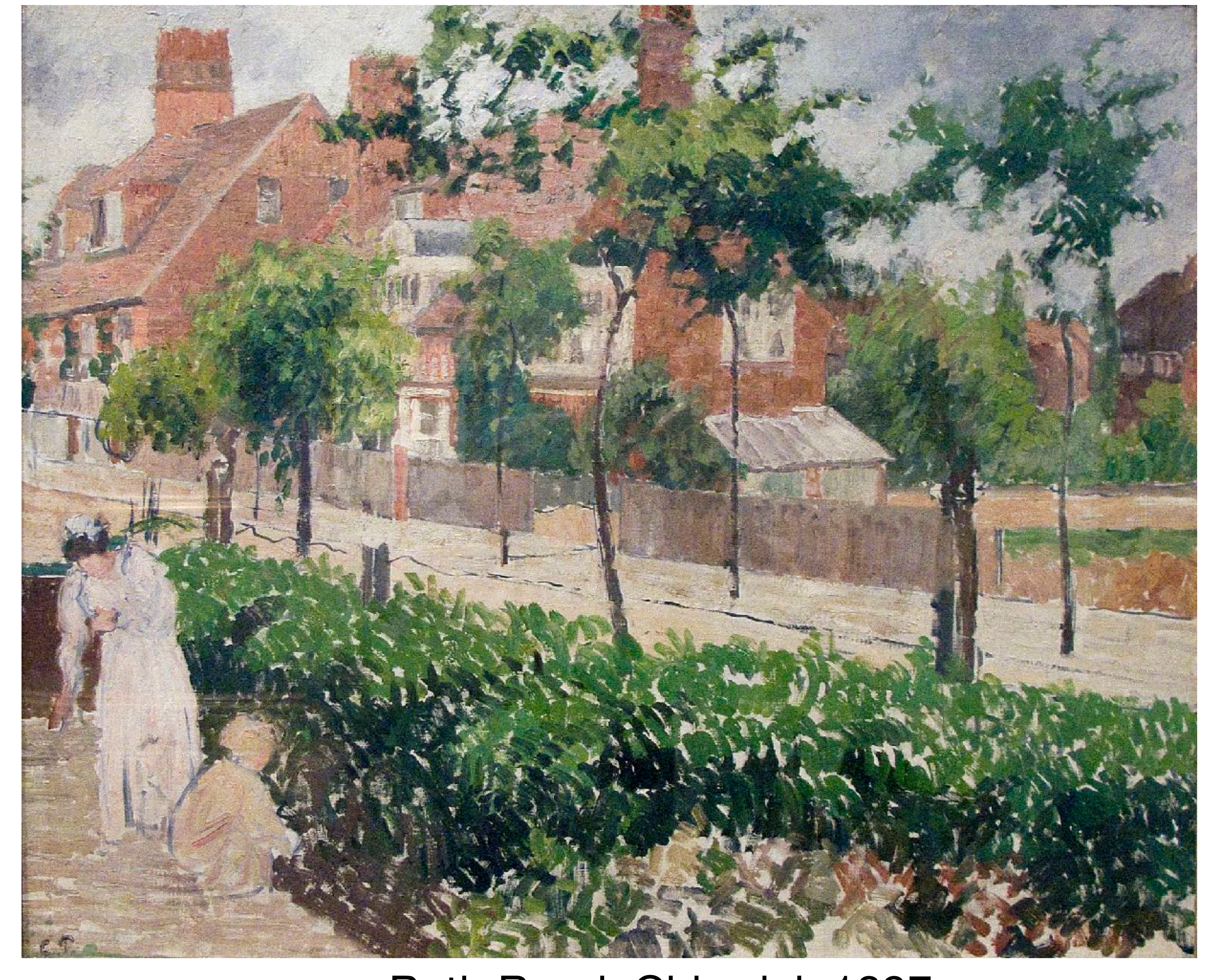
Bath Road, Chiswick 1897