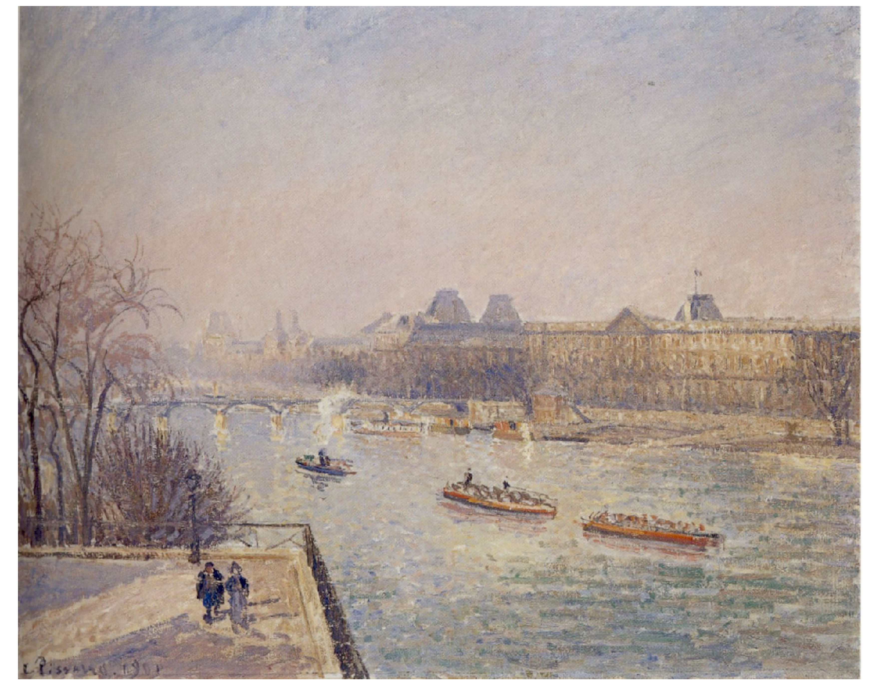
Morning, Winter Sunshine, Frost, the Pont-Neuf, the Seine, the Louvre, Soleil D'hiver Gella Blanc. (1901) Oil on Canvas. 73 cm x 92 cm