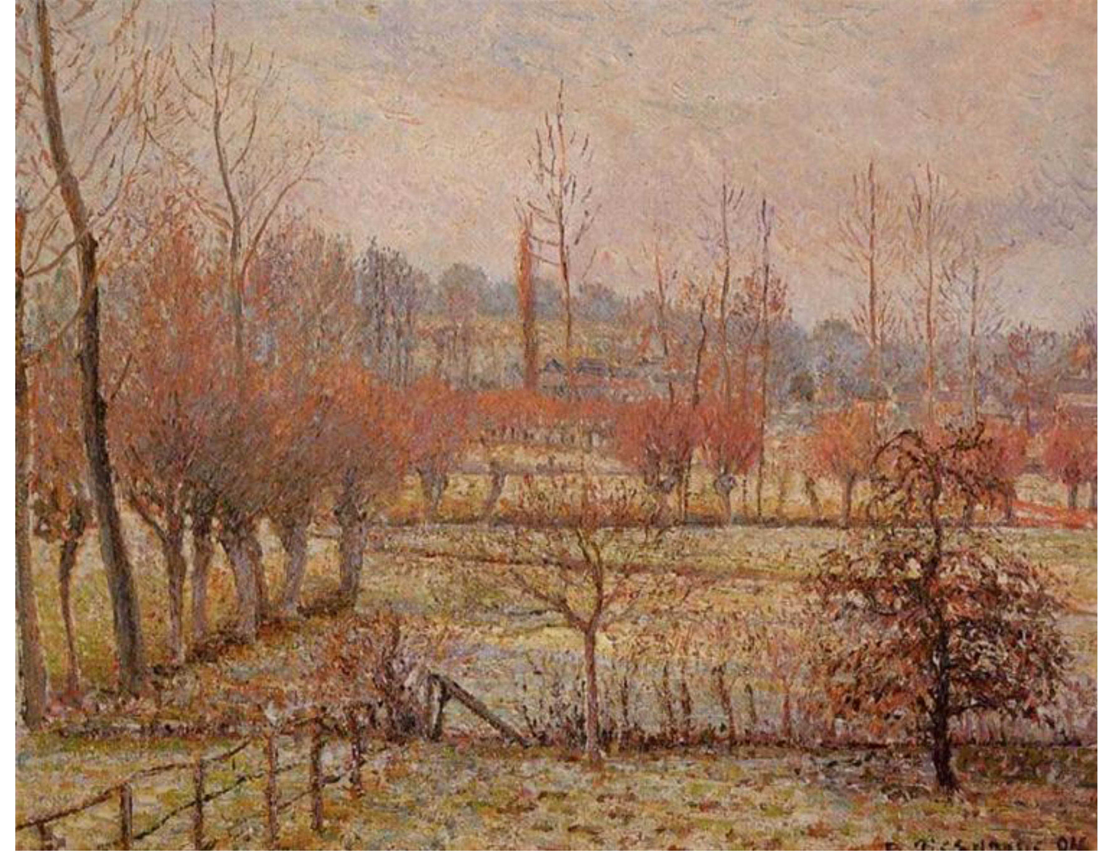
Snow Effect at Eragny. (1894) Oil on Canvas.92.5 x 73.5 cm