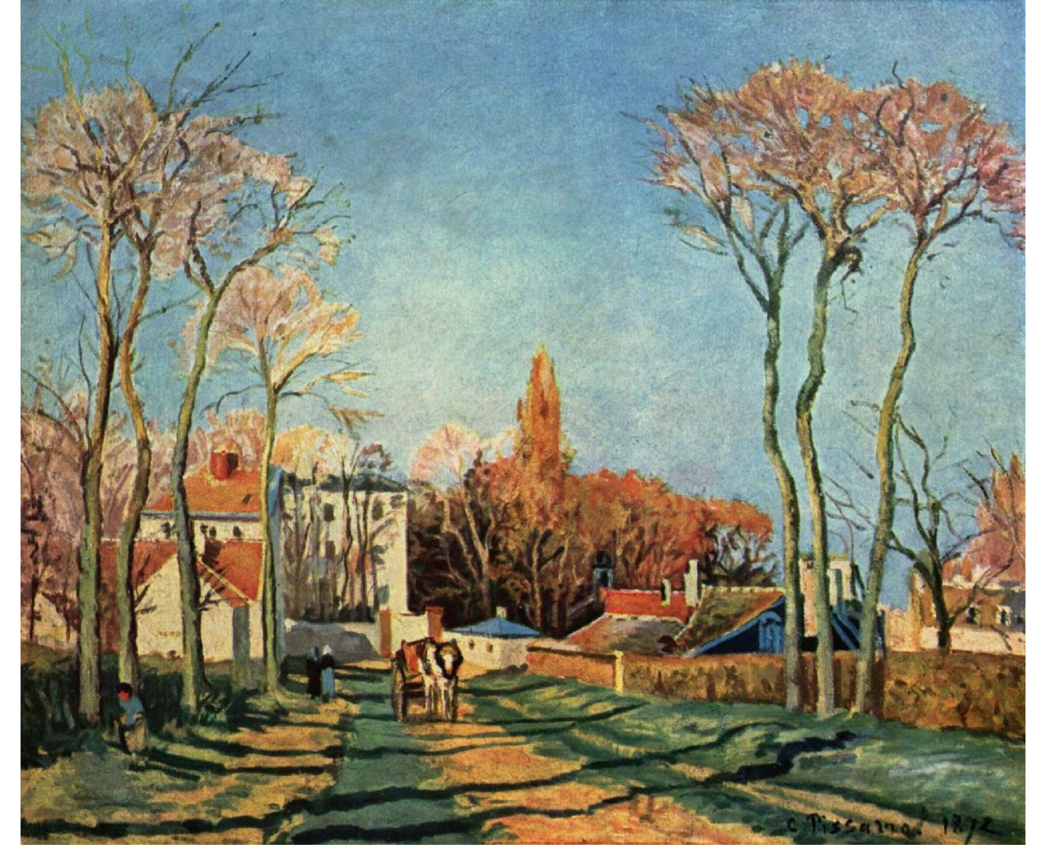
Entrée du village de Voisins, 1872.