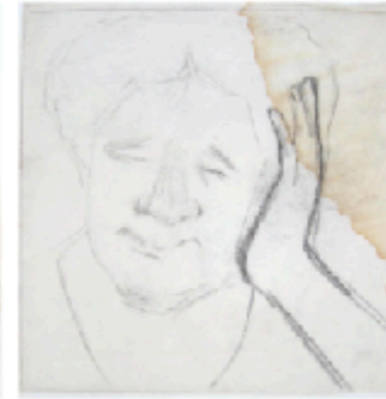
Beatriz González Las Delicias 5 , 1998 Charcoal on paper, 33 x 31.5 cm