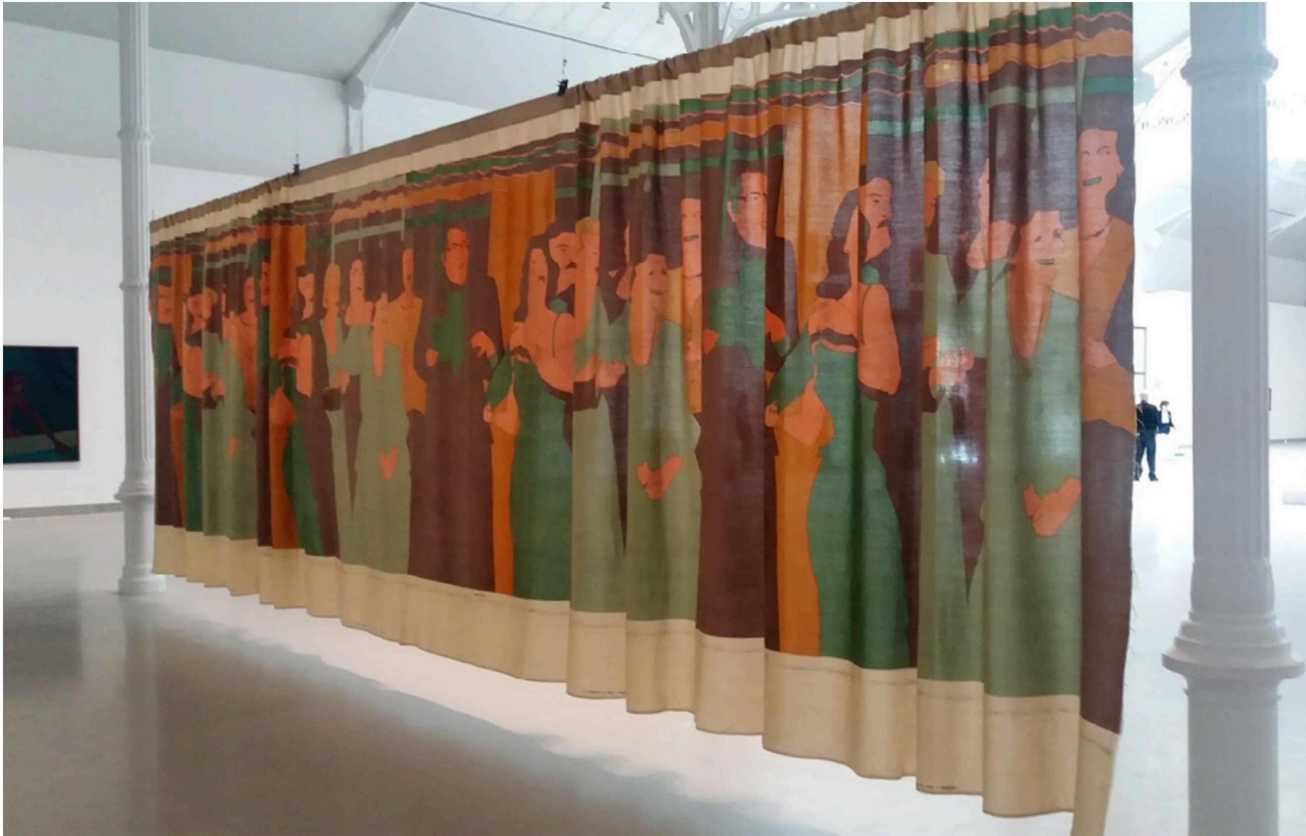
Interior Decoration 1981