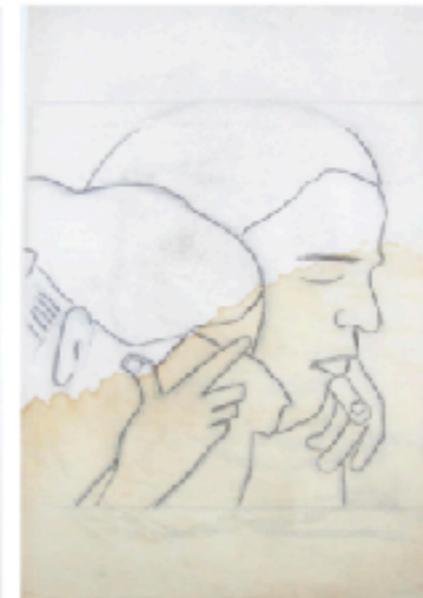
Beatriz González Las Delicias 7 , 1998 Charcoal on paper, 46.7 x 31.7 cm