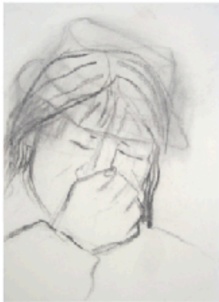
Beatriz González Las Delicias 3 , 1998 Charcoal on paper, 29.7 x 42 cm

It was her experience of La Violencia (the violence) during the 1940s and '50s that inspired Colombian artist Beatriz González to build evidence and comment on the corruption of the Colombian government. González began to draw inspiration from the mass media in the 1960s, and over the years amassed a huge number of newspaper clippings that she returns to repeatedly. Like Golub and Spero, González has employed the strategy of repetition, for example with her series of drawings of the former president Julio César Turbay (1978–84), who she transforms into a symbol of corruption. Las Delicias (1998) is a series of drawings of weeping figures: the grieving parents of sons who were kidnapped by FARC, the Revolutionary Armed Forces of Colombia, a guerrilla movement involved in the Colombian armed conflict that lasted from 1964 to 2017. González is not interested in the particulars of their appearance. She has stripped out all superfluous visual information, and focussed on the head and shoulders, which are presented face on, using sketchy, downturned lines of charcoal to emphasise the dejection of her subjects.