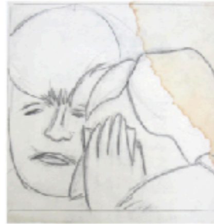
Beatriz González Las Delicias 4 , 1998 Charcoal on paper, 32.2 x 31.8 cm