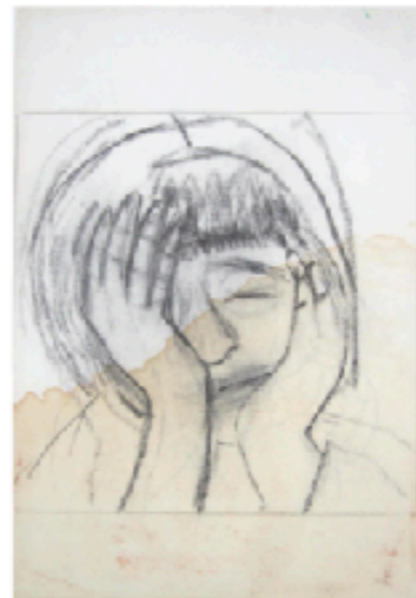
Beatriz González Las Delicias 6 , 1998 Charcoal on paper, 46.8 x 32.3 cm