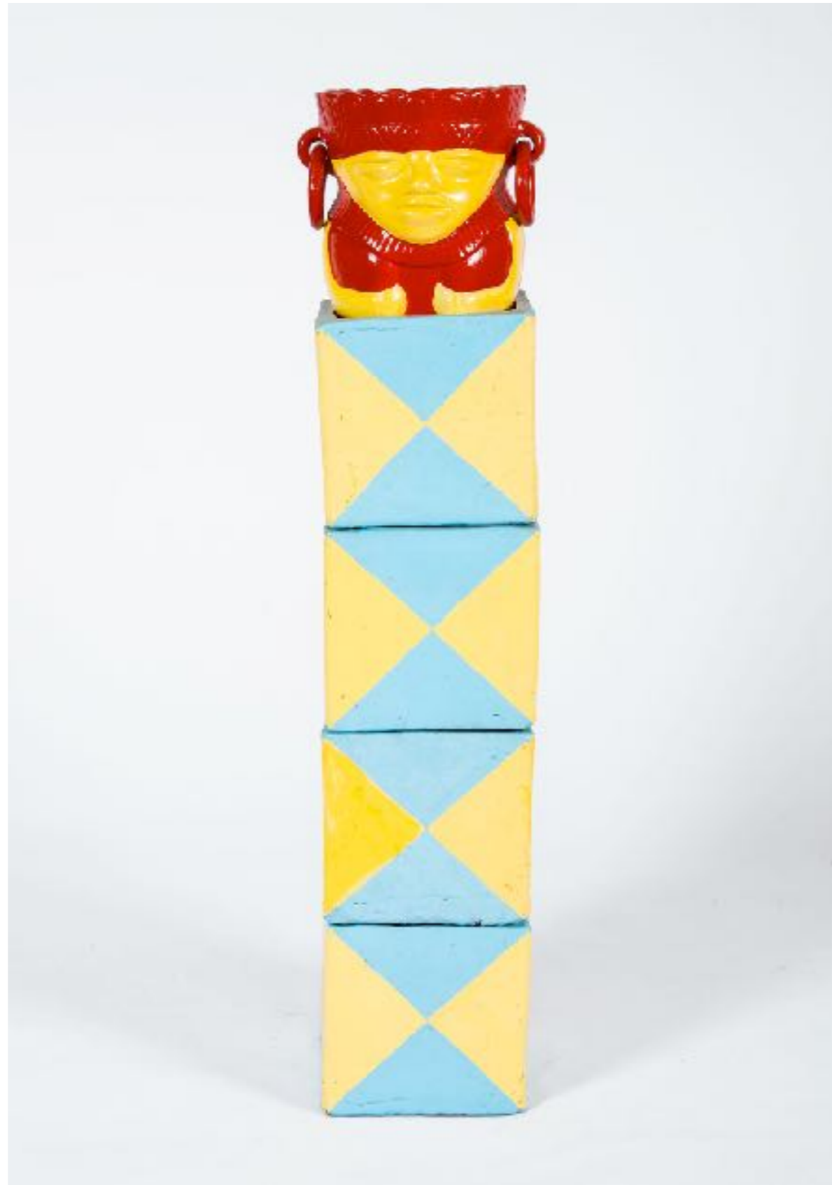
Beatriz González. Villa María, 1985. Enamel on pottery. 38 9/16 x 7 13/16 x 7 13/16 inches.