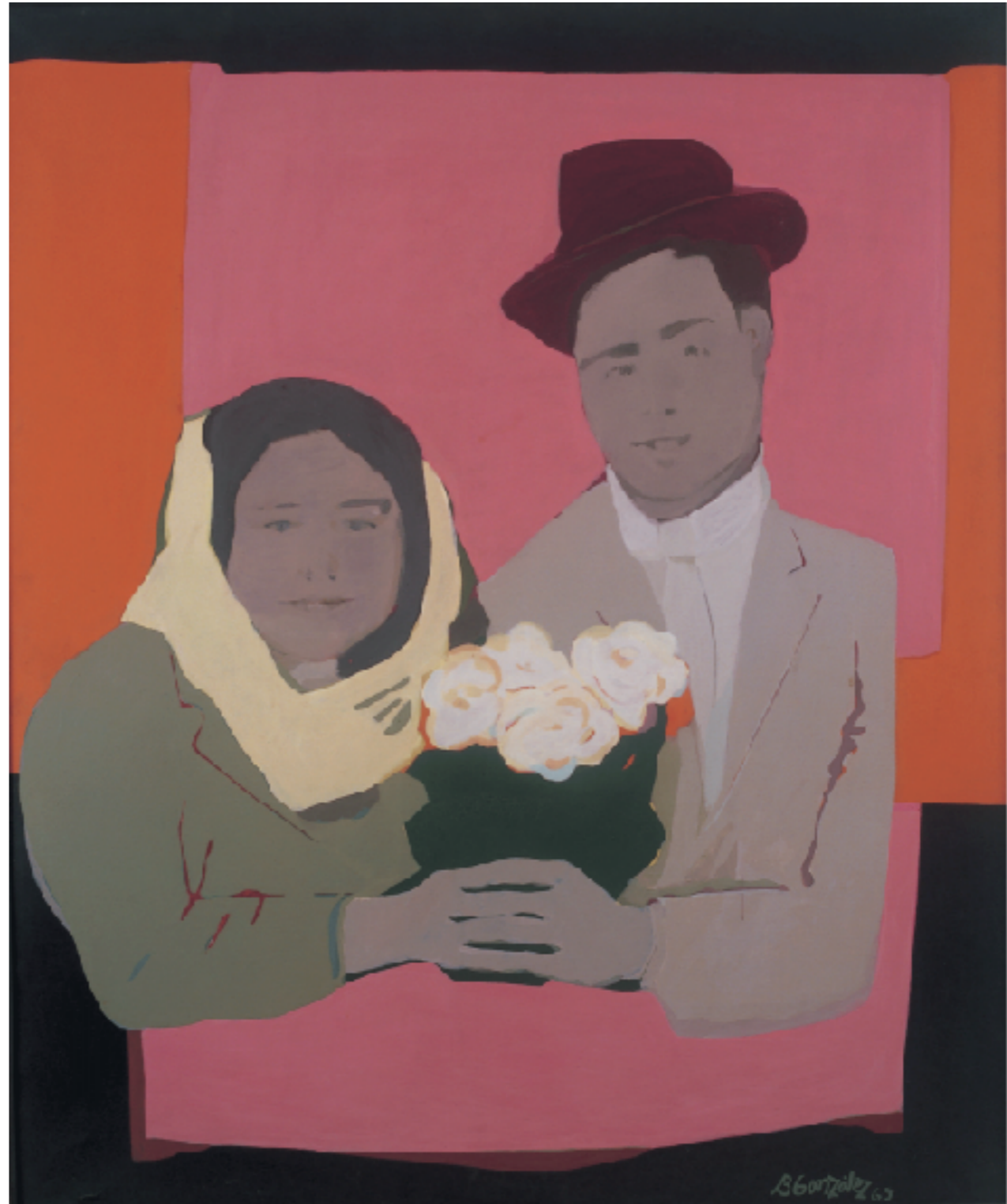
The Suicide of the Sisga. 1965