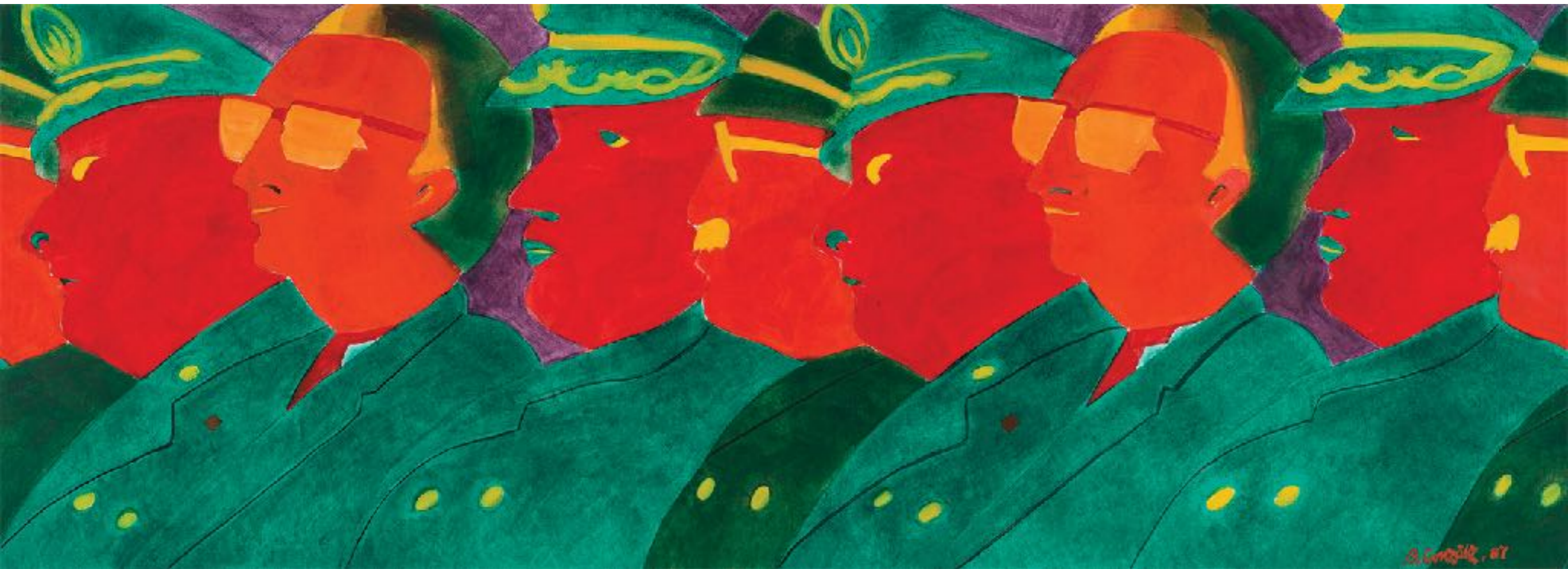
Beatriz González. Los papagayos, 1987. Oil on paper. 29 1/2 x 78 inches.