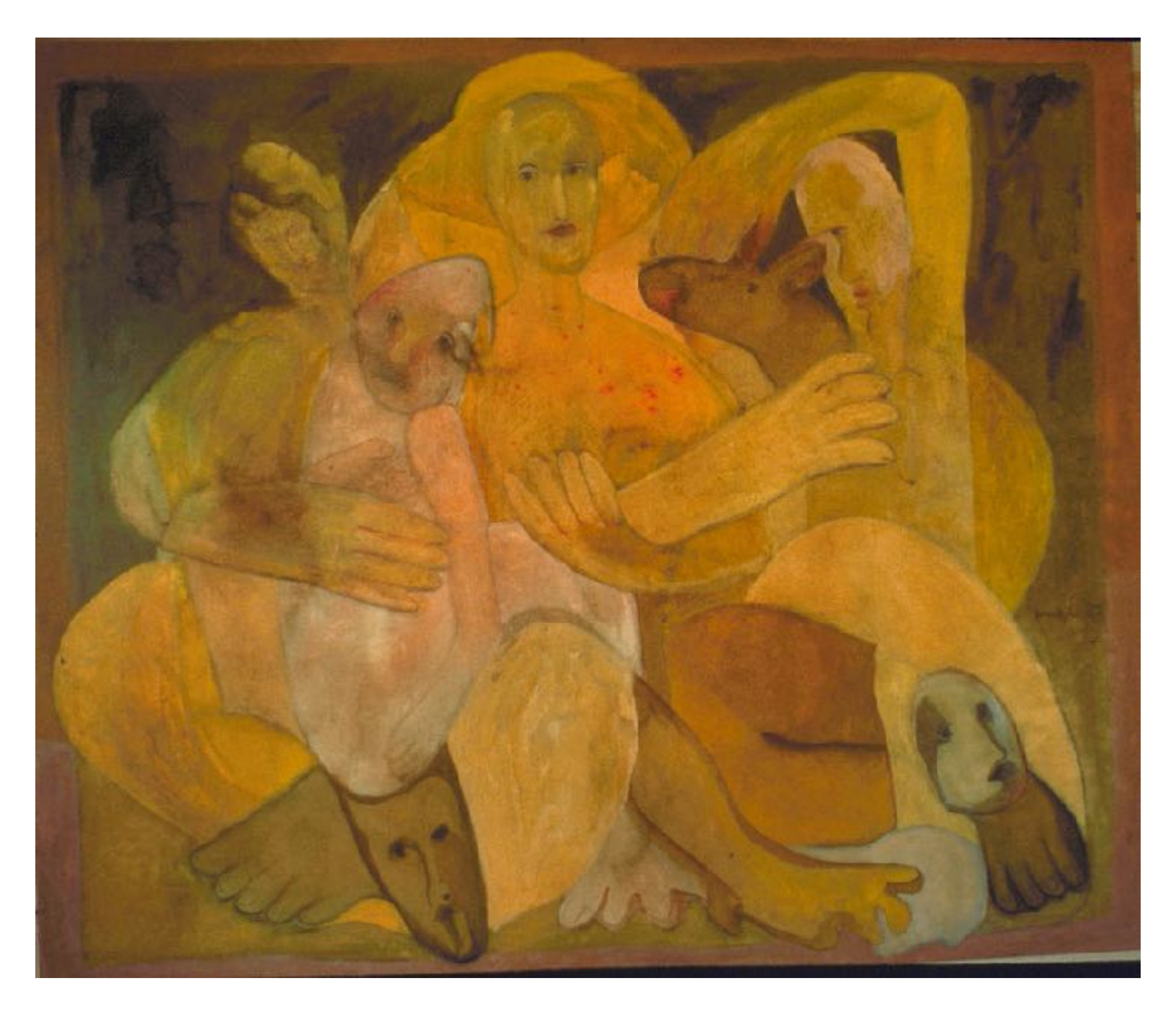
The painting 'Allegory Series XII' deals with the idea that human beings possess a tendency to reject certain things in life without questioning their motivations. (1987)