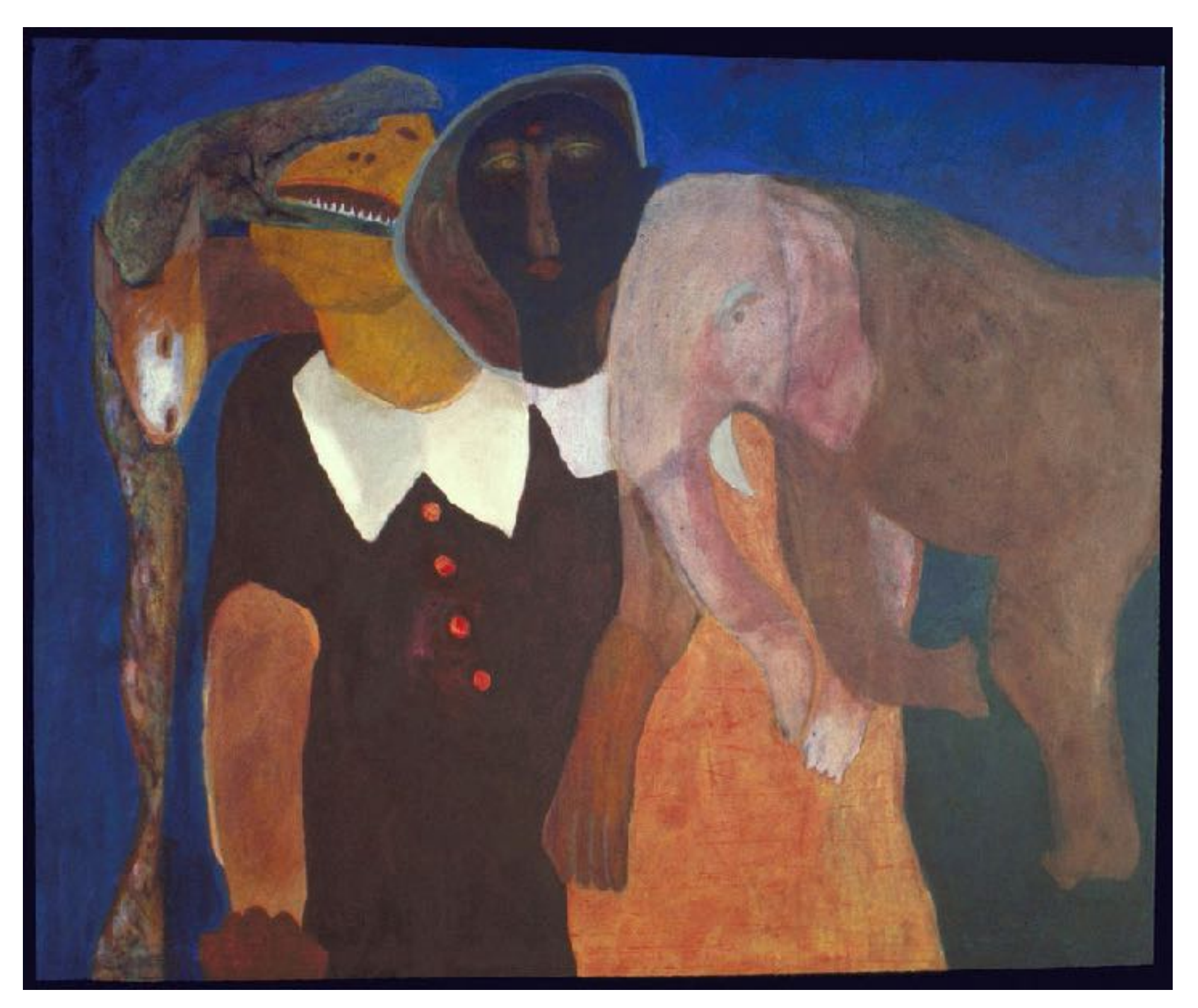
The painting 'Allegory Series III' by Amal Ghosh comments on the relationship between colonialism and the process of resisting forces of oppression. In the painting, the figure wearing a European costume struggles with an elephant, who is a symbol of purity and innocence, and also represents the Indian god Ganesh who is the remover of obstacles. (1987)