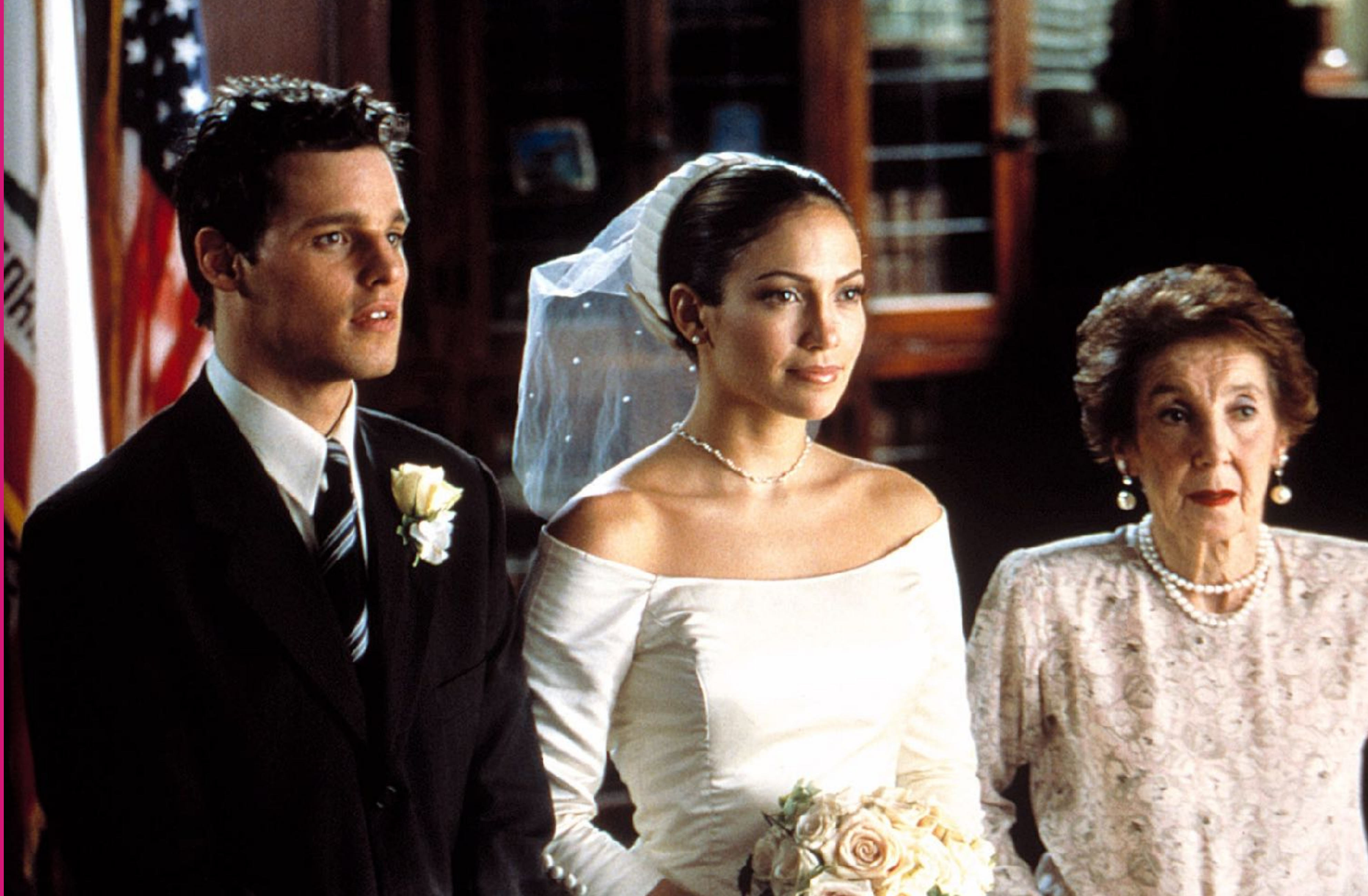
The Wedding Planner, 2001