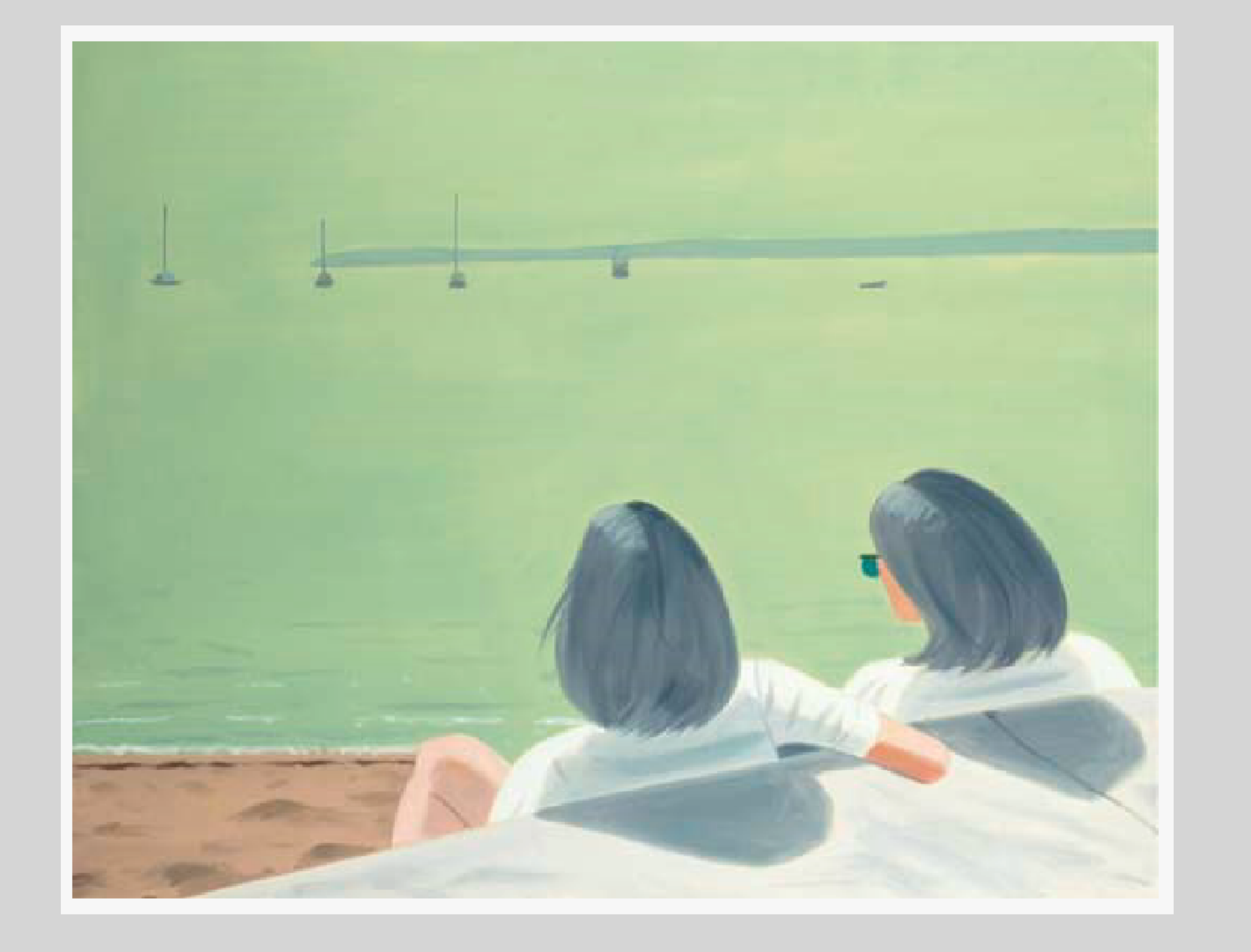
Alex Katz 99 Harbor # 3' Oil on canvas 122 x 152.5cm