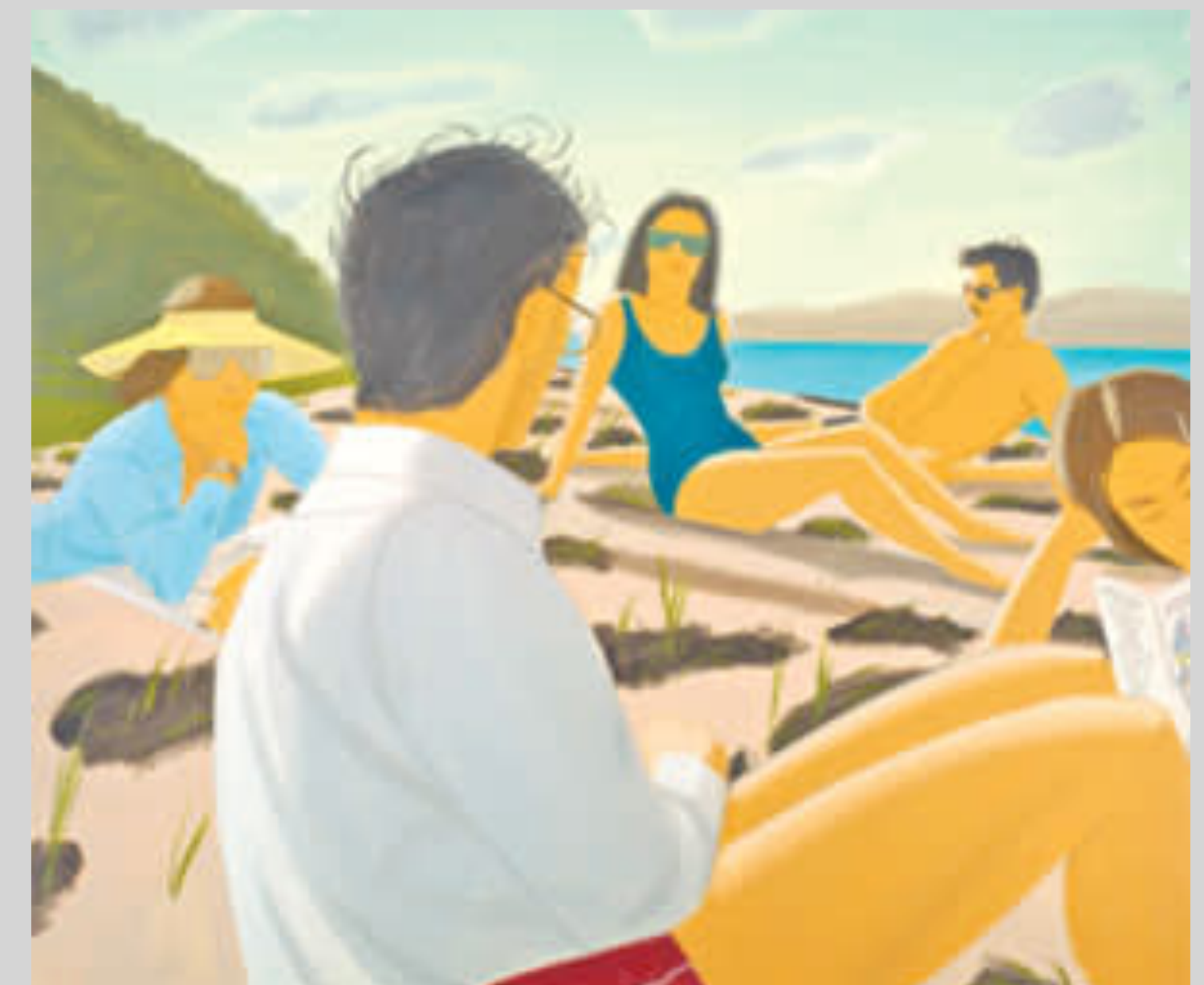
STUDY FOR "ROUND HILL" 1976 Oil on masonite 30.48 cm x 35.56 cm30.48 cm x 35.56 cm