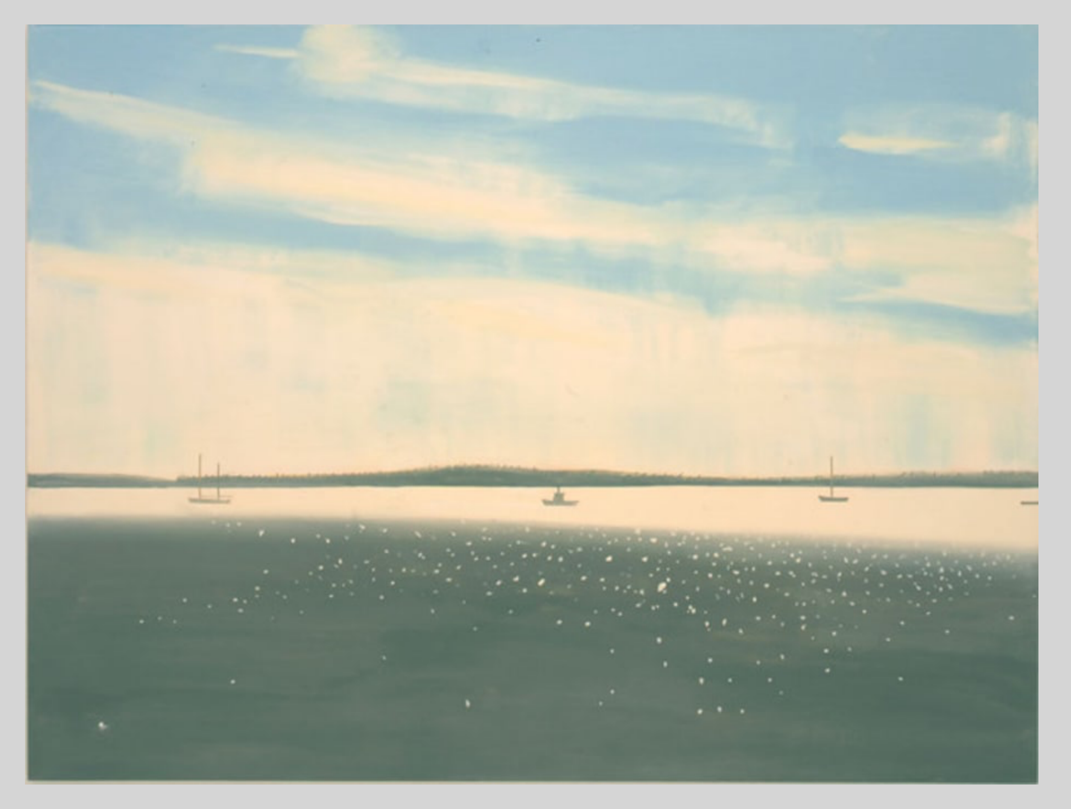
Sparkling Sea 1, 2007 Oil on canvas 183 x 244 cm