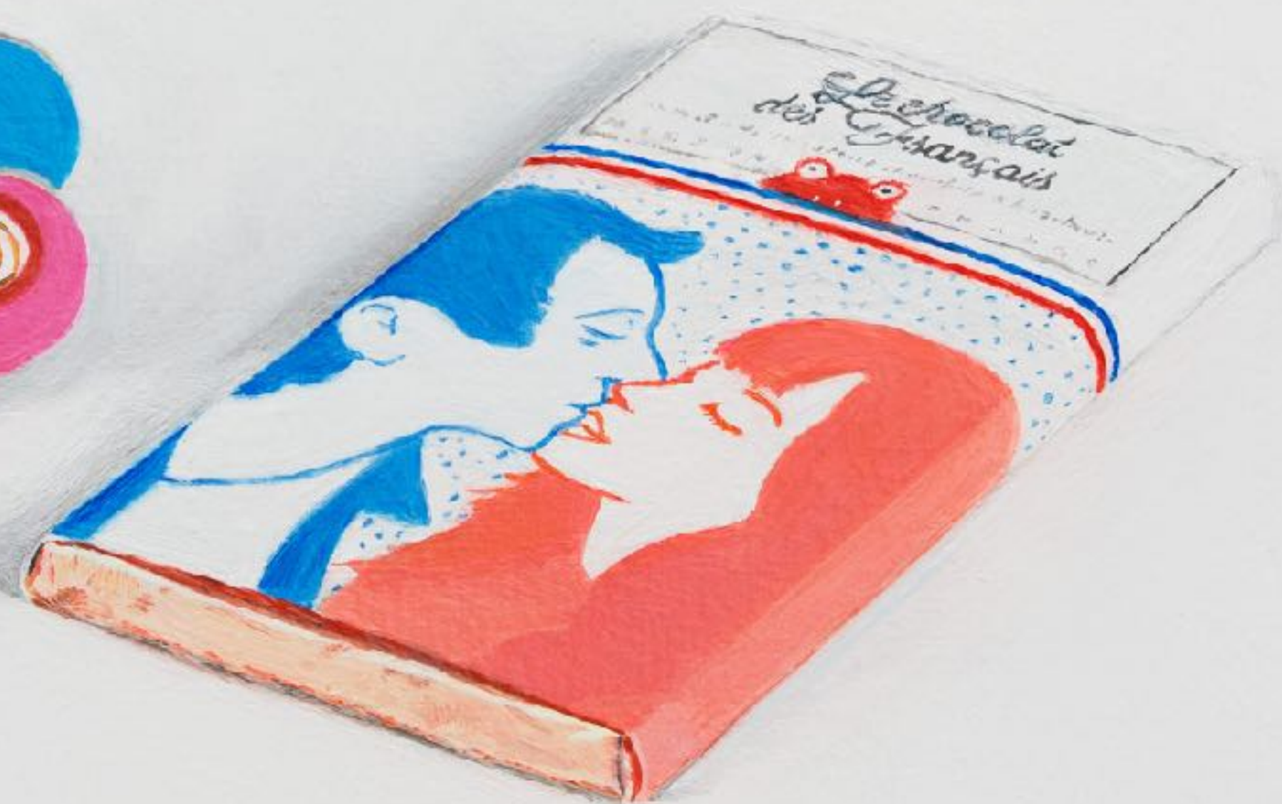
Still Life, 2018