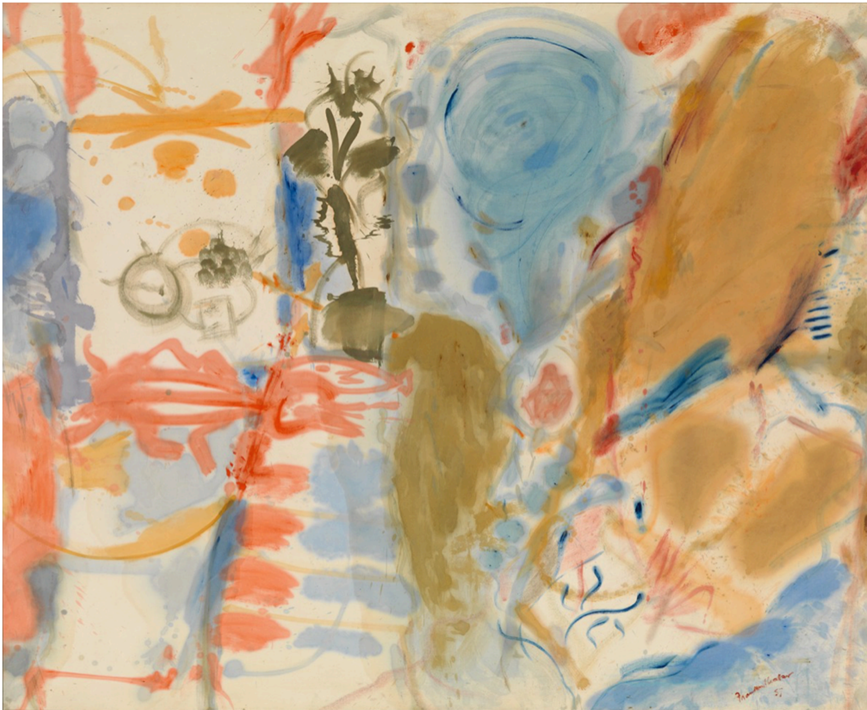
Helen Frankenthaler, Western Dream, 1957, Helen Frankenthaler Foundation, New York © 2017 Helen Frankenthaler Foundation, Inc./Artists Rights Society (ARS), New York.