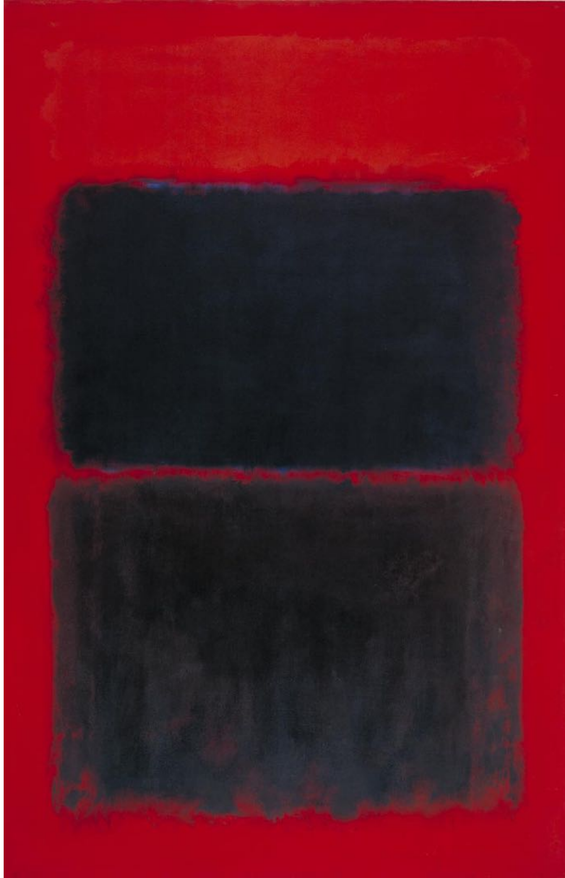
Light Red Over Black