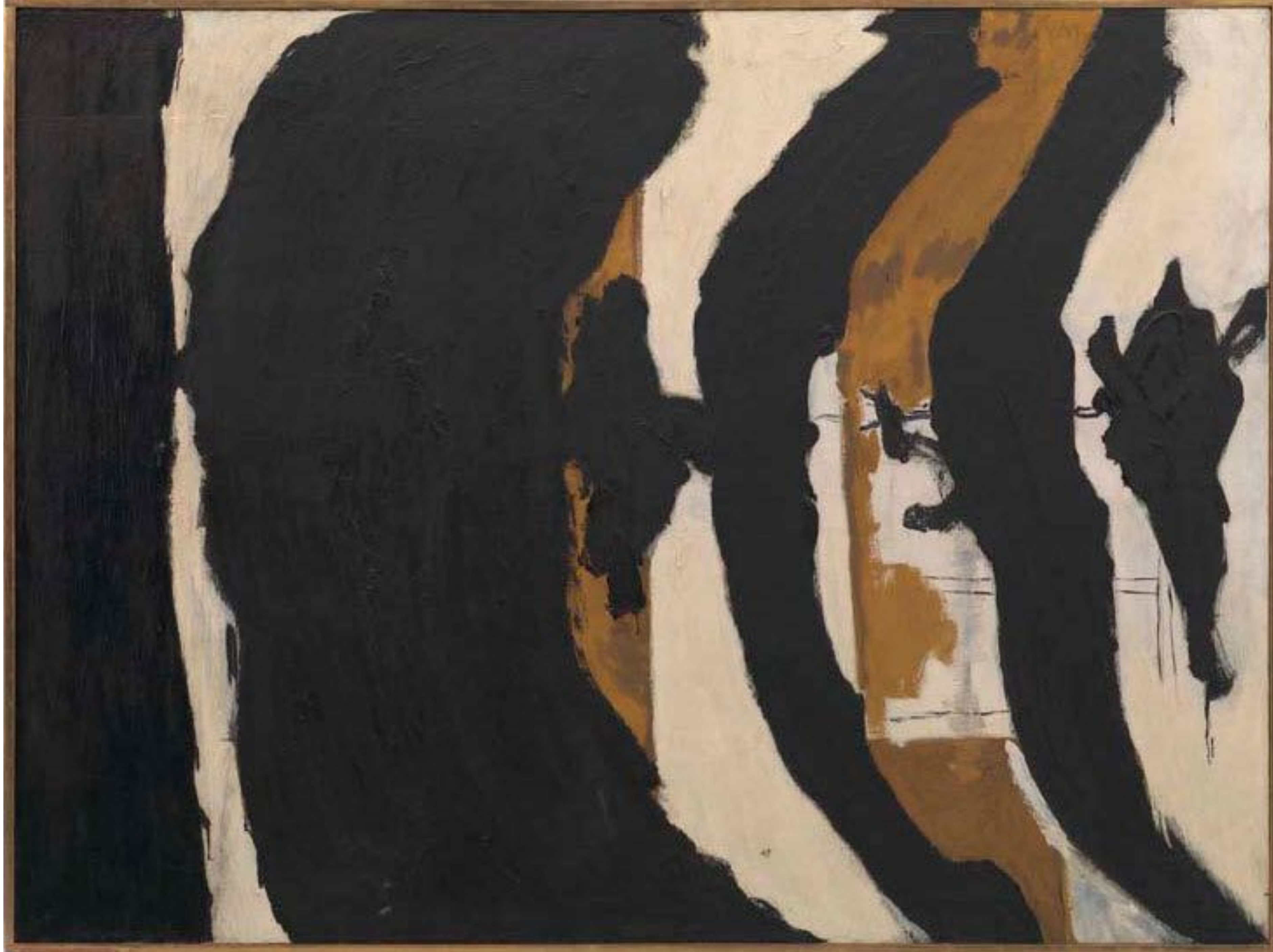
Robert Motherwell, Wall Painting No III , 1953. Oil on canvas. 137.1 x 184.5 cm.